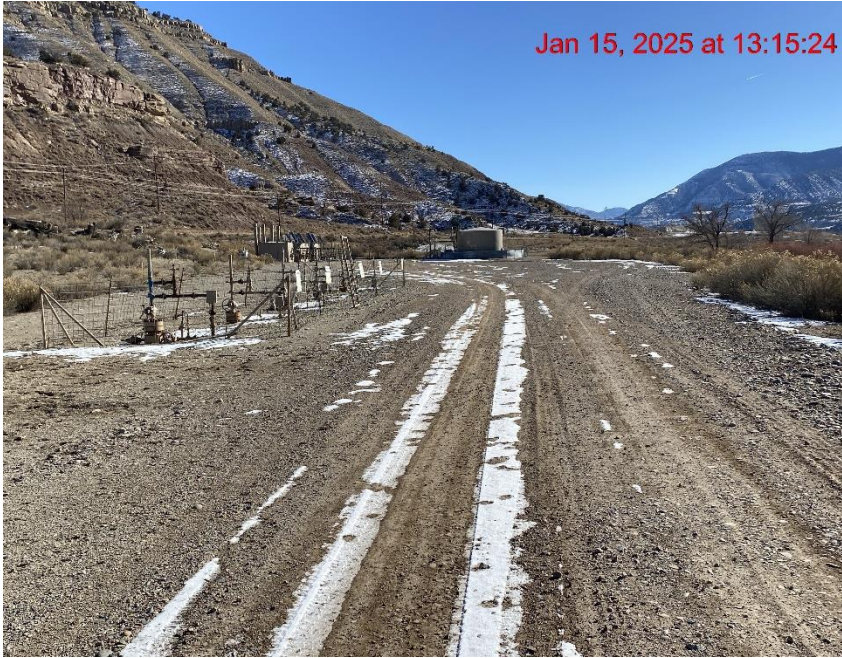
Location Overview – Photo #05959