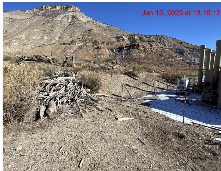
Debris Pile Near Separators – Photo #05968