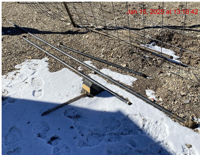
Stored Supplies – Photo #05967