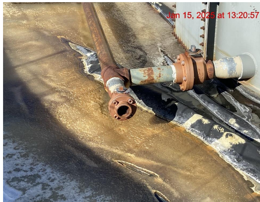
Open-Ended Manifold Line/Oily Waste – Photo #05975