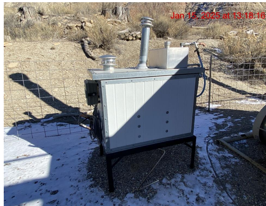
Unused Equipment – Photo #05965