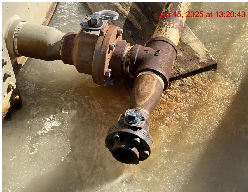
Open-Ended Manifold Line/Oily Waste – Photo #05974