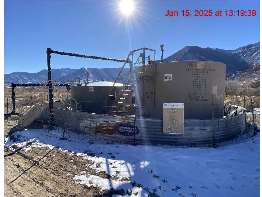
Location – Photo #05970