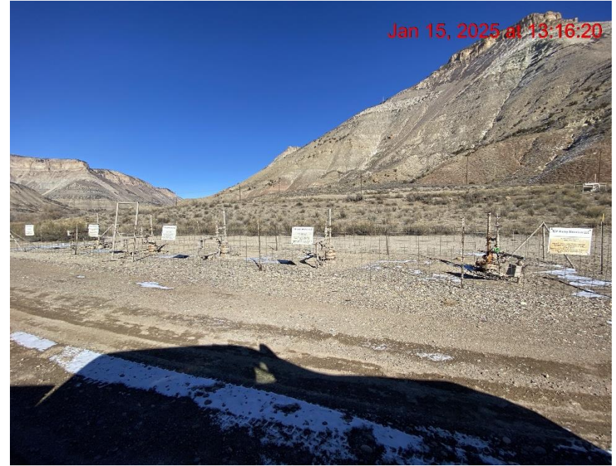
Location – Photo #05961