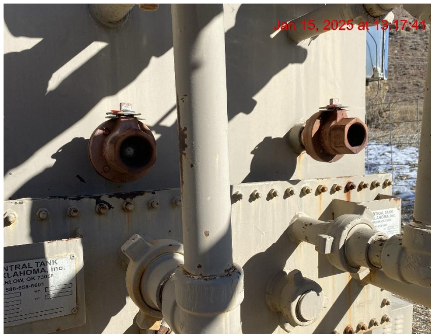
Open-Ended Lines – Photo #05963