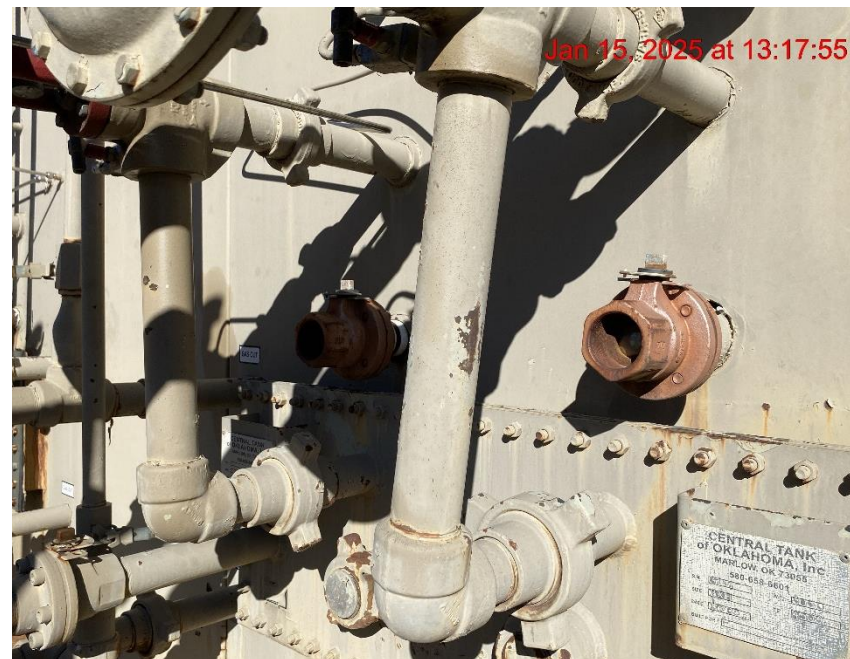
Open-Ended Lines – Photo #05964