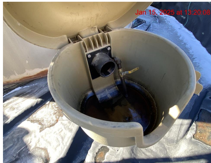
Open-Ended Load Line – Photo #05972