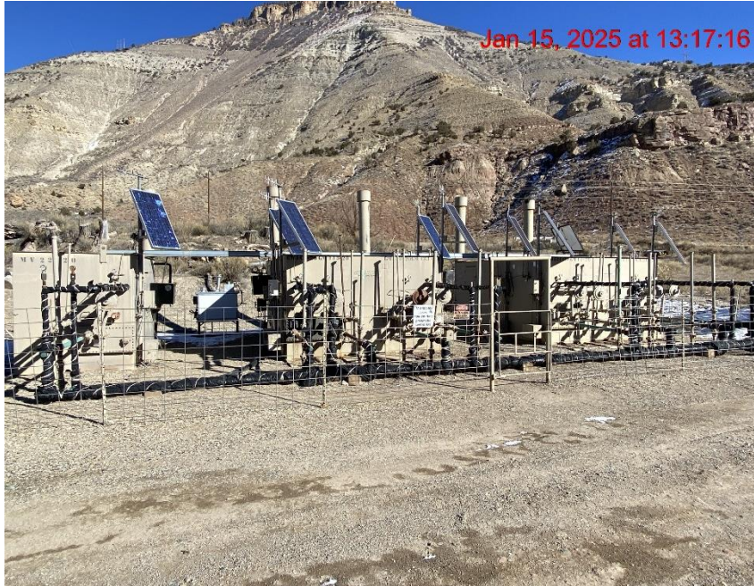
Location – Photo #05962