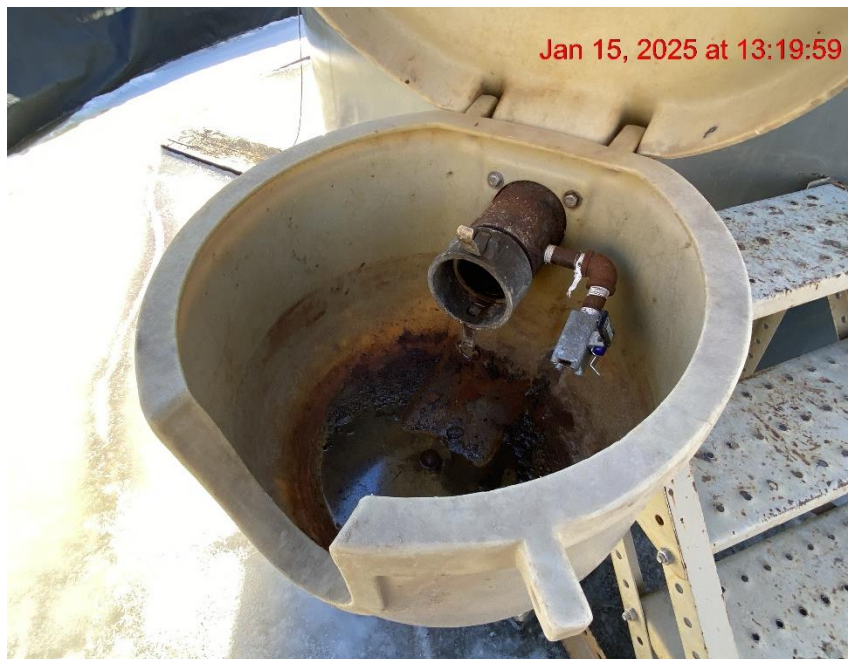
Open-Ended Load Line – Photo #05971