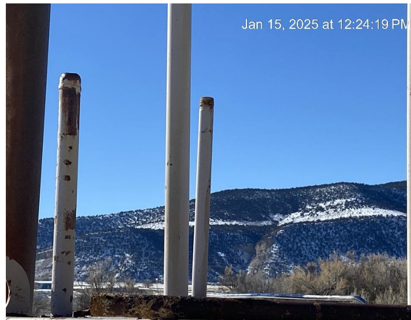
Vent missing cap