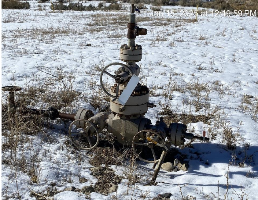
Displayed well sign