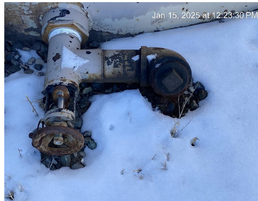
Oily waste from leaking valve