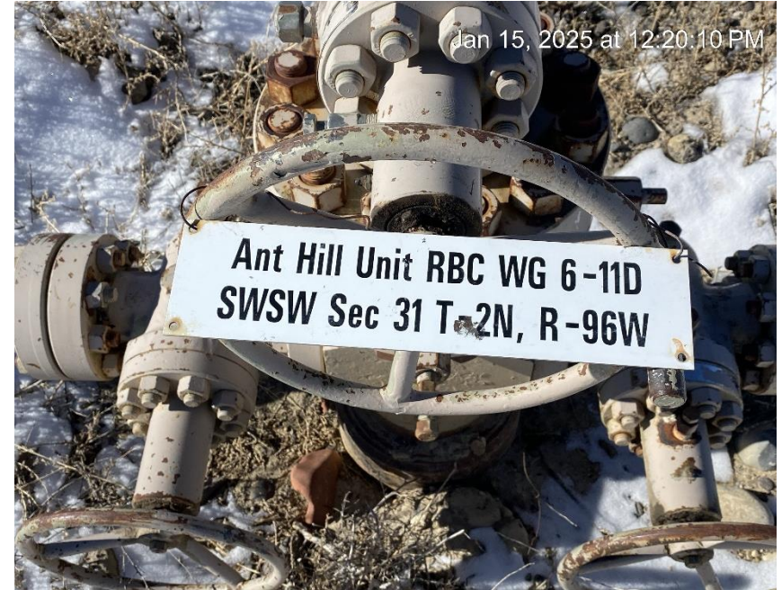
When replaced additional information is required