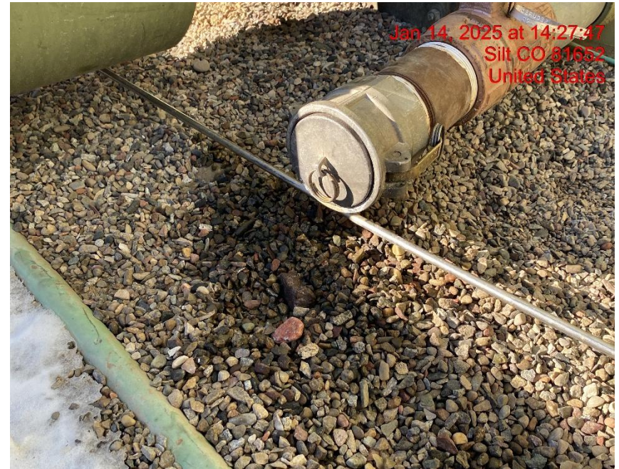
Stained Soil in Containment Area – Photo #05935