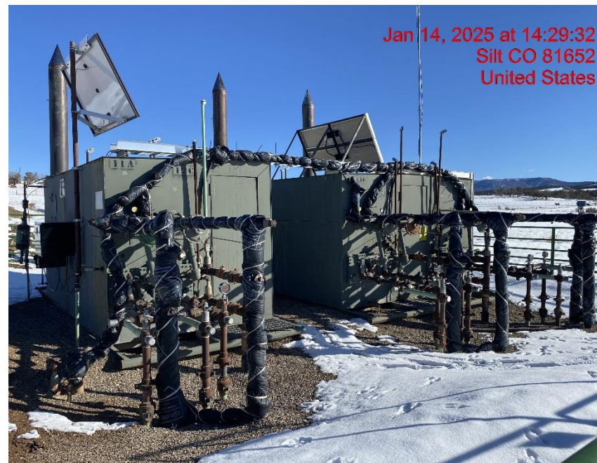
Location – Photo #05942