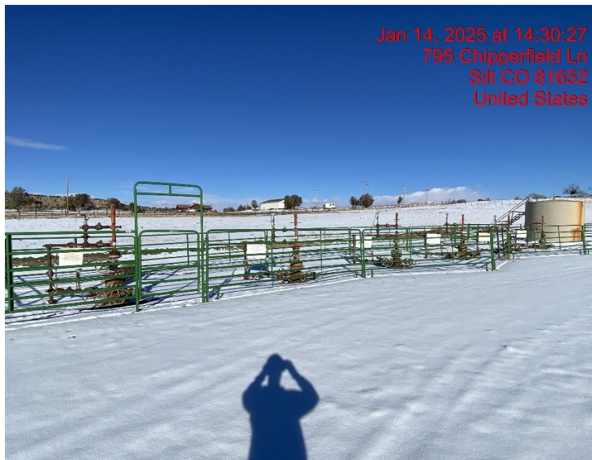
Location – Photo #05945