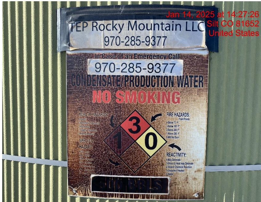
Illegible Tank Label – Photo #05934