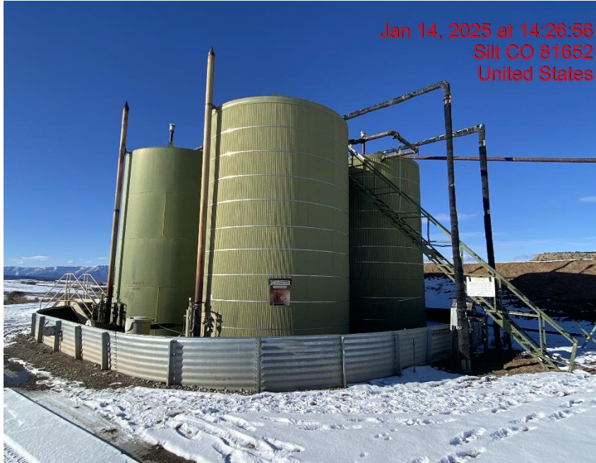
Location – Photo #05931