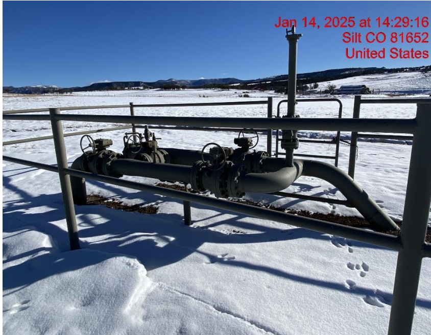
Location – Photo #05941