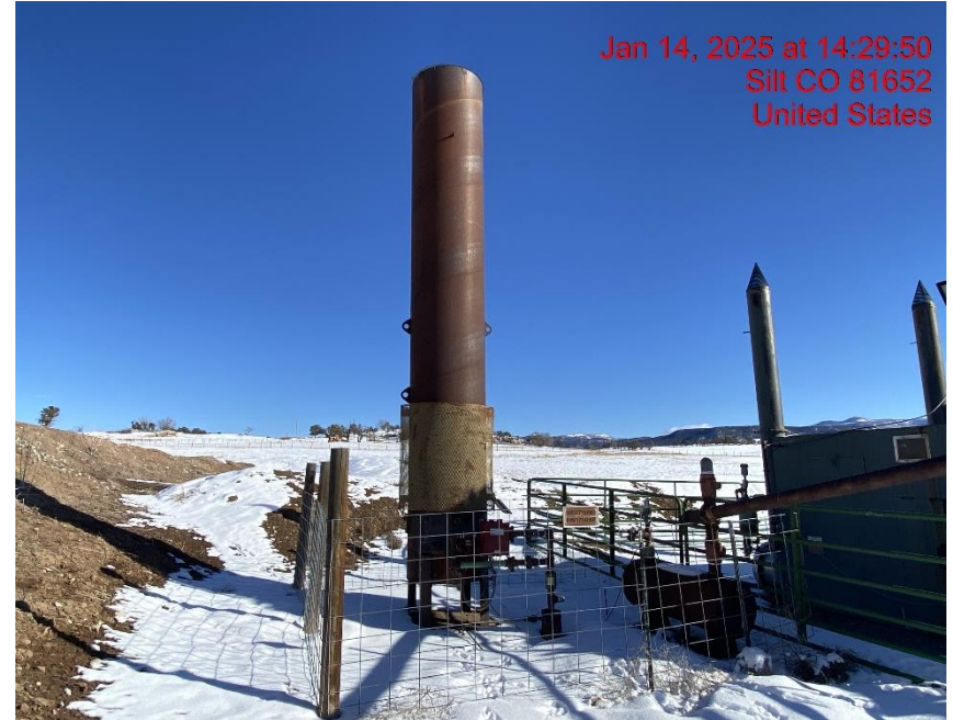
Location – Photo #05944