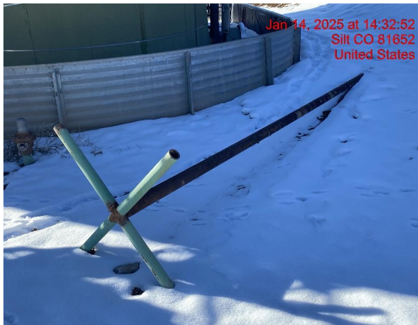
Stored Supplies – Photo #05949