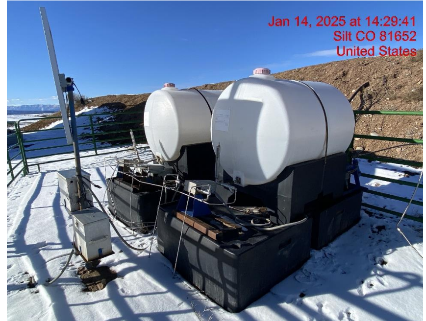
Location – Photo #05943