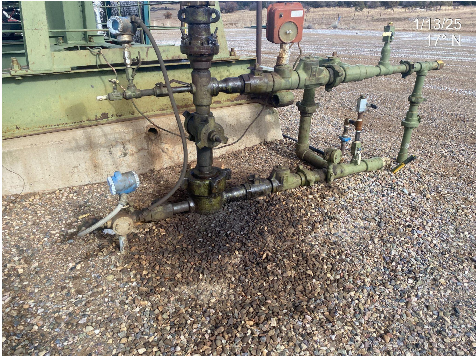
Photo 5. Impacted surface material at well head.

Inspection Photos Location Name: Rhoades 3-33 Location ID: 326473