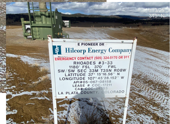
Photo 1. View of well pad taken from the access point facing center.