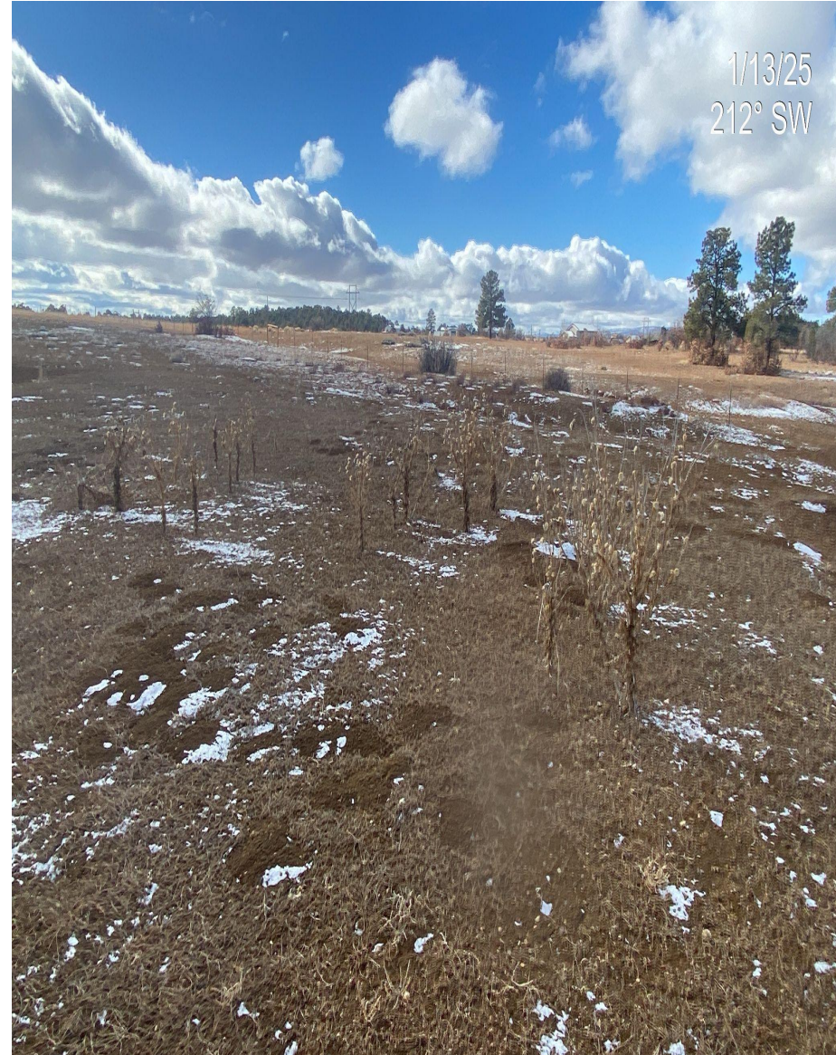
Photo 4. Musk Thistle observed on location; evidence that Musk Thistle had flowered and gone to seed this season.