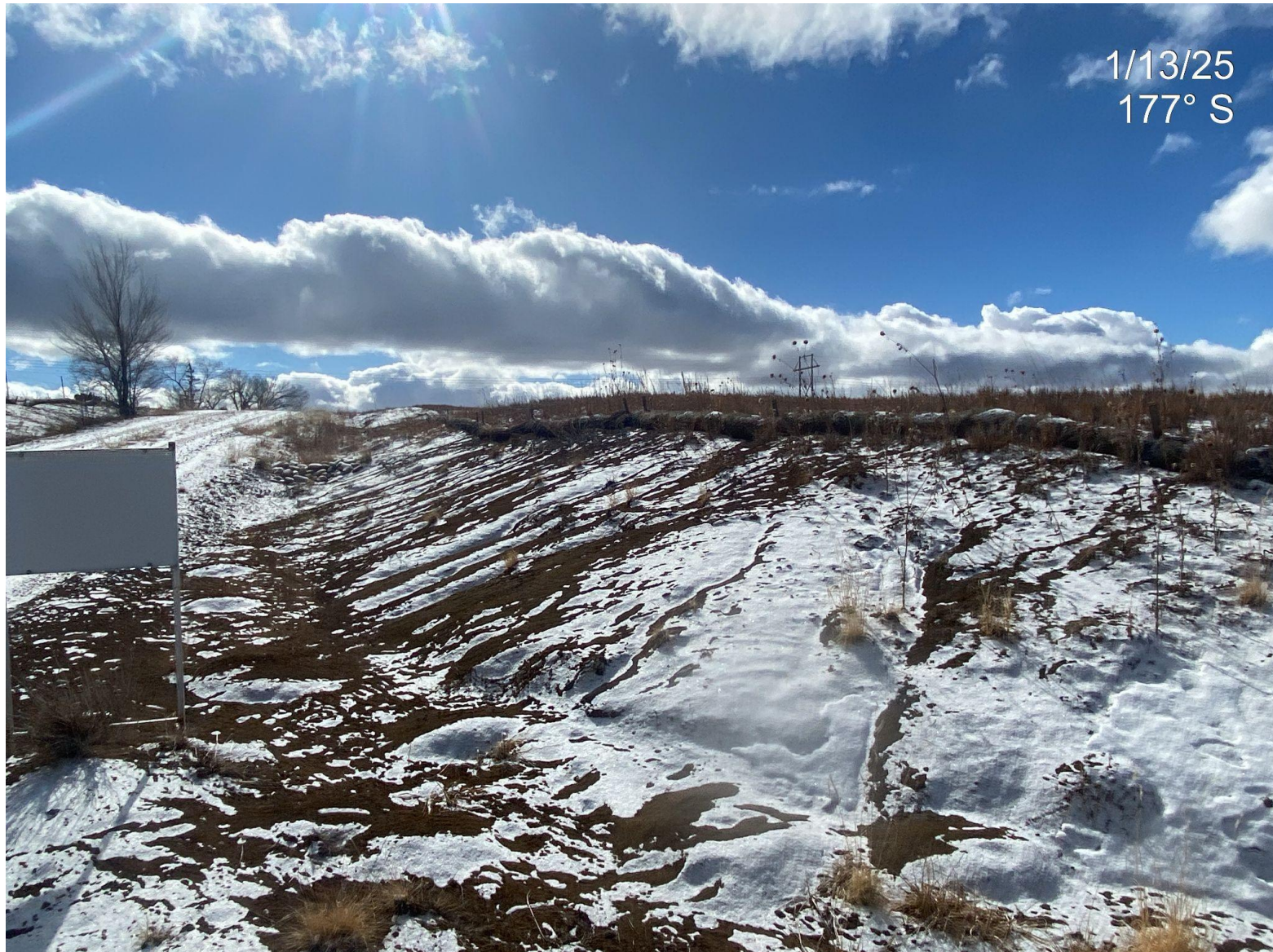
Photo 6. Wattles observed installed on the perimeter of the location.