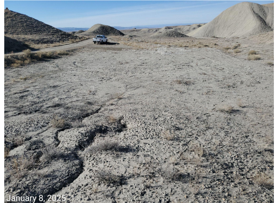
Photo 3: Photo left taken from the west end of the Location, facing east; photo right taken from the west end of the Location, facing west. Location is predominantly bare and exposed soils; vegetation establishment is not progressing towards 1004.c standards.