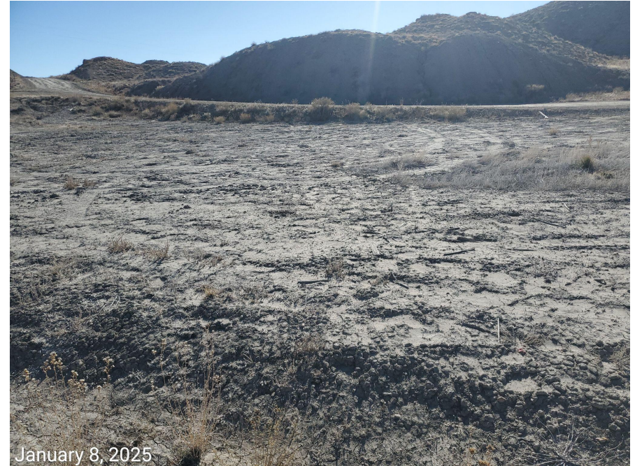
Photo 1: Photos 1-2 taken from the north end of the Location. Photos provide an overview from east, southeast, southwest to west. Location is predominantly bare and exposed soils; vegetation establishment is not progressing towards 1004.c standards.