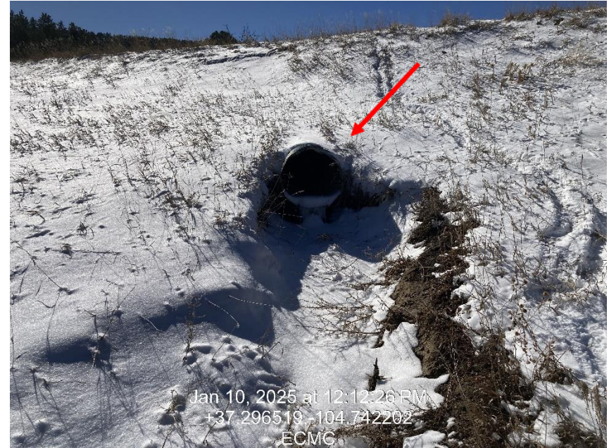
Photo 16 – Delilah 042 A discharge, Pond overflow down slope of pond