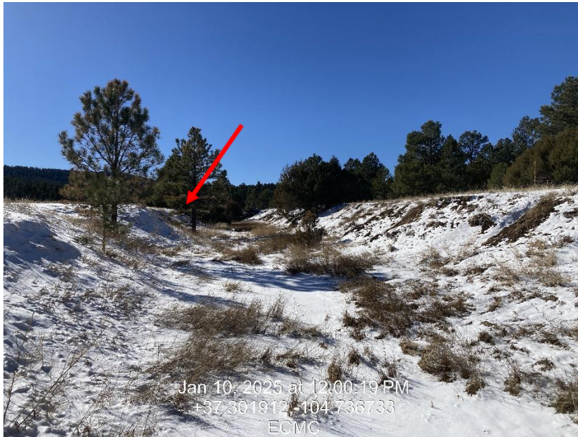
Photo 11 – Main ravine, looking southwest, up slope from spill entry