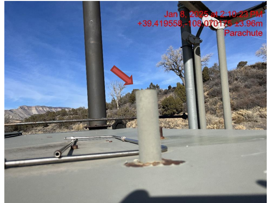
Photo # 2394 PRV vent line does not comply with CECMC pressure safety device rules