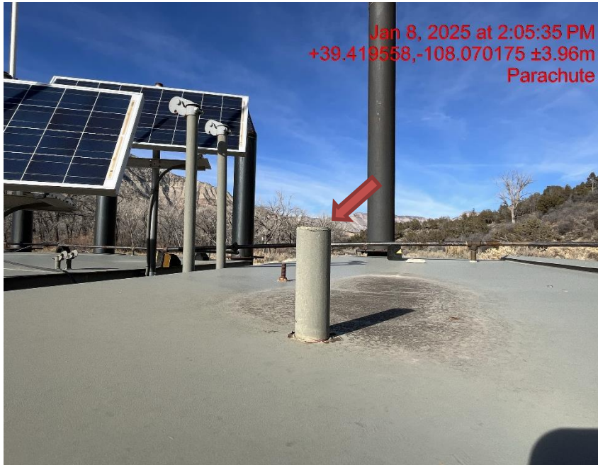
Photo # 2386 PRV vent line does not comply with CECMC pressure safety device rules