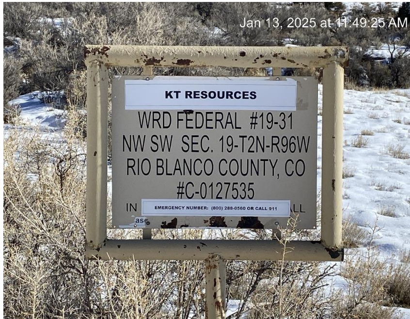
When replaced additional information is required