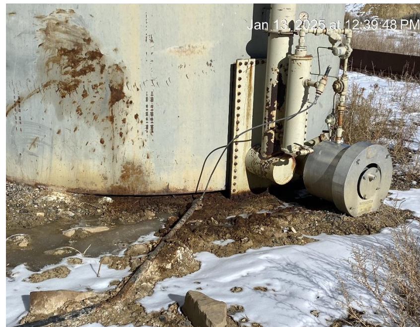
Previous spill lacking proper cleanup