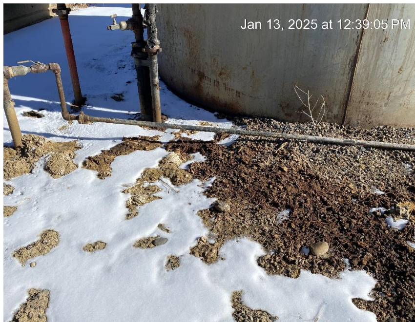
Previous spill lacking proper cleanup