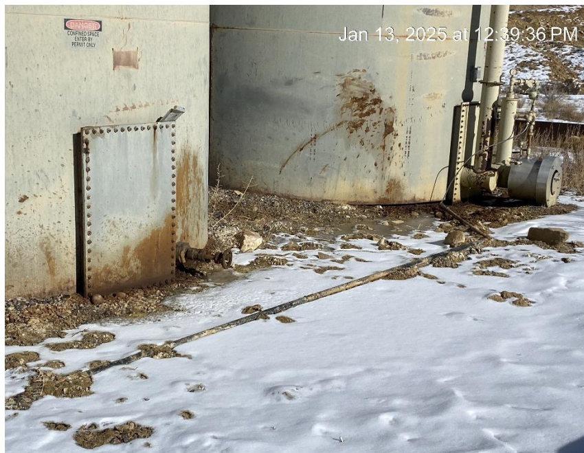
Previous spill lacking proper cleanup