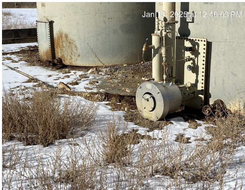
Previous spill lacking proper cleanup