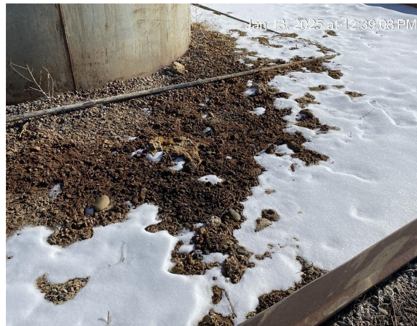
Previous spill lacking proper cleanup