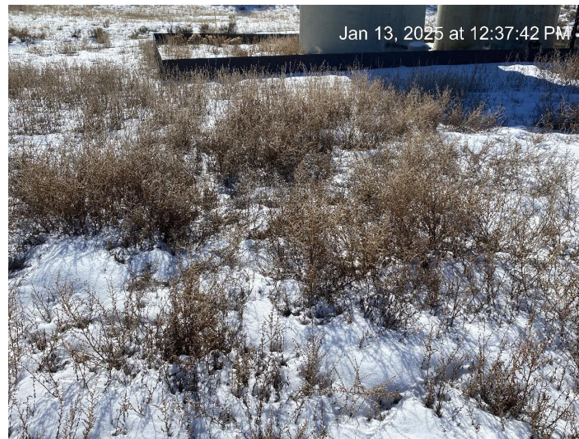
Lack of weed maintenance