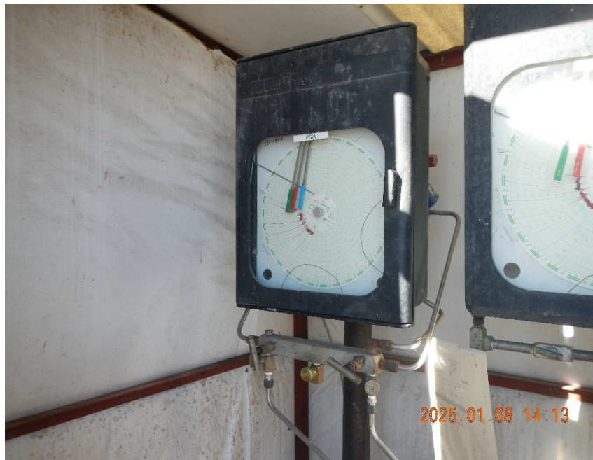
5. Gas meter inside meter shed.