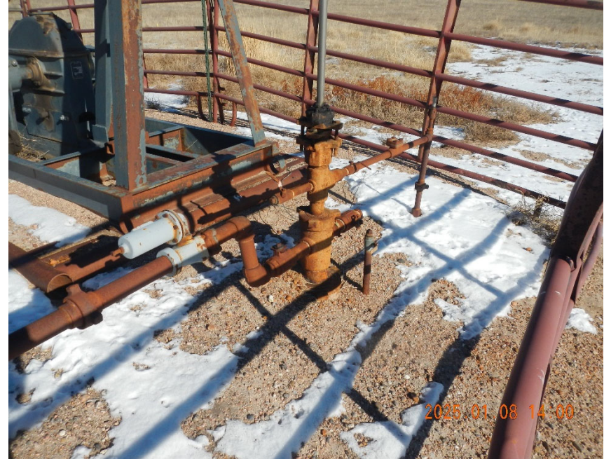
2. View of wellhead.