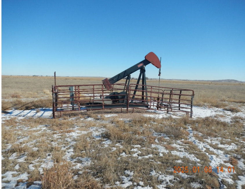
3. Well location overview.