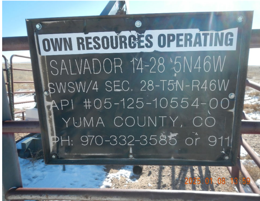
1. Lease sign at well location.