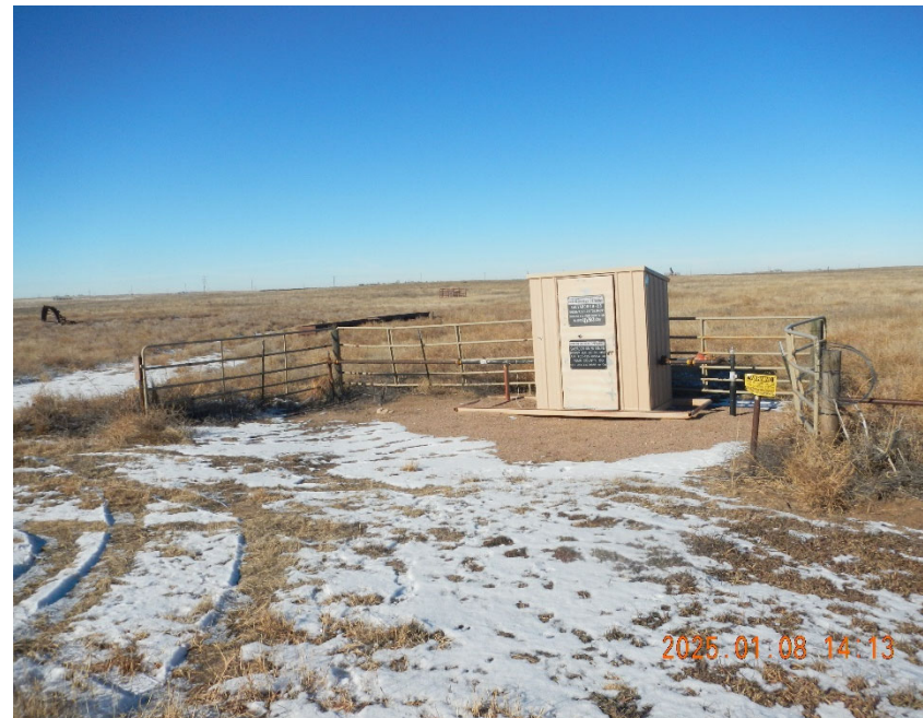
6. Gathering location overview.