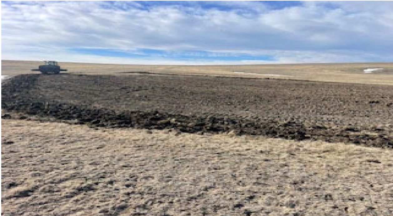
Second Task – De-compact location and access road by cross ripping all disturbed areas at 18 inch depth