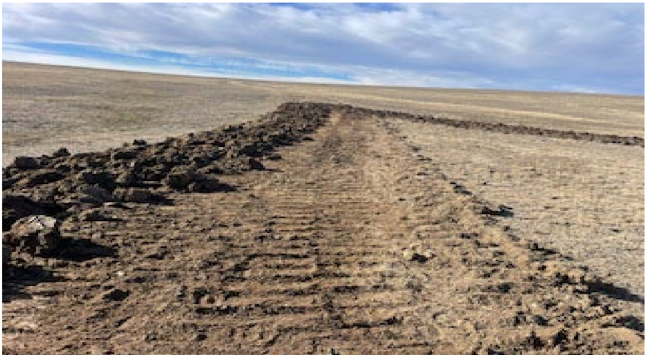
First Task – Access road from location looking West towards Landowners road

First task – Remove gravel from location and access road, remove trash, and slope location and road back to original grade.