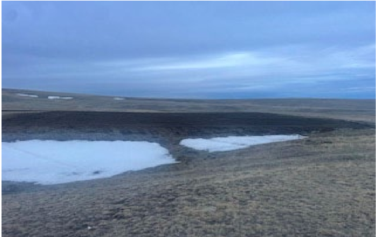
Fourth Task – Seed all disturbed areas including location and access road with grass seed mix recommended by the NRCS