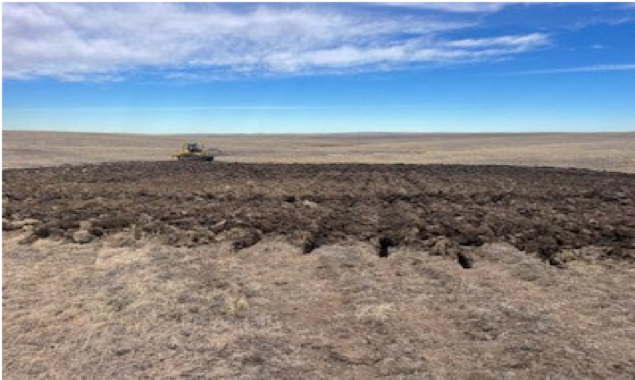
Second Task – West side of location looking East