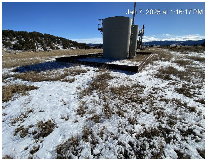
Location from West corner