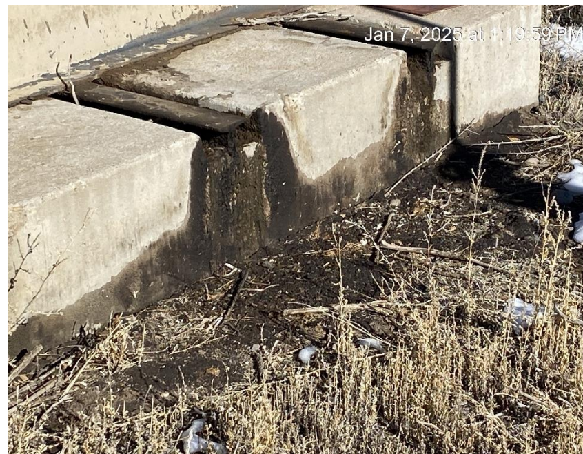
Equipment leak and staining