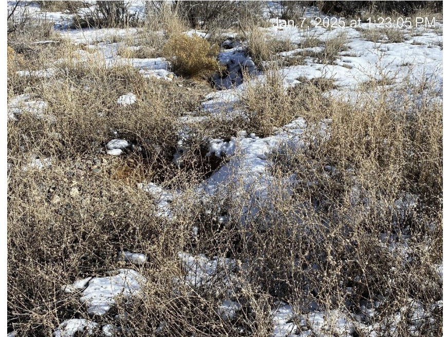
Erosion and soil migration