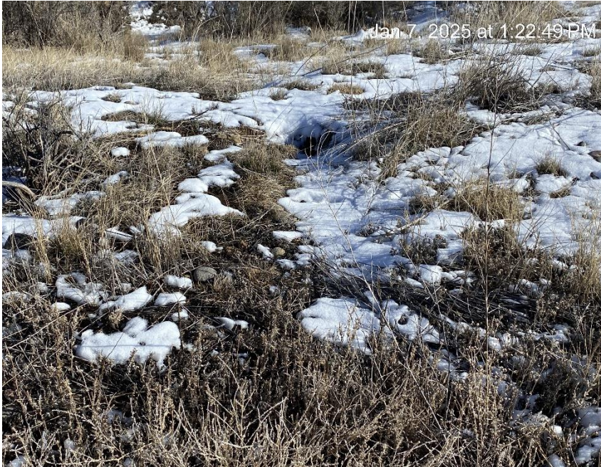
Erosion and soil migration