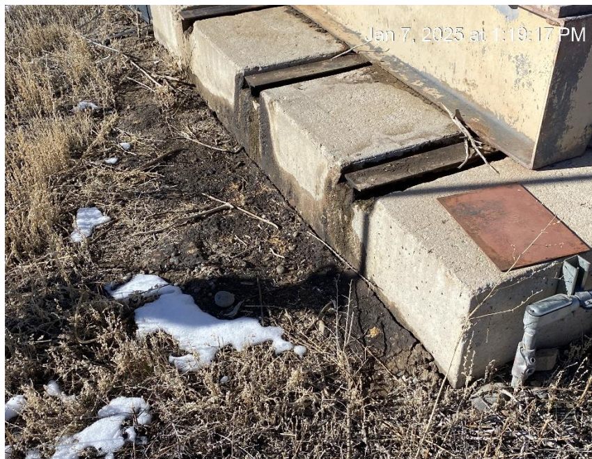
Equipment leak and staining