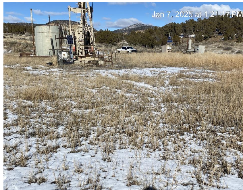
Location from South corner