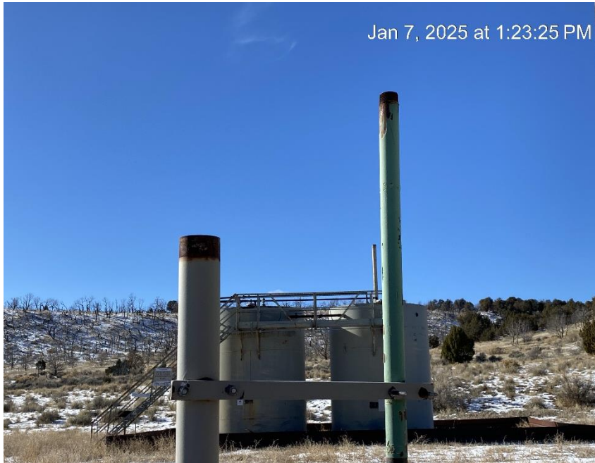
Relief vents missing caps