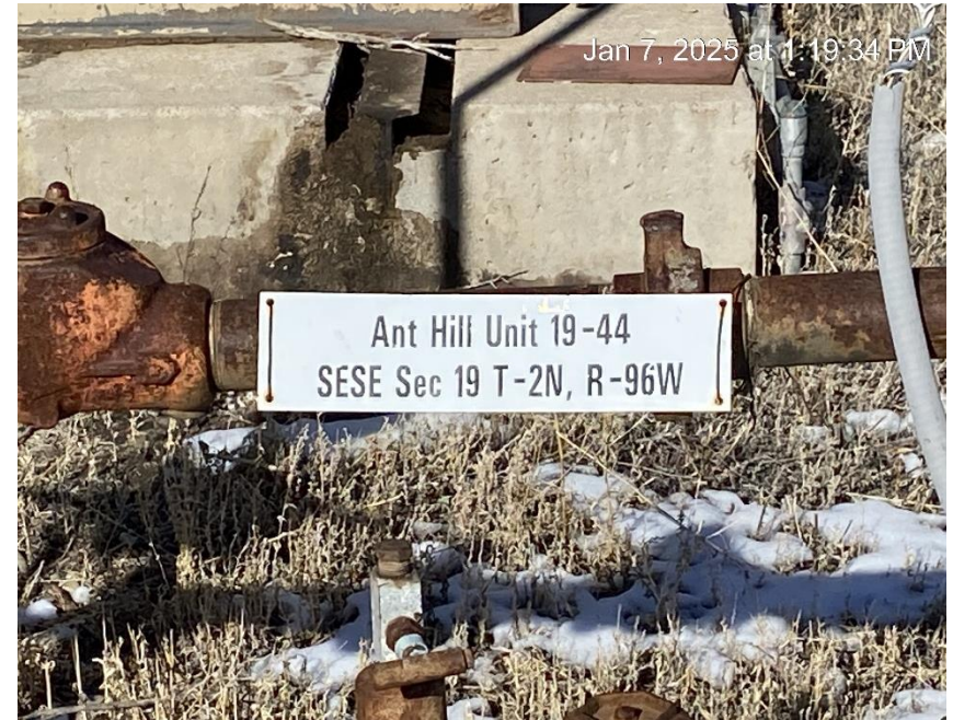
When sign is replaced additional information is required