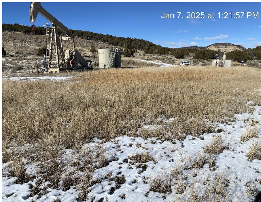
Location from East corner