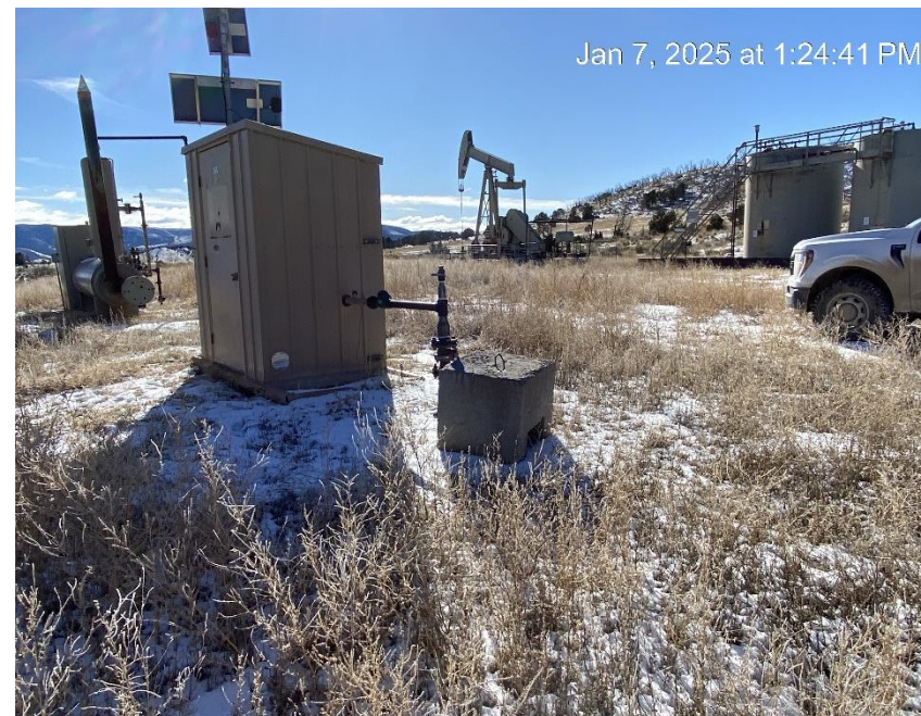
Location from North corner and entrance