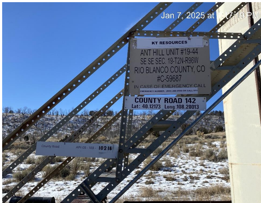
Tank battery signs