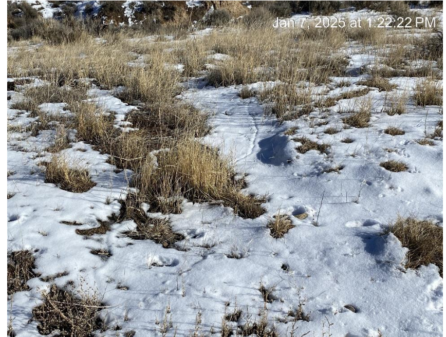
Erosion and soil migration