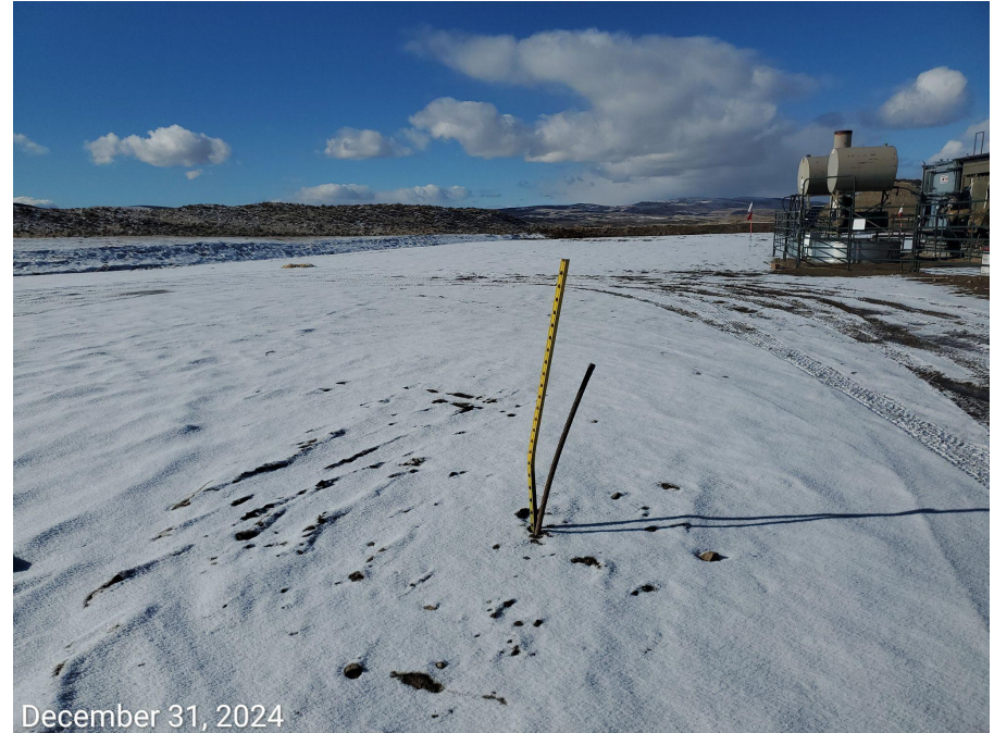
Photo 2: Anchors on Location have been marked pursuant to 1003.a requirements.