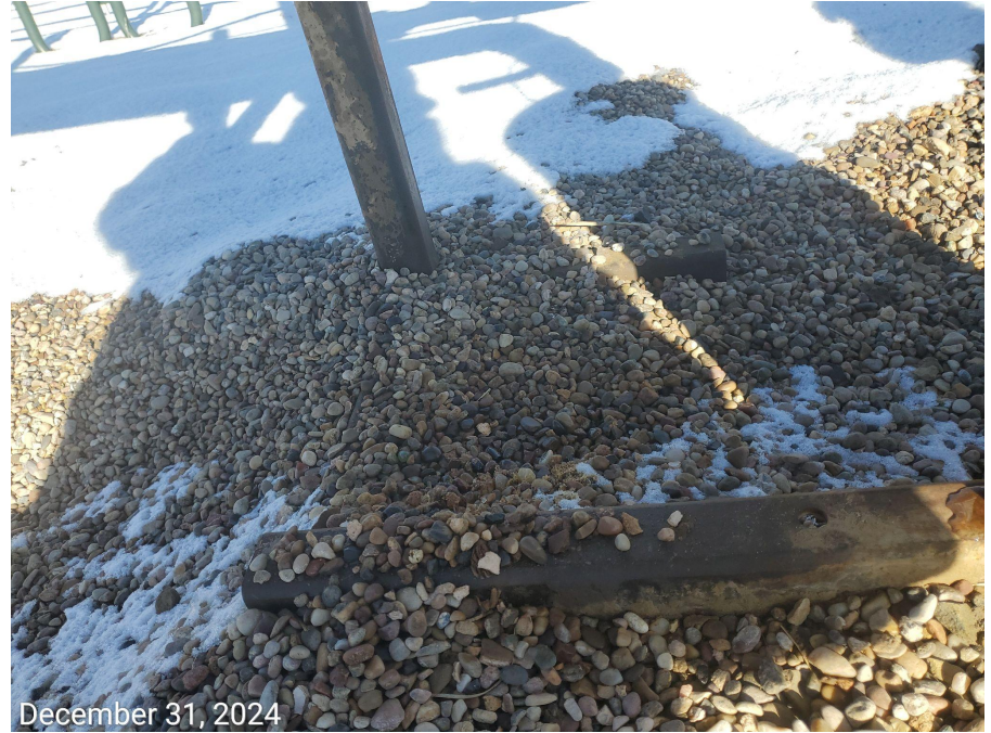
Photo 4: Continue from photo 3. Photos show spills/leaks have continued at equipment resulting in spills onto the surface of the Location/Pad.