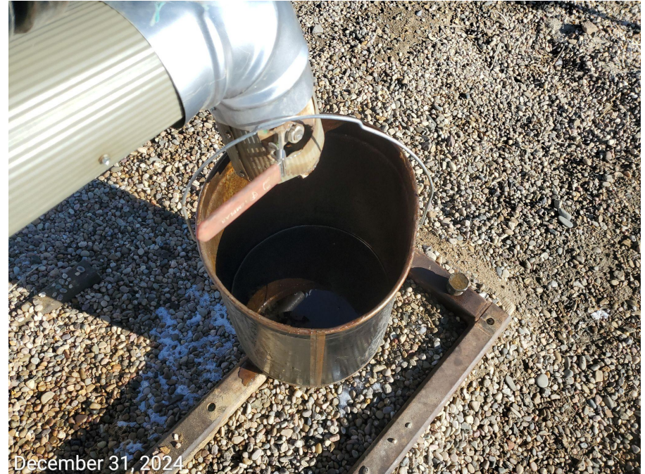
Photo 3: Photos taken from equipment on the northeast end of the Location. Spills/leaking from equipment have continued. Operator has precariously placed a bucket beneath equipment to capture fluids; this is not proper management of E&P waste; buckets could easily be knocked over; fluids require removal and proper disposal and equipment maintained pursuant to 608.e requirements.