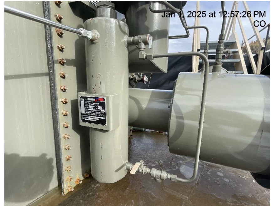
Photo # 6183 PRV vent line does not comply with CECMC pressure safety device rules