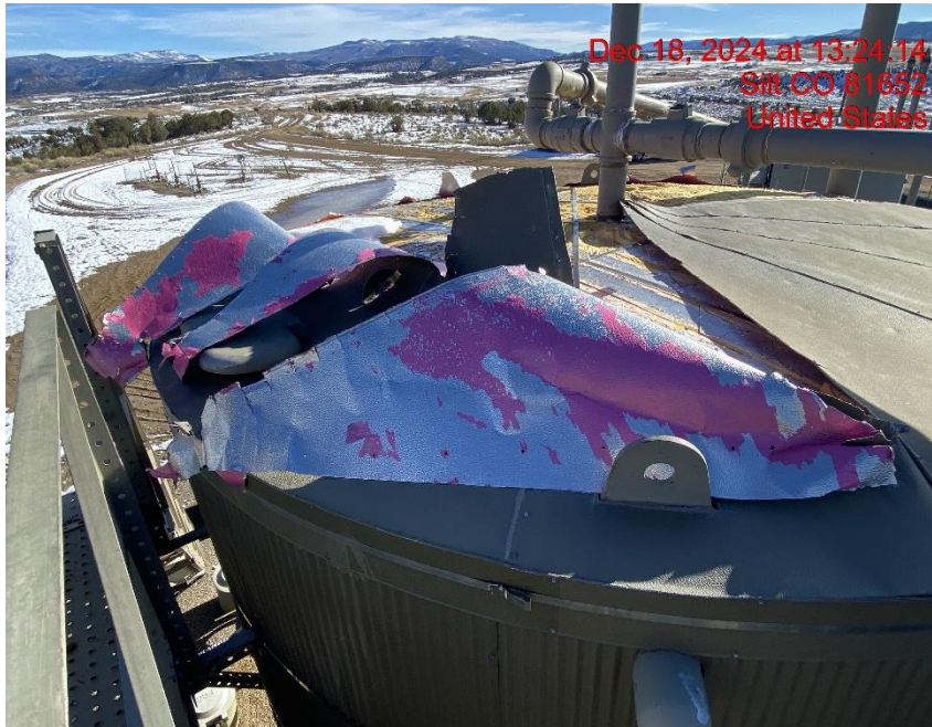
Damaged Tank Insulation – Photo #05405