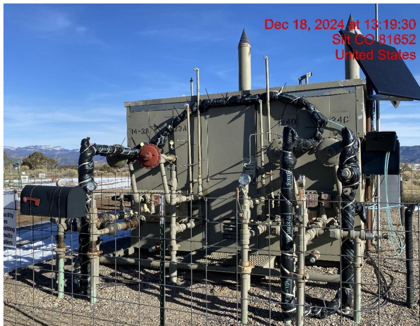
Location – Photo #05394