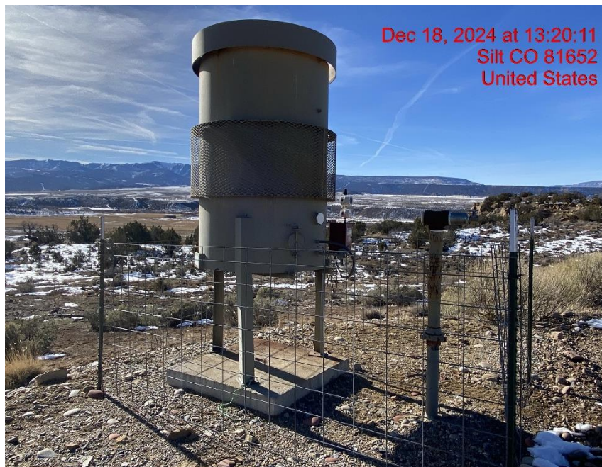
Location – Photo #05396