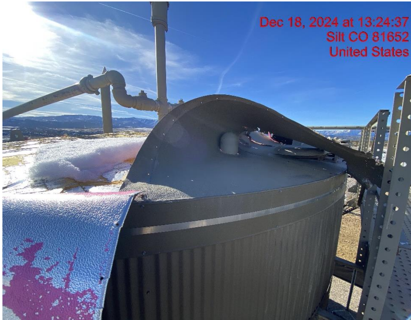
Damaged Tank Insulation – Photo #05407