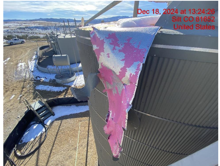
Damaged Tank Insulation – Photo #05406