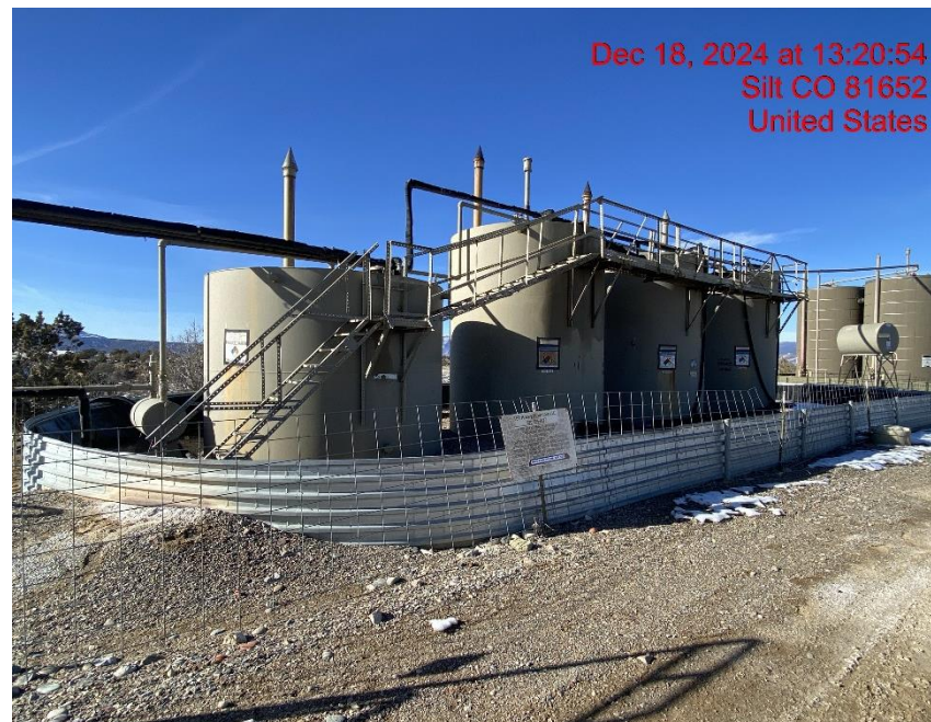
Location – Photo #05398