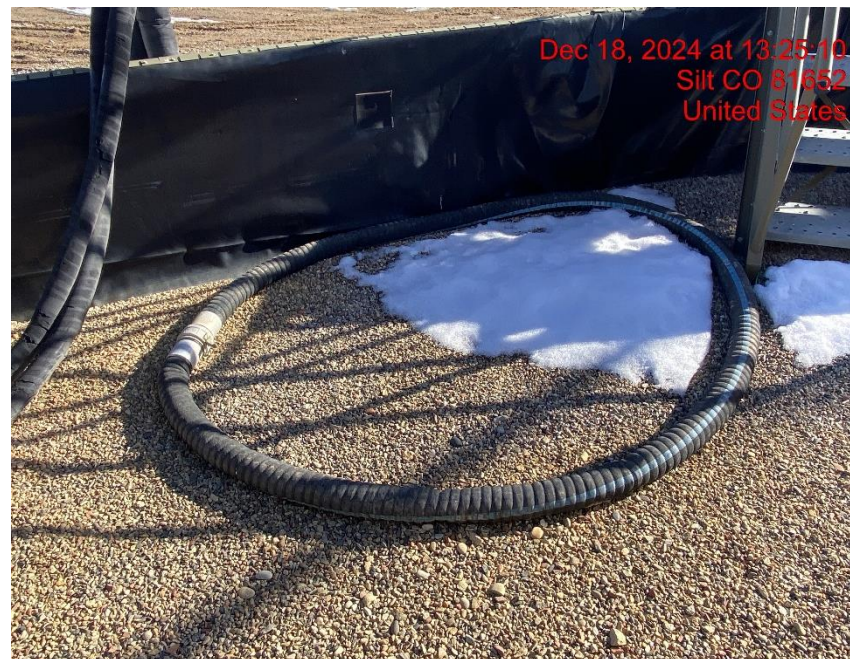
Stored Equipment – Photo #05412