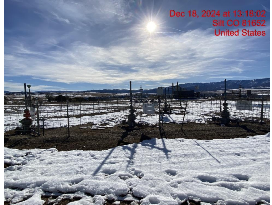
Location – Photo #05392

Dec 18, 2024 at 13:18:02 Silt CO 81652 United States