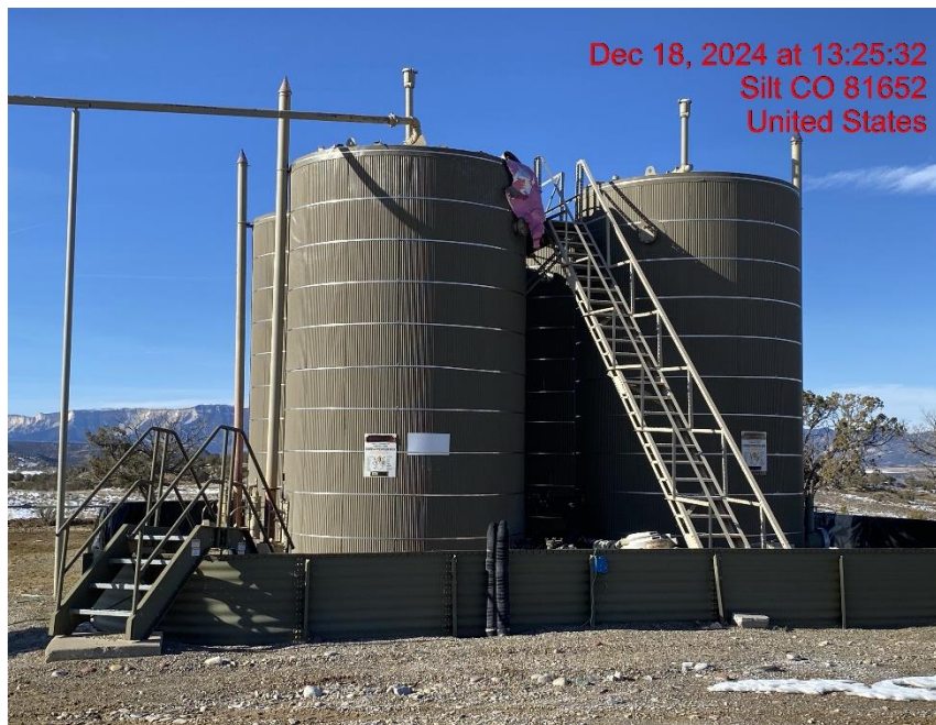
Location – Photo #05413