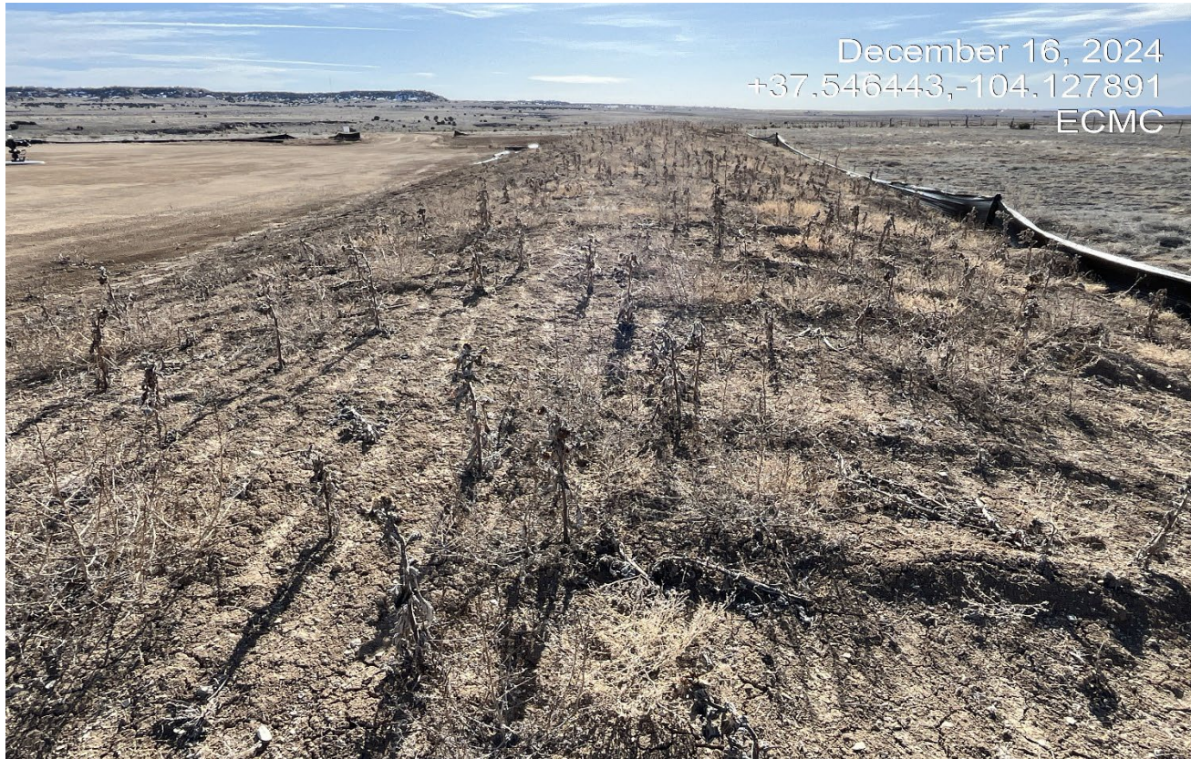
Photo 6. Facing toward the soil stock pile. The topsoil has not been seeded and stabilized and there are weeds established along the topsoil.