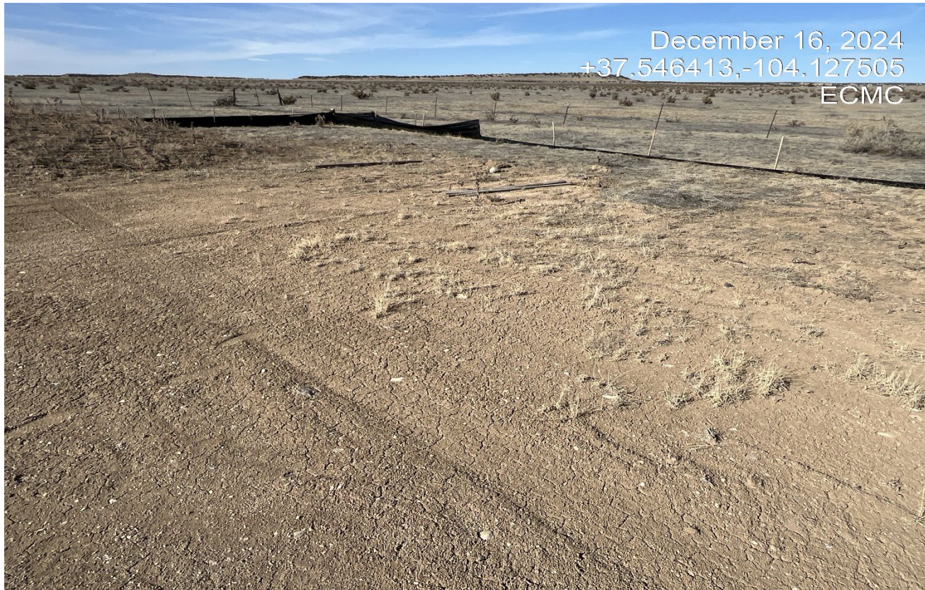
Photo 7. Facing toward the west corner of the location. The silt fence still remain down in this area.