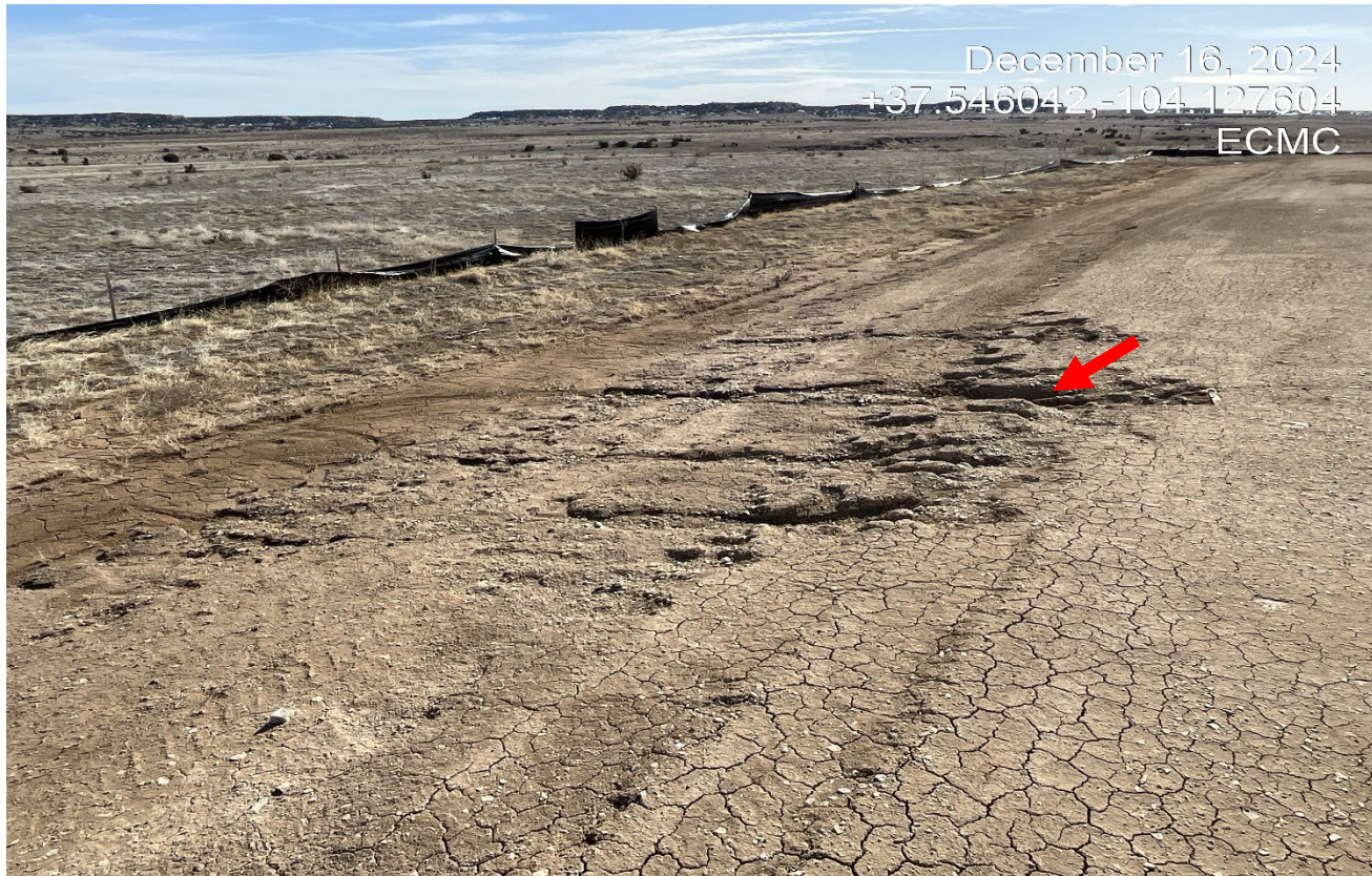
Photo 5. Facing southeast along the fill slope. There is erosion occurring shown at red arrow. Silt fence is not maintained.