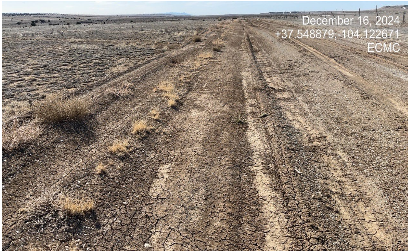
Photo 1. Facing south along the access road. The sides of the road will need to be reclaimed. Previous Ca for stabilization was not completed.