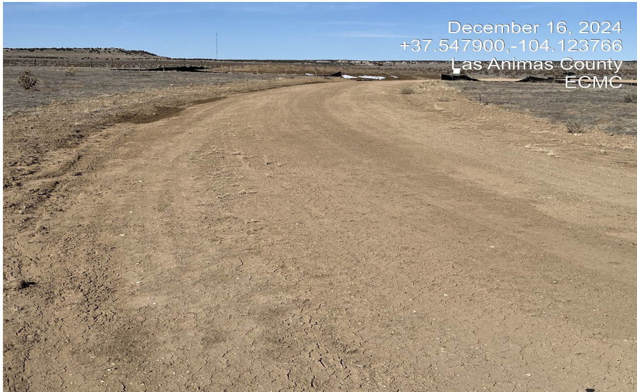
Photo 2. Facing west toward the access road. The side of the road needs to be seeded and stabilized. Previous corrective action was not completed.