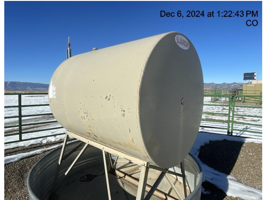
Photo # 2711 Methanol tank labeling damaged/tank is missing required information