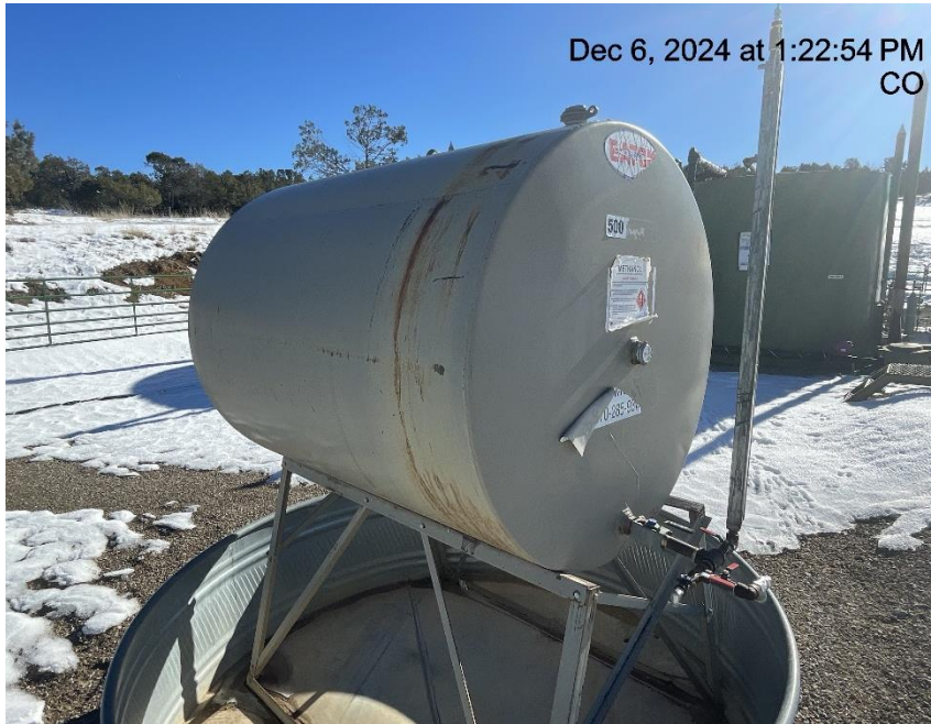
Photo # 2710 Methanol tank labeling damaged/tank is missing required information