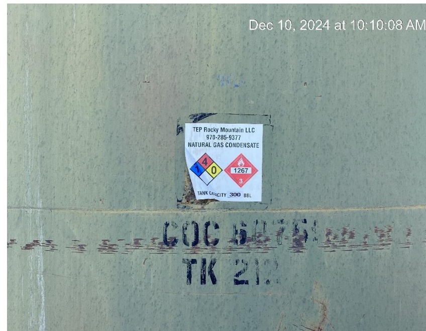
Replace when damaged or illegible.