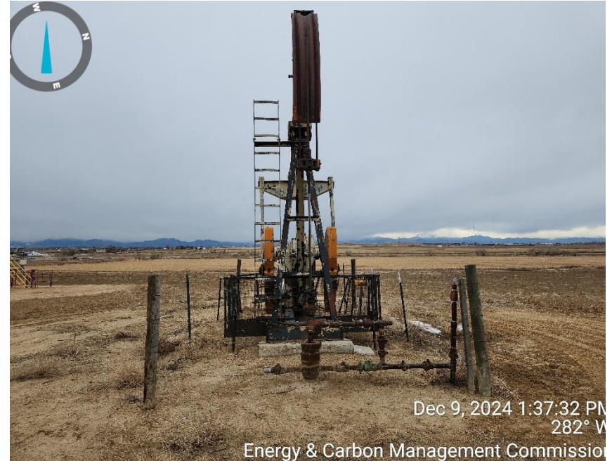
Photo 2 well head and equipment