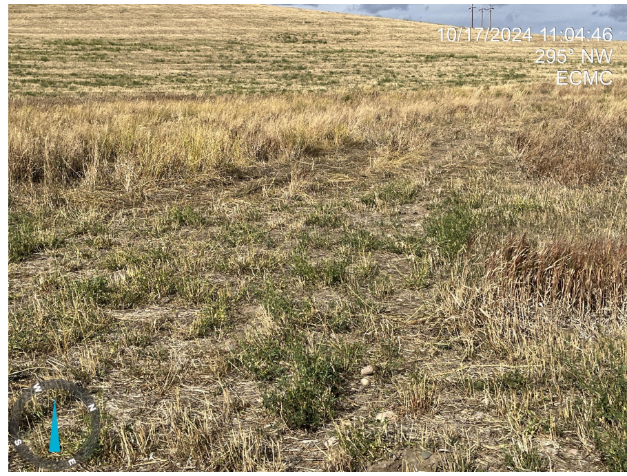
Photo 9. Photo taken of access road, facing northwest. Cheatgrass was observed along edges of road.