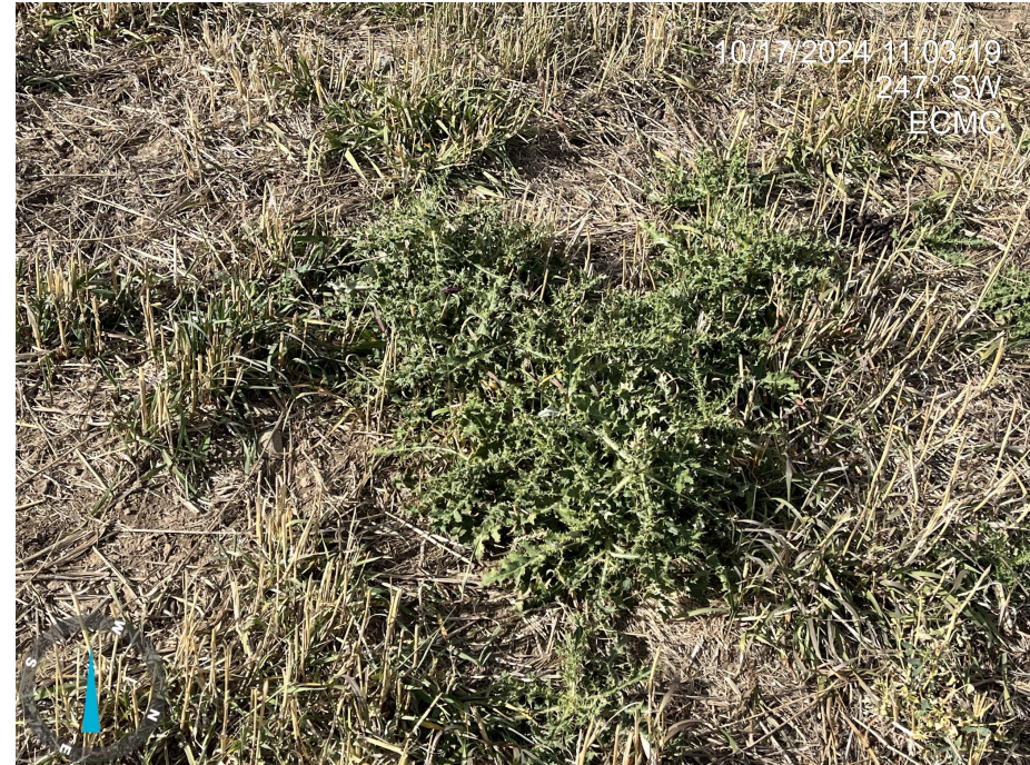
Photo 7. Photo illustrates Undesirable weed species (Class B Noxious Weed - Canada Thistle).