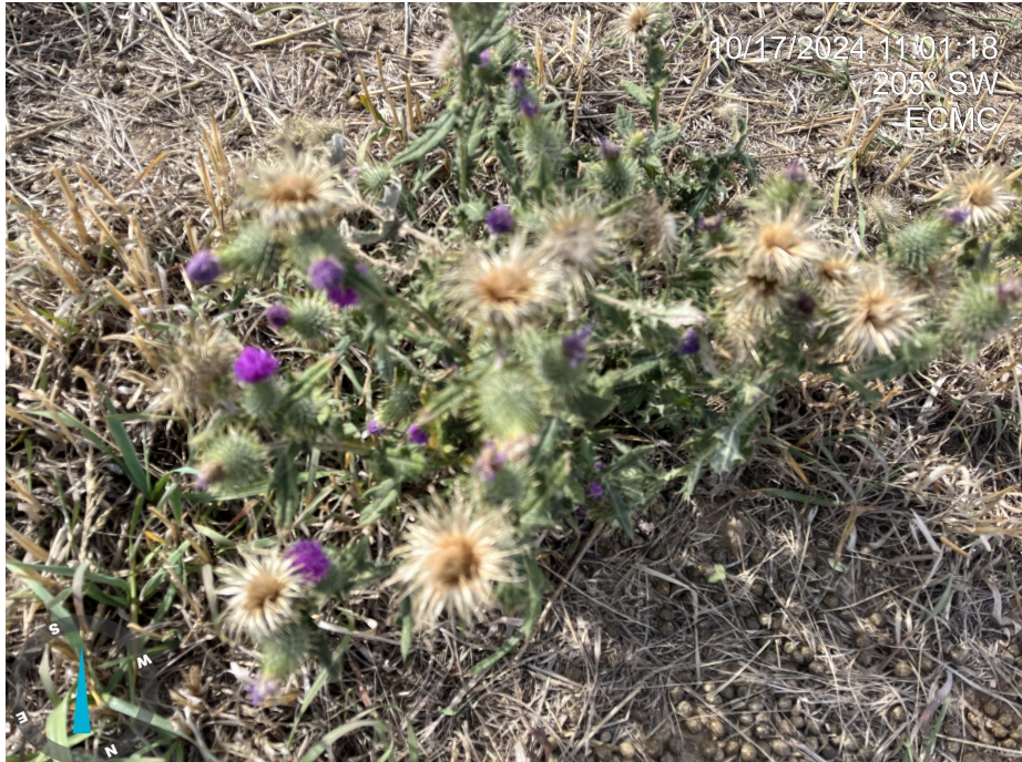
Photo 6. Photo illustrates Undesirable weed species (Class B Noxious Weed - Bull Thistle). Comply with Rule 1004.e and Rule 606. Conduct weed management to prevent further establishment and spread of Undesirable Plant Species; ongoing weed management required until location passes final reclamation.