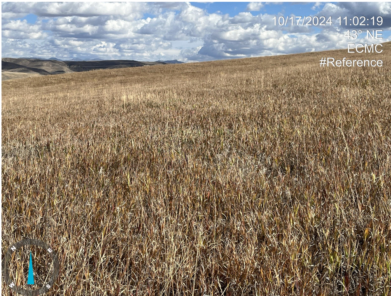
Photo 5. Photo taken from northeastern edge of Location, facing reference area. Reference are appears to be mostly Smooth Brome.