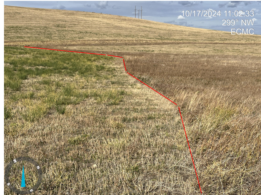
Photo 4. Photo taken from the northern area of pad, facing northwest, illustrating the difference between the disturbance and reference area vegetation. Areas to the left of the red line illustrate the disturbance area (sweet clover; alfalfa); areas to the right of the red line illustrate reference area vegetation (smooth brome).