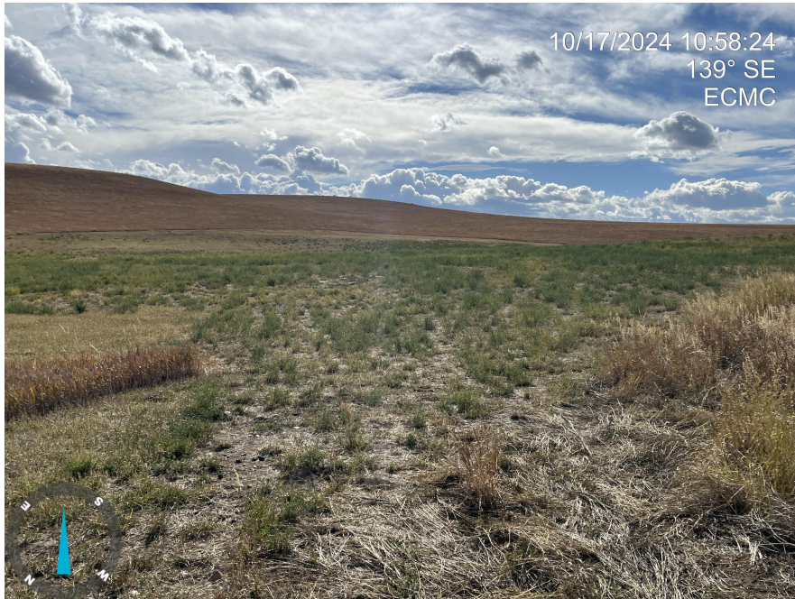
Photo 1. Photo taken from the Location entrance on the west end of the site, facing southeast. Photo provides and overview of the Location.