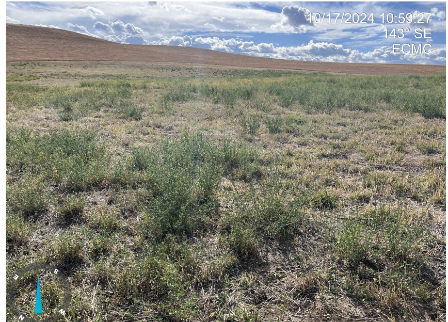
Photo 2. Photo taken from western portion of the Location, facing southeast. Photo illustrates that not all areas have achieved uniform vegetation; vegetation in disturbance (alfalfa, sweet clover) is not reflective of reference area vegetation (smooth brome).