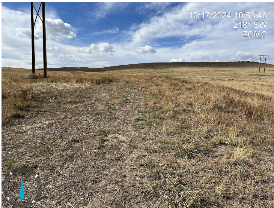
Photo 8. Photo taken of access road, facing southwest. It appears that the access road has not been reclaimed; compaction issues likely exist.