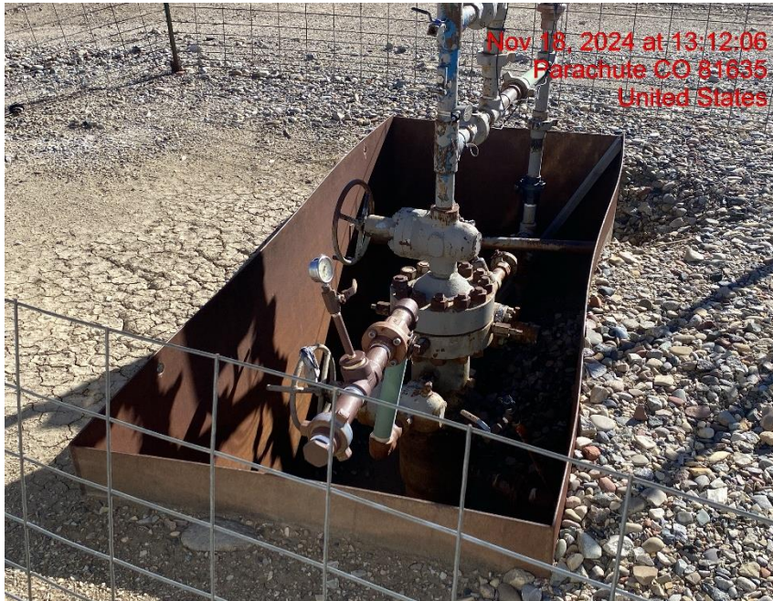
Open Wellhead Cellar/Insufficient Wildlife Egress – Photo #04963