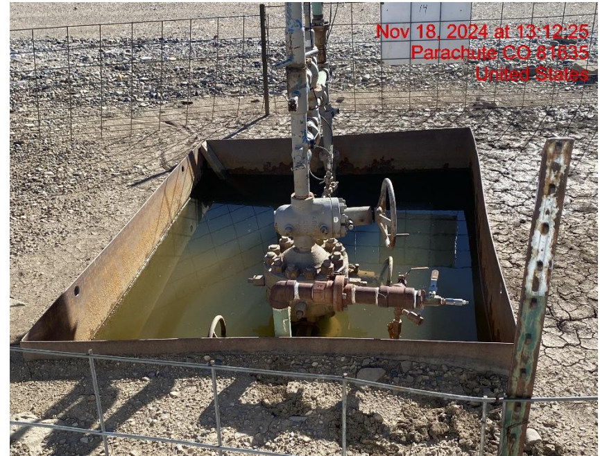
Open Wellhead Cellar/Insufficient Wildlife Egress – Photo #04964