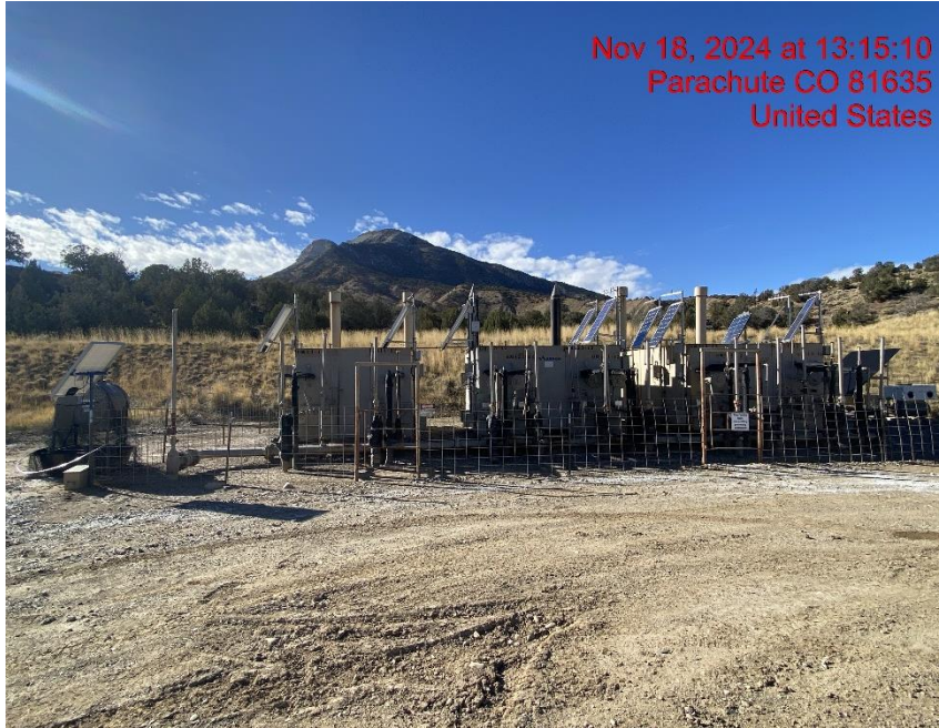
Location – Photo #04968