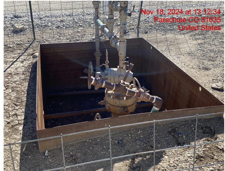
Open Wellhead Cellar/No Wildlife Egress – Photo #04965