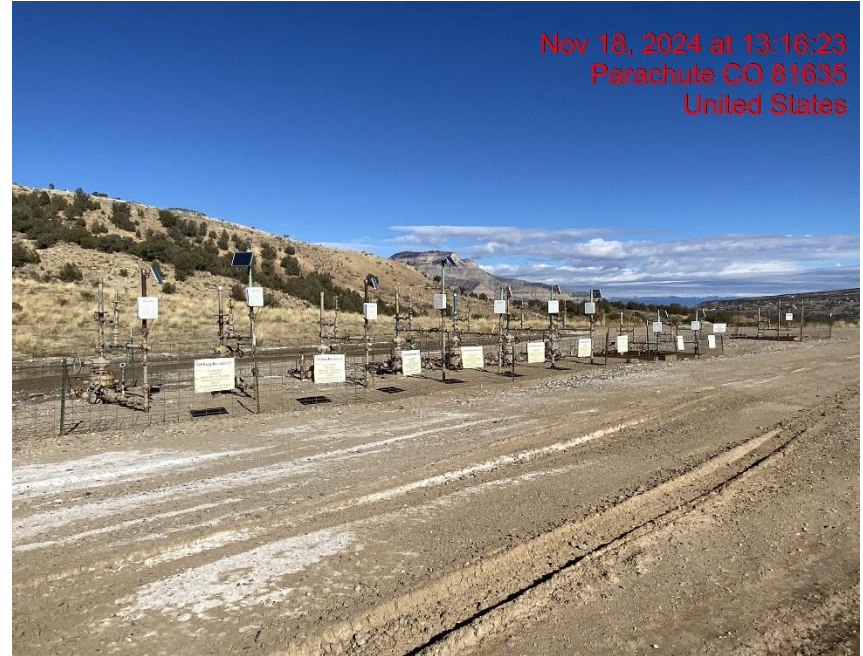
Location Entrance – Photo #04962

Nov 18, 2024 at 13:16:23 Parachute CO 81635 United States