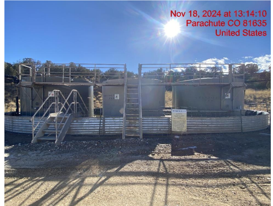
Location – Photo #04967