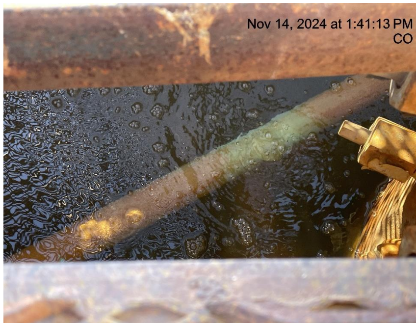
Photo # 96 Mechanical Condition - Possible leak on the Langstaff RWF 724-16 wellhead