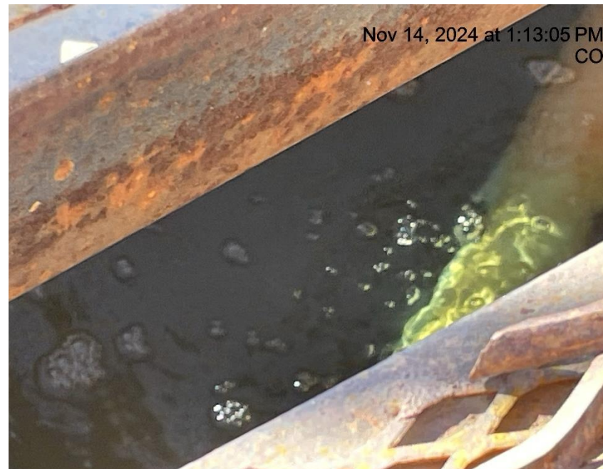
Photo # 97 Mechanical Condition - Possible leak on the Langstaff RWF 724-16 wellhead