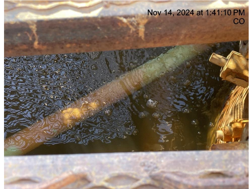
Photo # 95 Mechanical Condition - Possible leak on the Langstaff RWF 724-16 wellhead