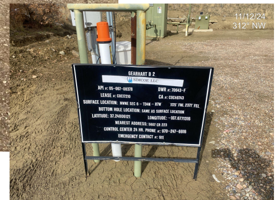
Photo 1. View of well disturbance taken from the access point facing center.