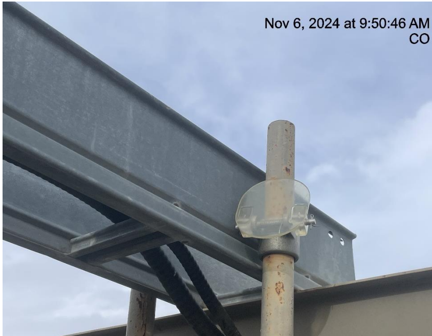
Photo # 9091 PRV vent line does not comply with CECMC pressure safety device rules