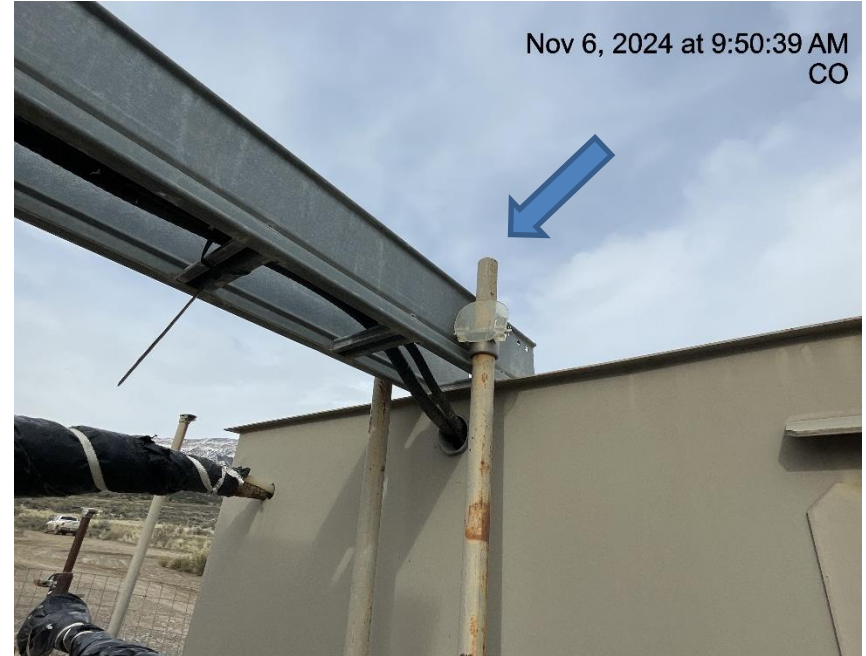
Photo # 9090 PRV vent line does not comply with CECMC pressure safety device rules