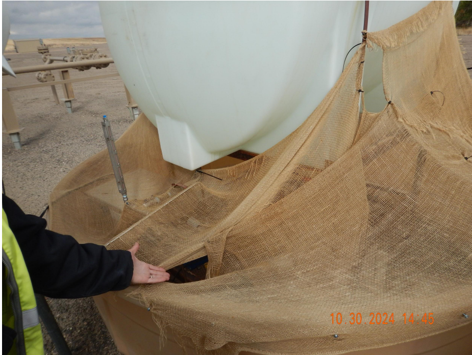
Photo 11. Photo taken from the production facility area. Photo illustrates wildlife netting that has not been properly installed.