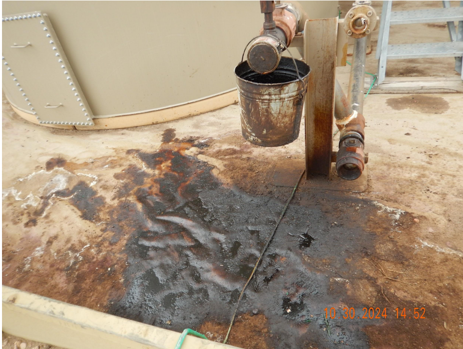
Photo 15. Photo taken from the secondary containment area of the production facility area. Photo illustrates E&P waste that needs to be cleaned up.