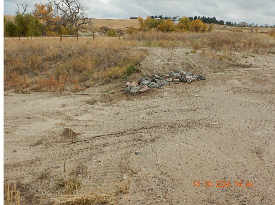
Photo 10. Photo taken of the eastern well pad, facing South. Photo illustrates stormwater repairs have been performed.