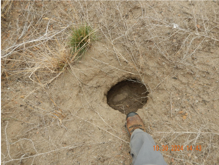
Photo 9. Photo taken along the eastern well pad. Photo illustrates either subsidence or the sound wall hole was never properly backfilled.