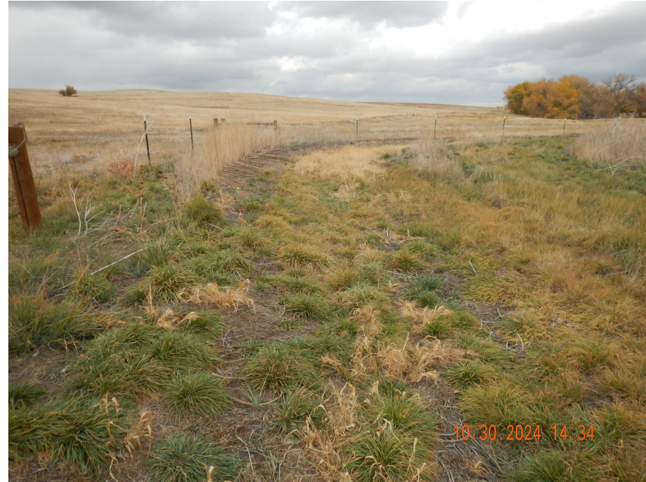
Photo 6. Photo taken along the northern perimeter of location, facing North. See comments under Photo 1.