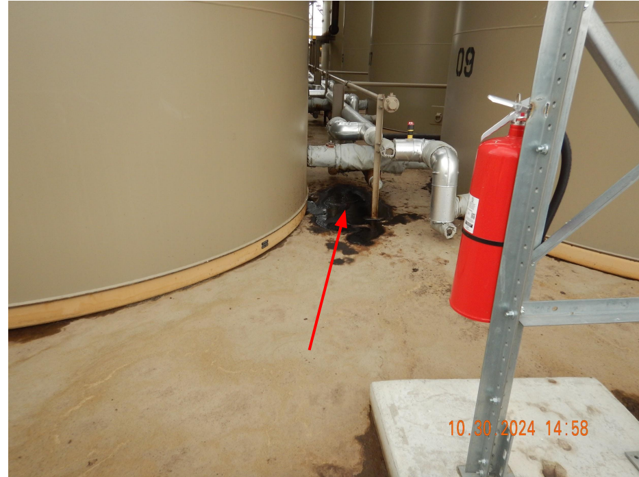
Photo 16. Photo taken from the secondary containment area of the production facility area. See comments under Photo 15.