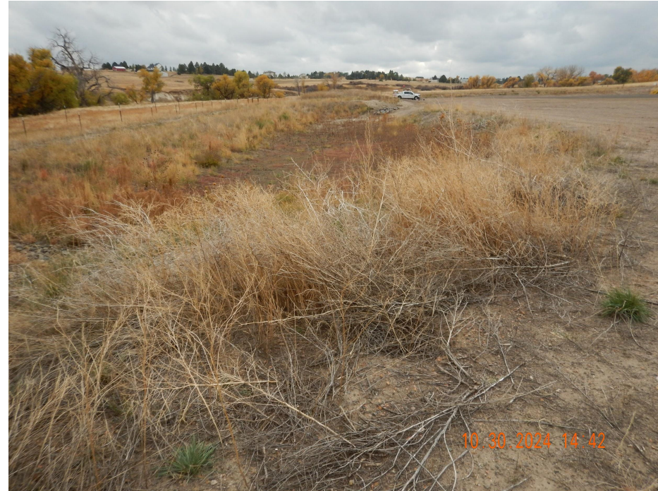
Photo 8. Photo taken along the northeastern perimeter of location, facing South. Photo illustrates weedy, annual vegetation.