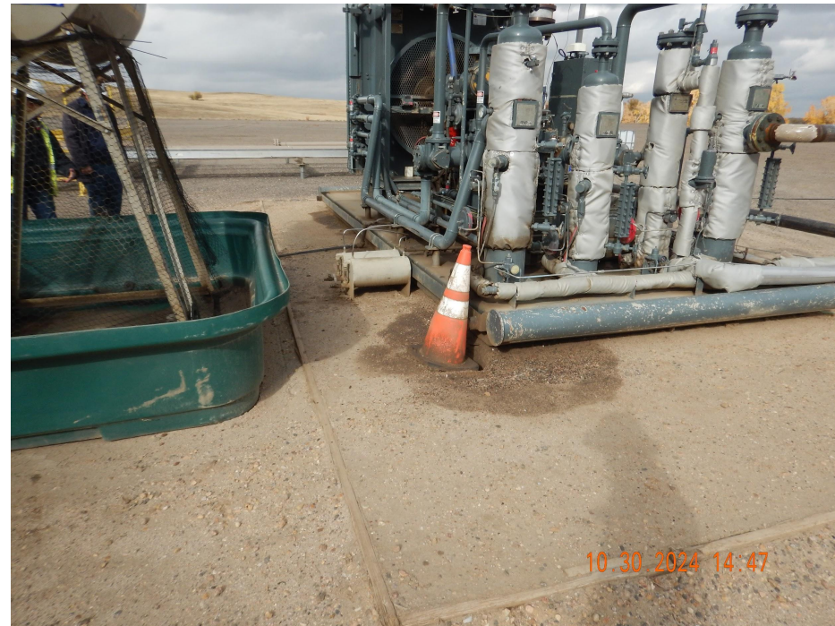
Photo 14. Photo taken from the production facility area. See comments under Photo 13.