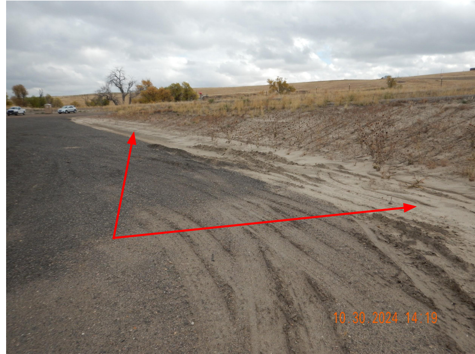
Photo 2. Photo taken along the southwestern perimeter of location, facing Southeast. Photo illustrates ditch BMPs are not properly functioning and have accumulation of sediment.