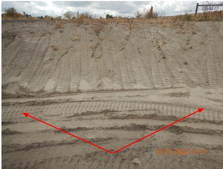
Photo 3. Photo taken along the southwestern perimeter of location, facing West. Photo illustrates repairs have been performed on rill erosion observed on the cut slope.

Ditch BMPs are not properly functioning and have accumulation of sediment.