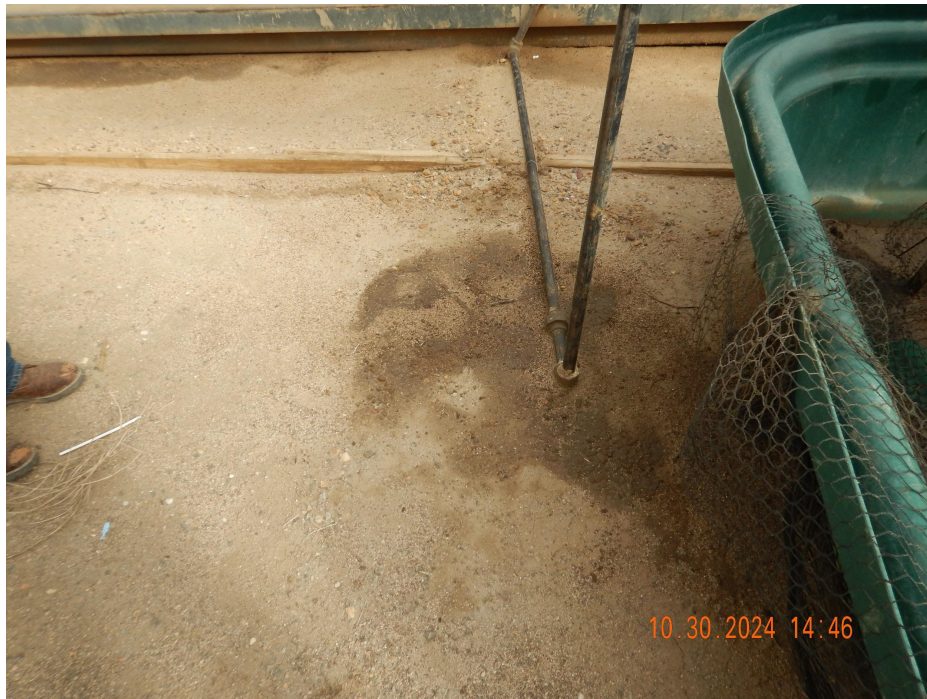
Photo 13. Photo taken from the production facility area. Photo illustrates stained soil.