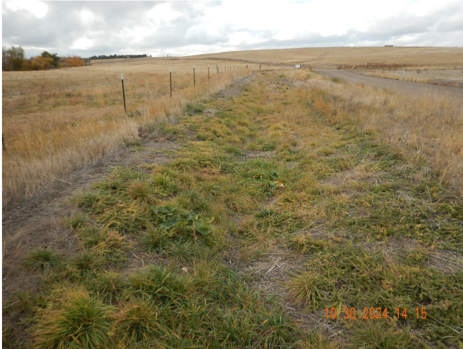
Photo 1. Photo taken along the southeastern perimeter of location, facing West. Photo illustrates preliminary weed control- mowing has only been performed along the perimeter fenceline.