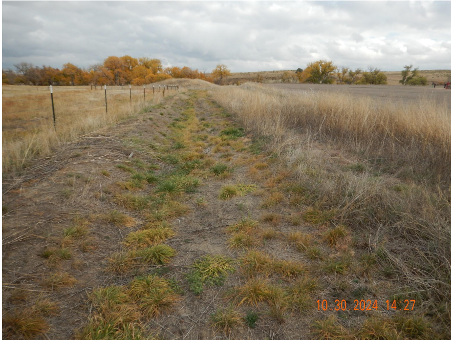
Photo 5. Photo taken along the northwestern perimeter of location, facing East. See comments under Photo 1.