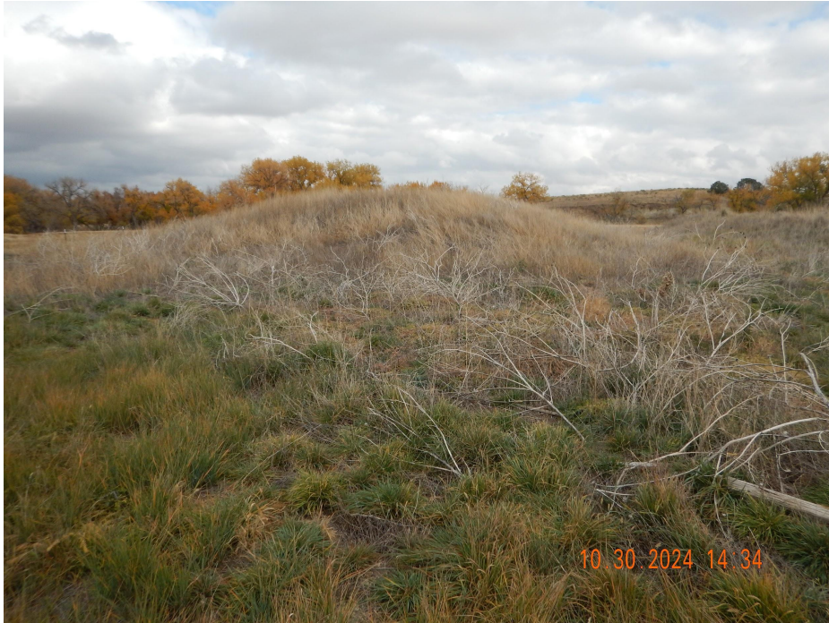
Photo 7. Photo taken from the northern topsoil stockpile, facing East. See comments under Photo 4.