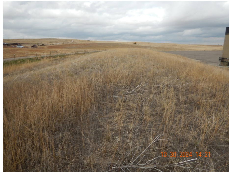
Photo 4. Photo taken from the western topsoil stockpile, facing North. Photo illustrates that weeds do not appear to have been mowed. Reseeding has not been performed but is planned.

Ditch BMPs are not properly functioning and have accumulation of sediment.