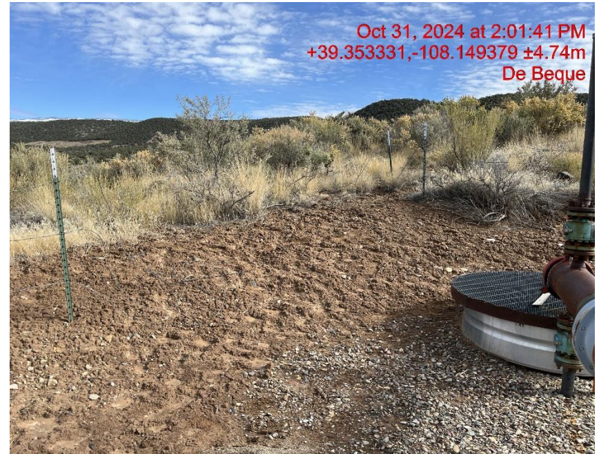
Photo # 8550 Loose barbed wire fencing/wildlife hazard NW/NE side of entrance to location