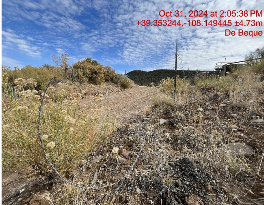
Photo # 8561 Loose barbed wire fencing/wildlife hazard NW/NE side of entrance to location