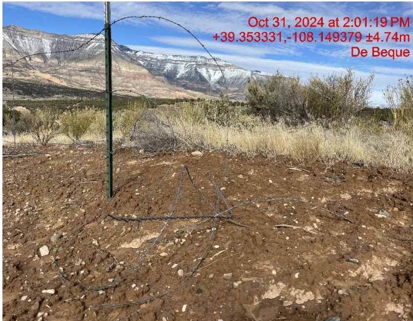
Photo # 8549 Loose barbed wire fencing/wildlife hazard NW/NE side of entrance to location