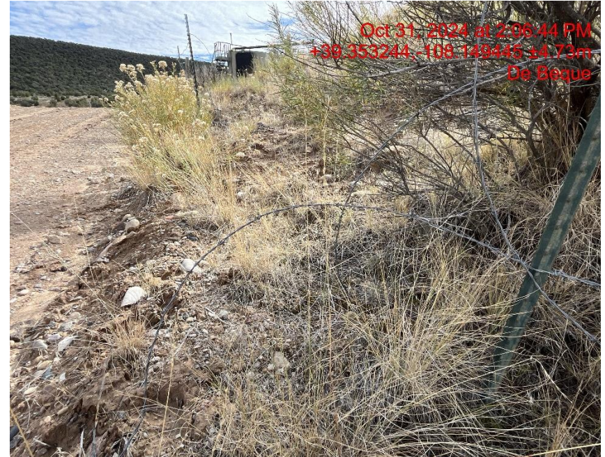
Photo # 8564 Loose barbed wire fencing/wildlife hazard NW/NE side of entrance to location