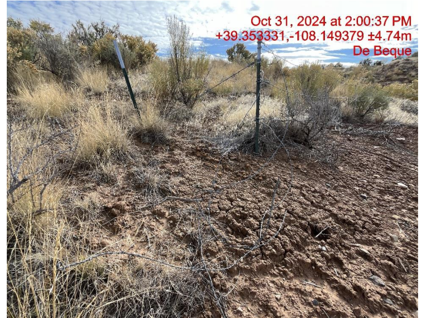
Photo # 8547 Loose barbed wire fencing/wildlife hazard NW/NE side of entrance to location