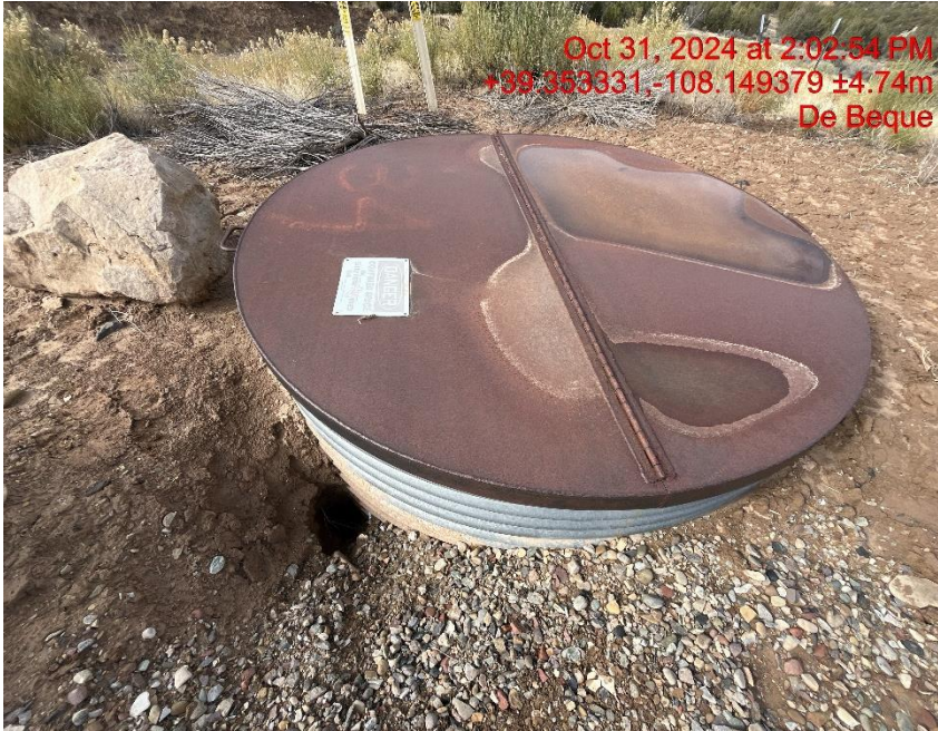
Photo # 8553 Tunnel erosion around cellar is also a wildlife/personal safety hazard near NE side of entrance to location