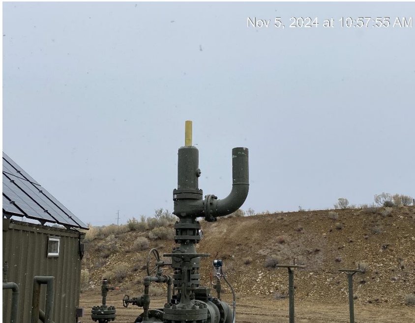
Relief riser cap missing