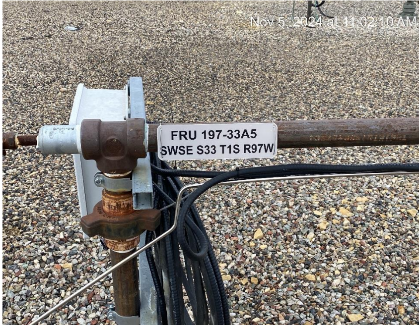
Wellhead sign missing required information