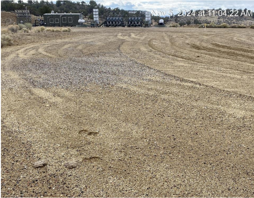
Production facility from Northeast corner of well pad