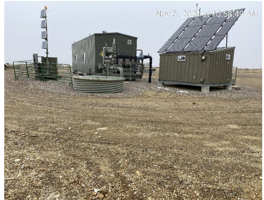
Production facility from Southeast corner