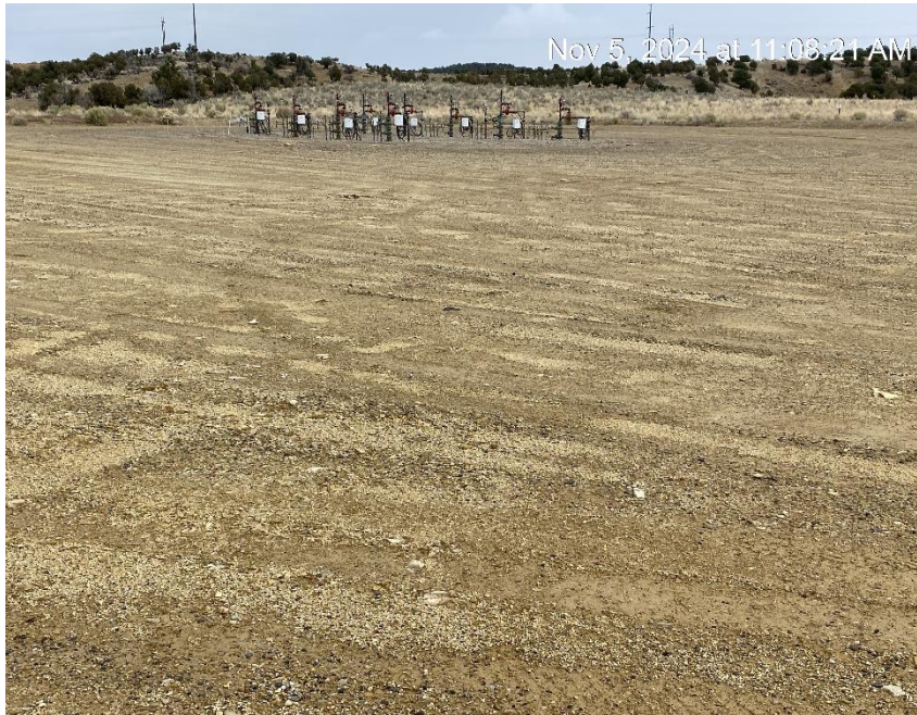
Wellheads from Southwest corner of well pad