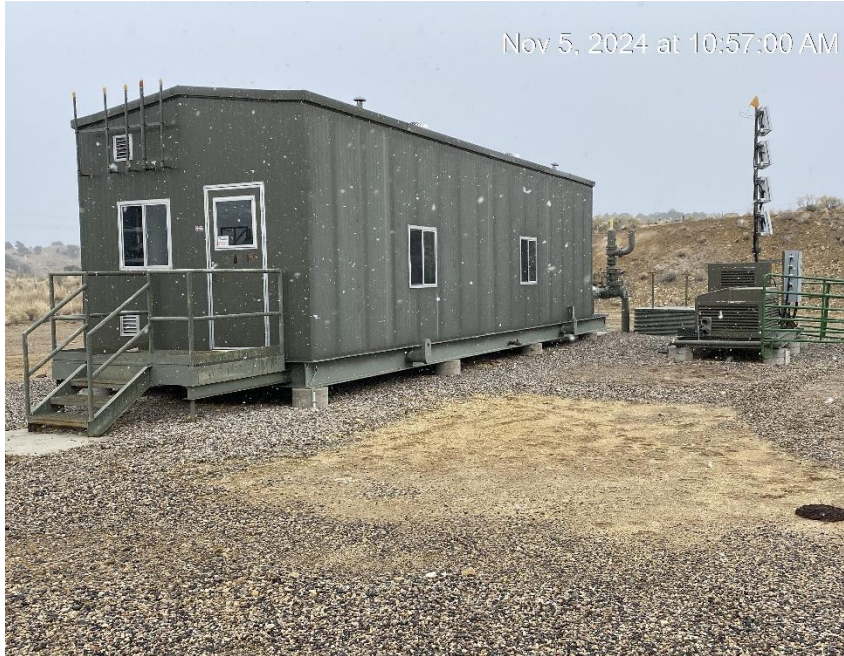
Production facility from South entrance