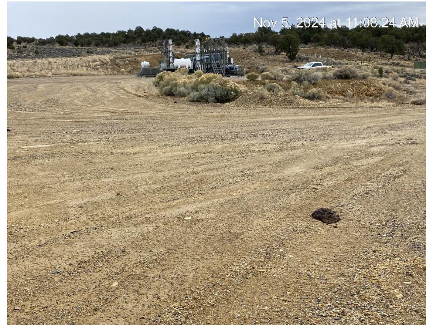
Production equipment from Southwest corner of well pad