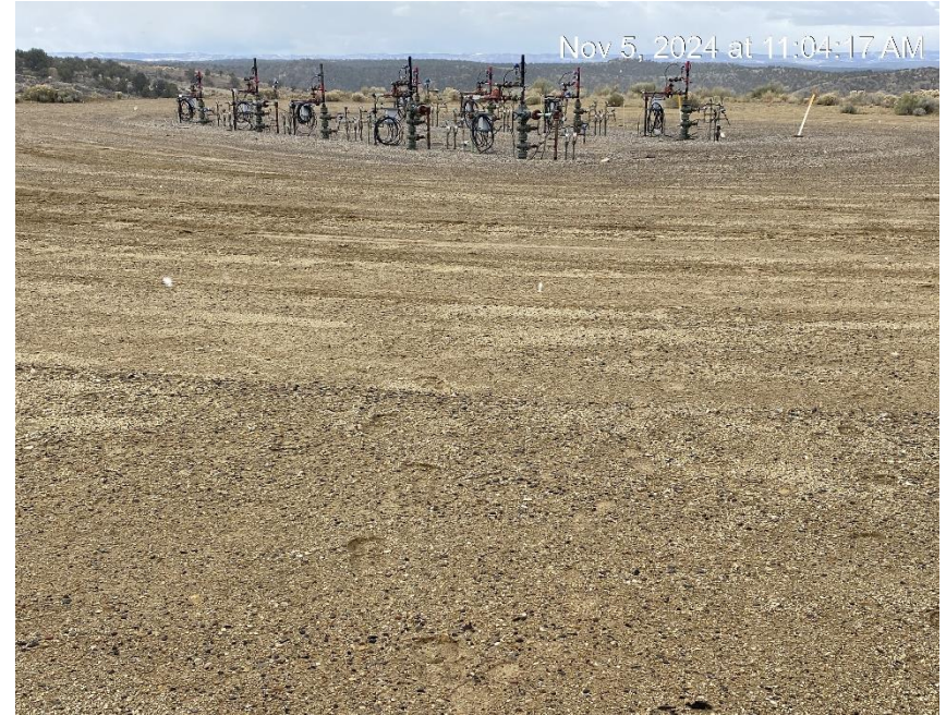
Wellheads from Northeast corner of well pad