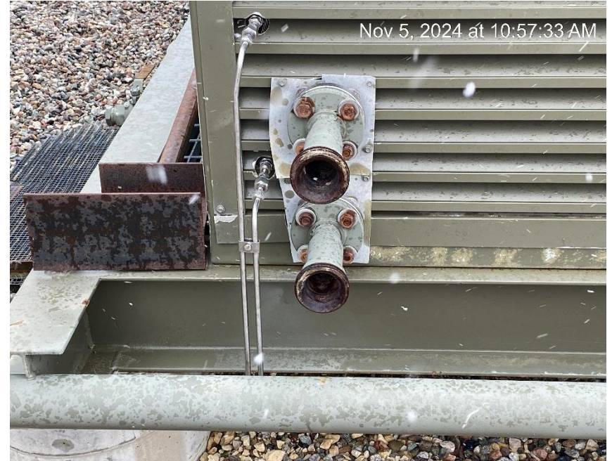
Open to wildlife