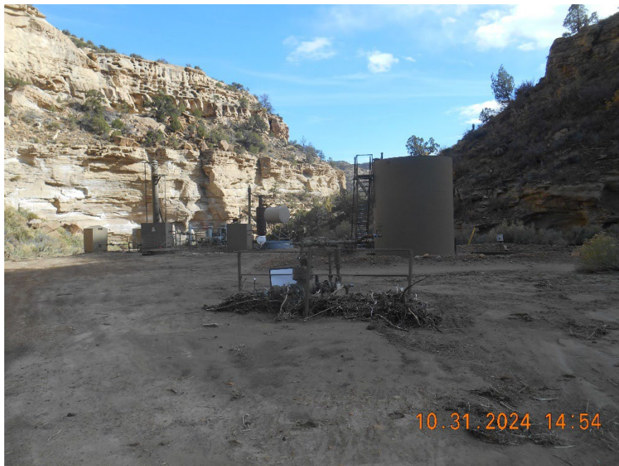
Location overview looking E

Inspection Date: 10/31/2024 Inspection Doc#: 693807896