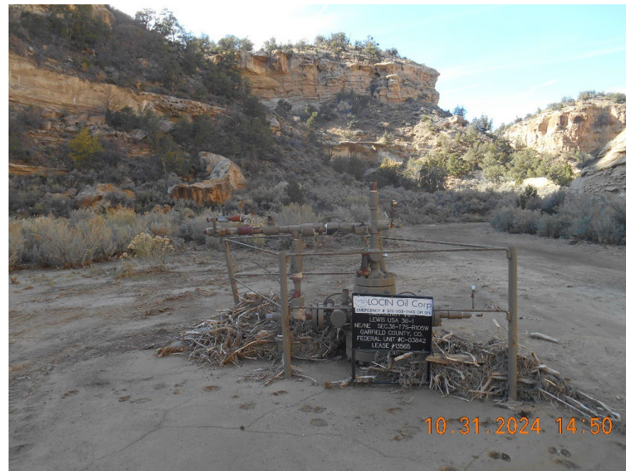
Wellhead with sign