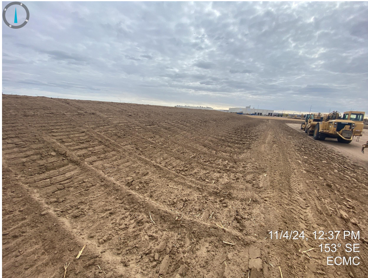
Photo 13. Western side of the topsoil stockpile. It appears that the stockpile has been equipment tracked for short term stabilization.