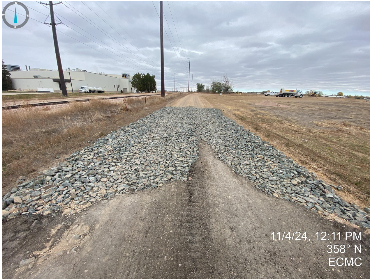
Photo 1. Tracking pad installed at the location entrance.