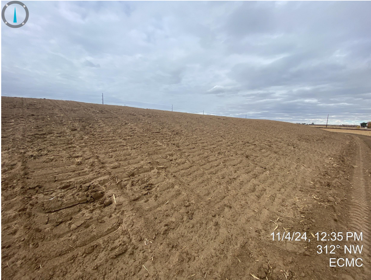
Photo 12. Eastern side of the topsoil stockpile. It appears that the stockpile has been equipment tracked for short term stabilization.