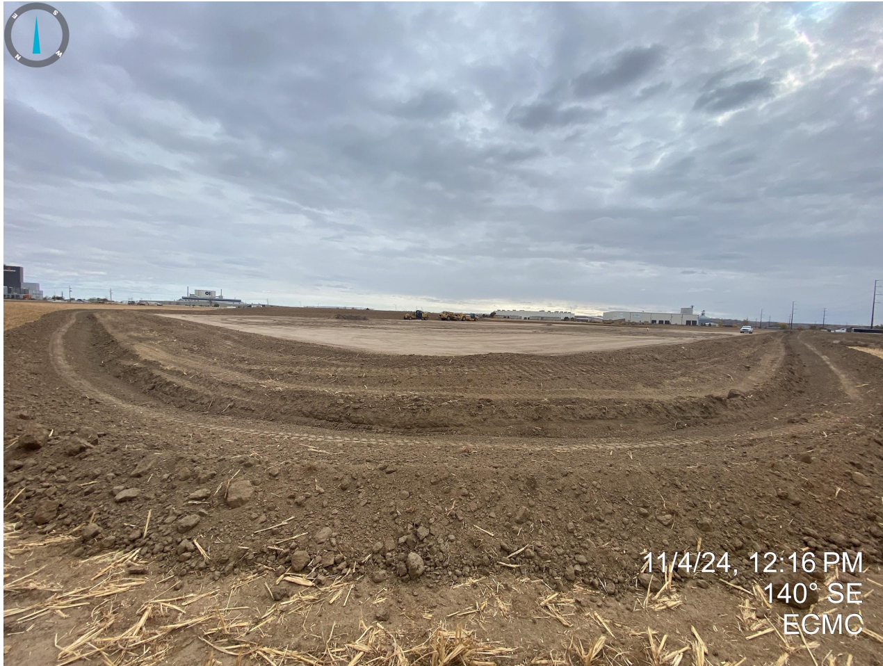
Photo 6. Facing southeast from the northwest corner of the disturbance area. Photo illustrates that a perimeter ditch and berm has been constructed around the entire drilling pad.