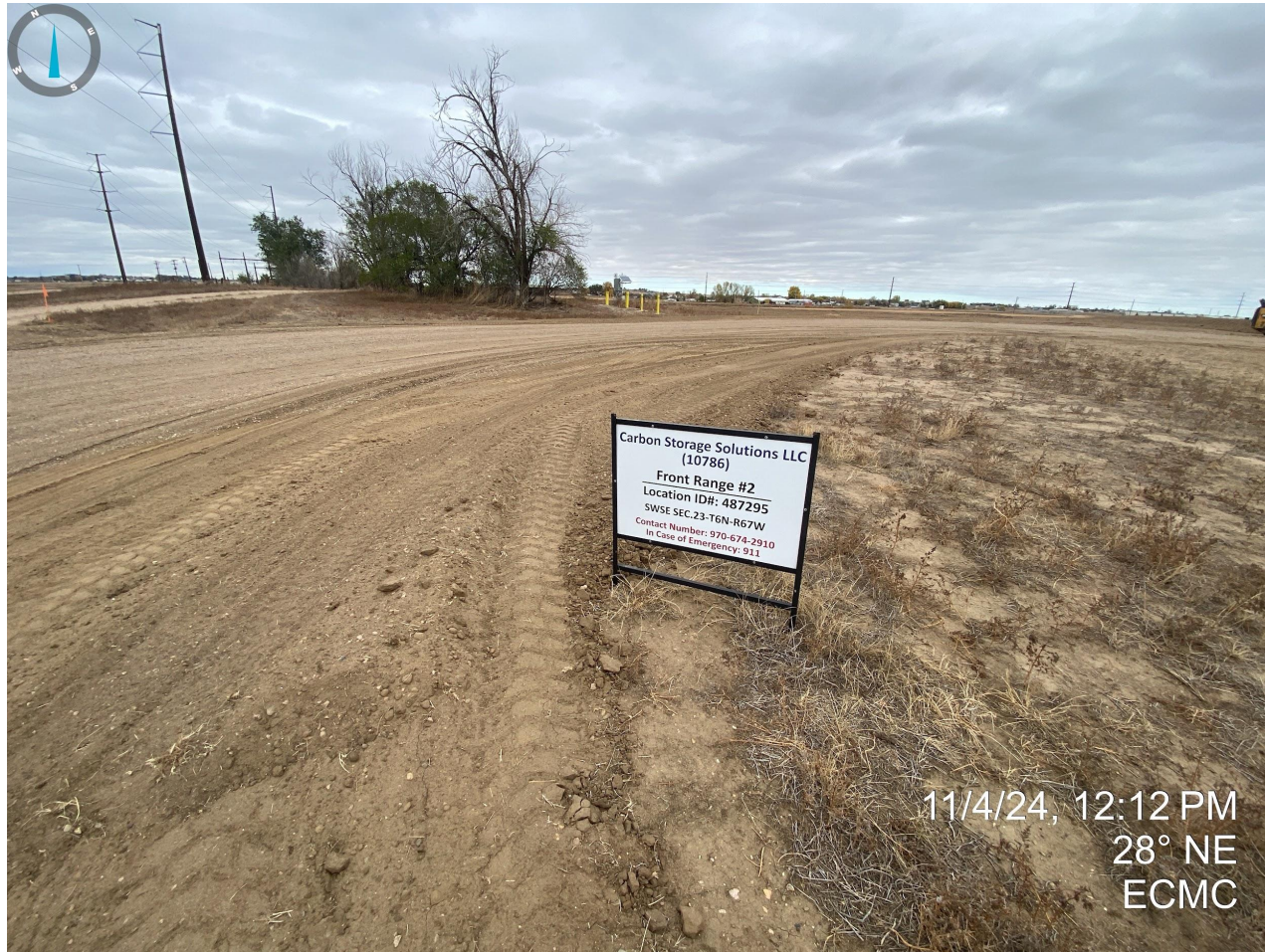
Photo 2. Location sign post at the entrance. A copy of the Form 2A was not posted in a conspicuous location at the time of this inspection; this is not in compliance with Rule 406.c.