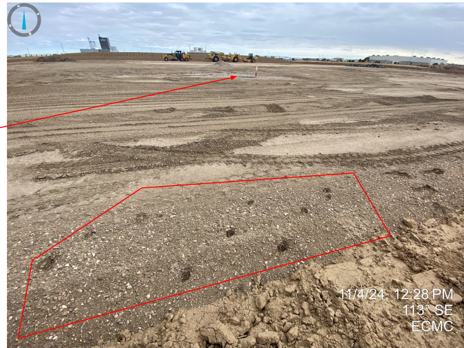
Photo 11. Wildlife tracks observed adjacent to the well cellar.