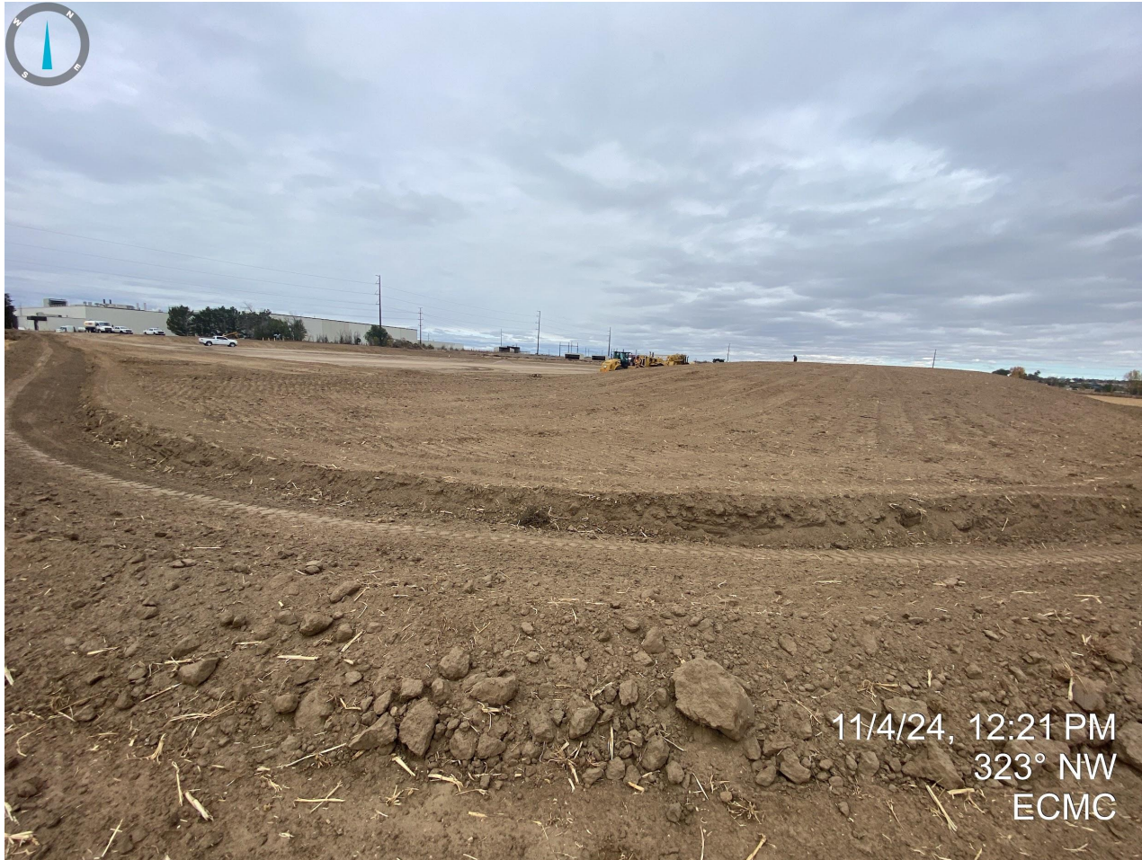
Photo 8. Taken near the southeast corner of the disturbance area, facing northwest. Photo illustrates a perimeter ditch and berm has been constructed. Topsoil stockpile pictured in background.