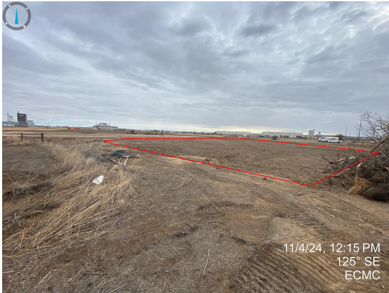
Photo 3. Facing southeast from the northwest corner of the disturbance area. It appears that the northwest portion of the disturbance area was grubbed, or cleared of vegetation (approximated by red polygon). It did not appear that topsoil had been salvaged; if the construction area/drilling pad expands, topsoil will need to be salvaged in compliance with Rule 1002.b.