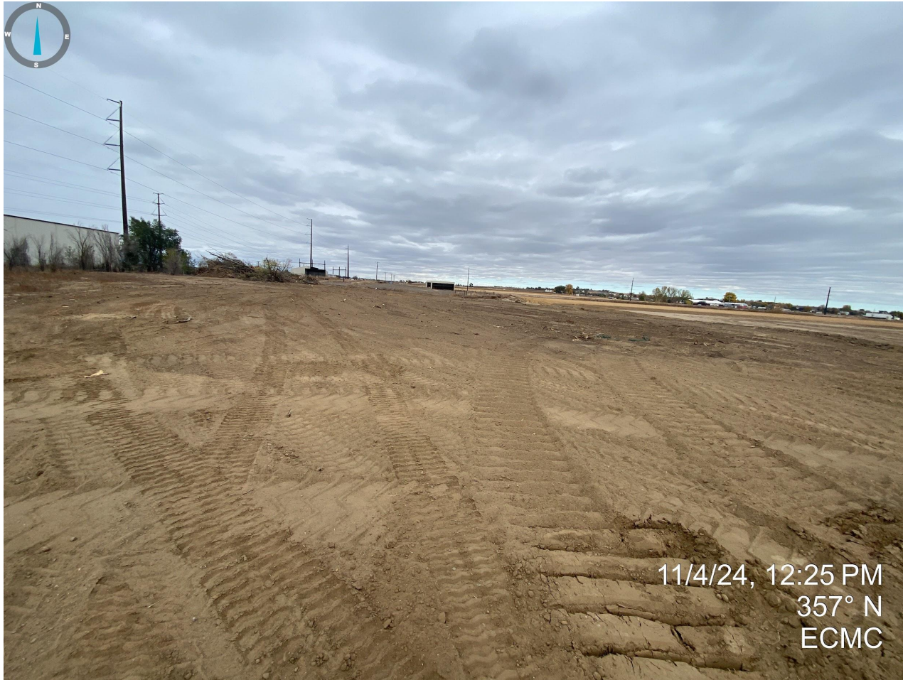
Photo 5. Continued from Photo 3, facing north from the southern boundary. See comments in Photo 3.