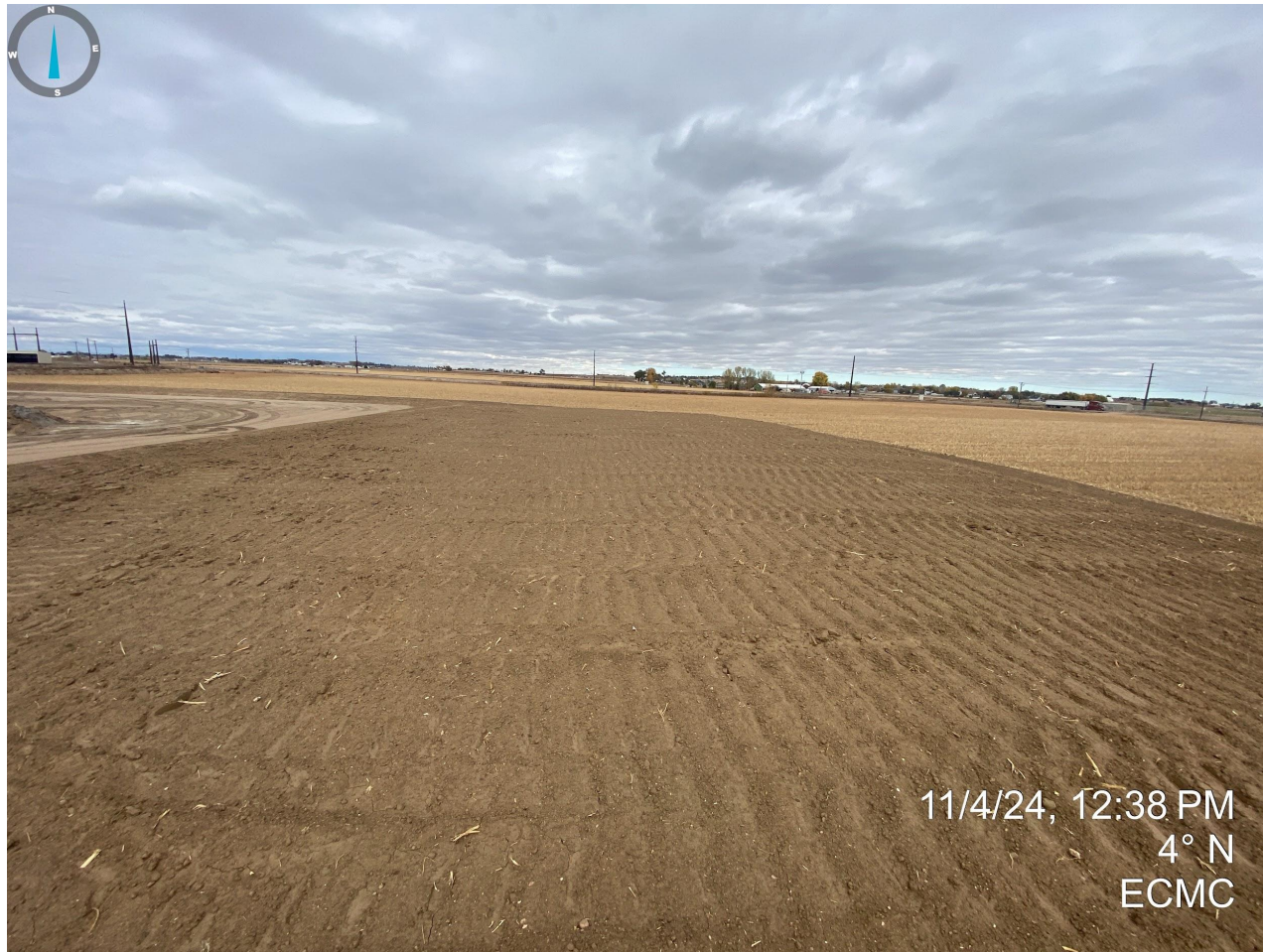
Photo 14. Top portion of the topsoil stockpile. It appears that the stockpile has been equipment tracked for short term stabilization.