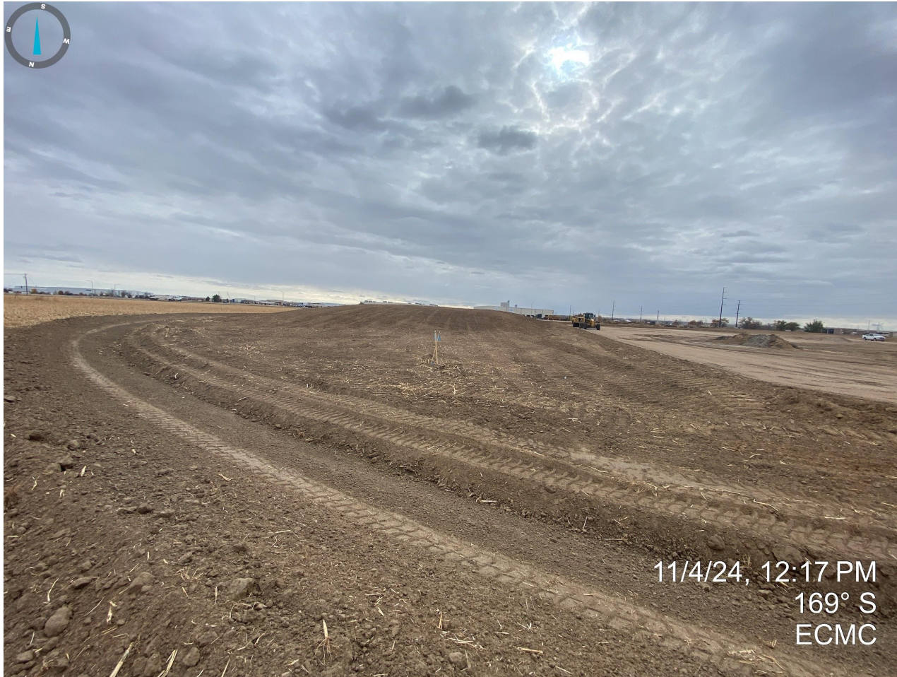
Photo 7. Taken near the northeast corner of the disturbance area, facing south. Photo illustrates a perimeter ditch and berm has been constructed. Topsoil stockpile pictured in background.