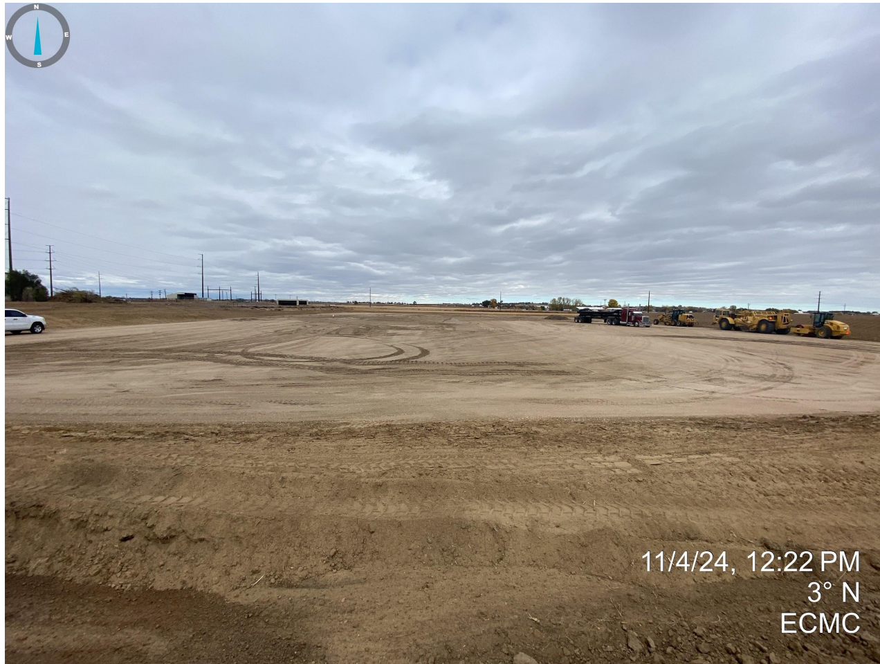
Photo 9. Taken from the southern/center portion of the disturbance area, facing north. Photo shows an overview of the drilling pad.