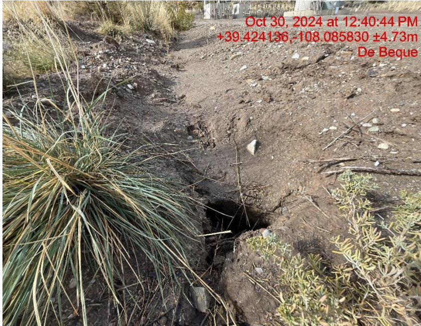
Photo # 8368 Tunnel erosion in ditch, is also a wildlife/personal safety hazard