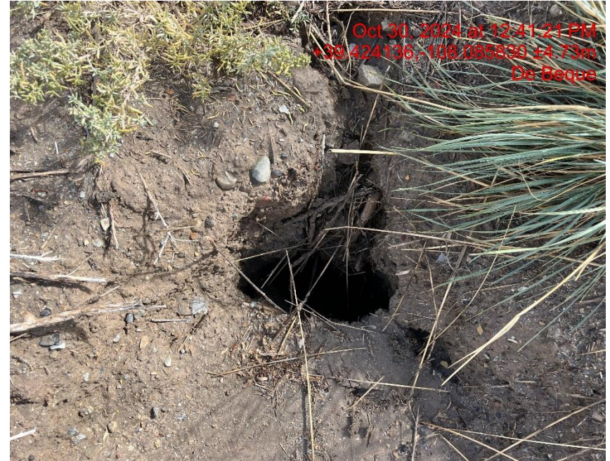
Photo # 8369 Tunnel erosion in ditch, is also a wildlife/personal safety hazard