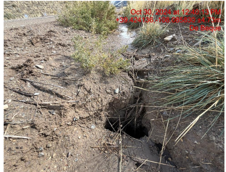
Photo # 8366 Tunnel erosion in ditch, is also a wildlife/personal safety hazard