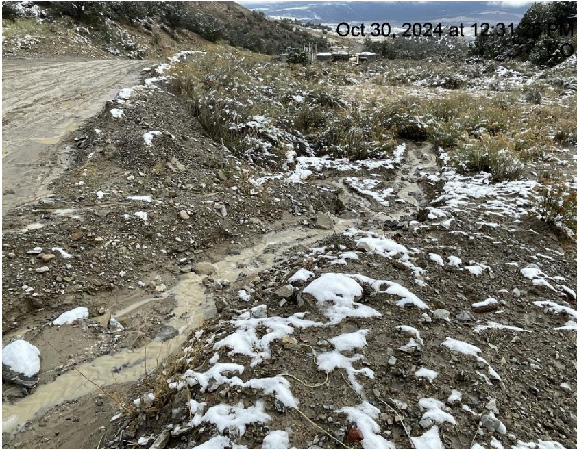
Photo # 8406 Sediment laden stormwater running off lease road into a vegetated area/insufficient BMP's