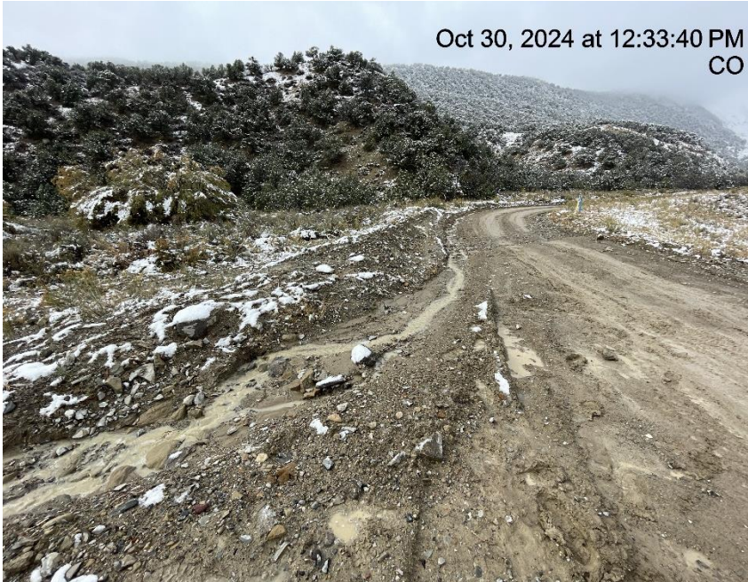
Photo # 8404 Sediment laden stormwater running off lease road into a vegetated area/insufficient BMP's