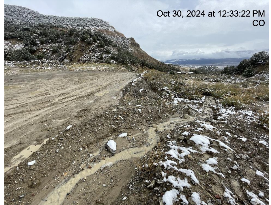
Photo # 8405 Sediment laden stormwater running off lease road into a vegetated area/insufficient BMP's