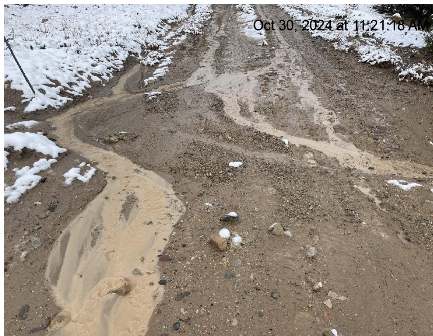
Photo # 8159 Insufficient BMP's at entrance to location /sediment laden stormwater migrating from lease road onto location