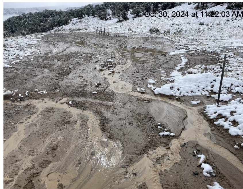
Photo # 8160 Insufficient BMP's at entrance to location /sediment laden stormwater migrating from lease road onto location