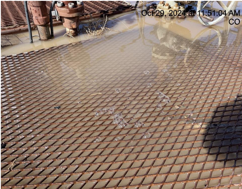
Photo # 7986 Possible wellhead leak/gas bubbling up near wellhead through water in cellar (A11 well)