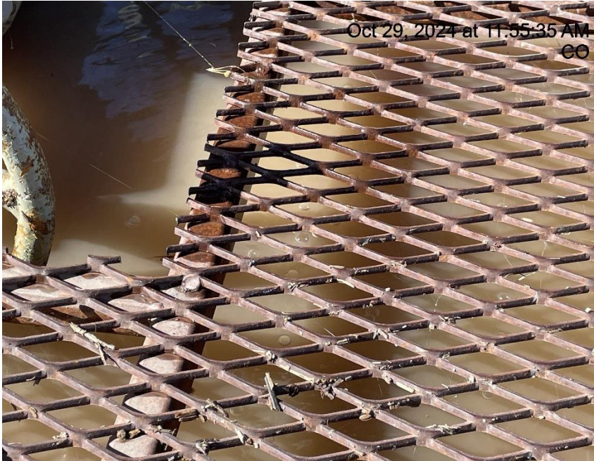
Photo # 7988 Possible wellhead leak/gas bubbling up near wellhead through water in cellar (A9 well)