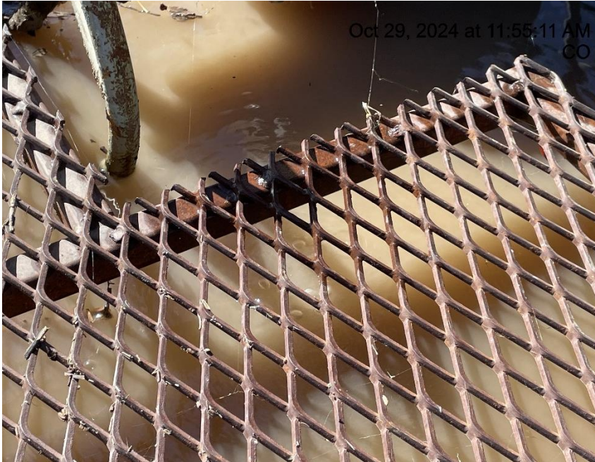
Photo # 7990 Possible wellhead leak/gas bubbling up near wellhead through water in cellar (A9 well)