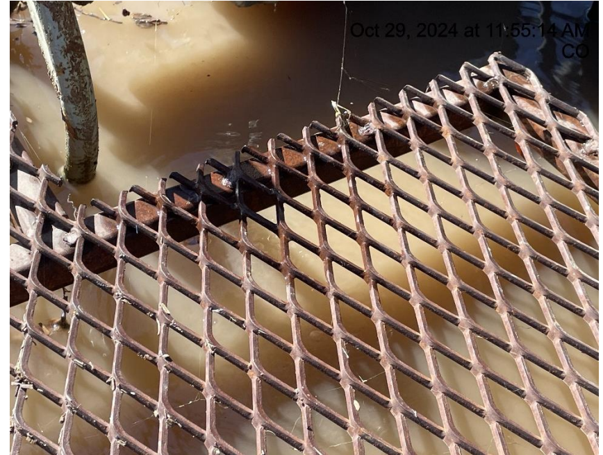
Photo # 7989 Possible wellhead leak/gas bubbling up near wellhead through water in cellar (A9 well)