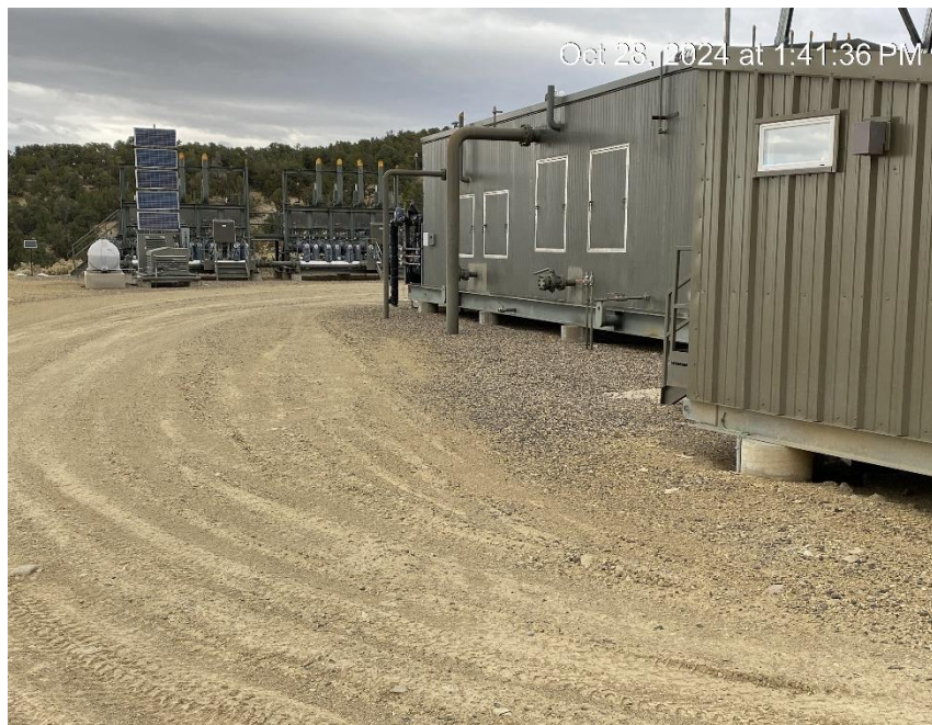
Production facility from Southwest corner