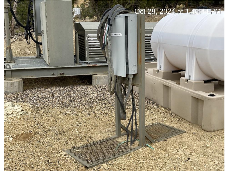
Debris? Unused equipment?