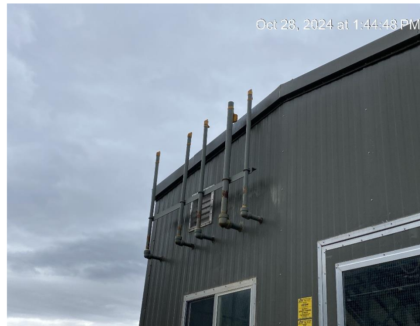
Vent cap not in place