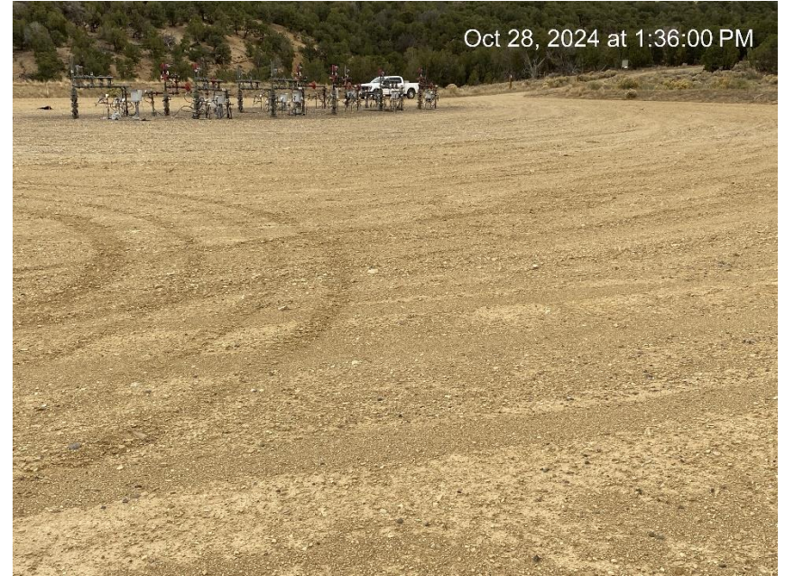
Well pad from Southwest corner