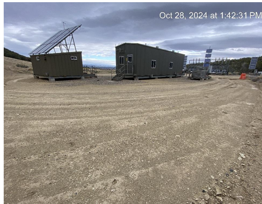
Production facility from Southeast corner