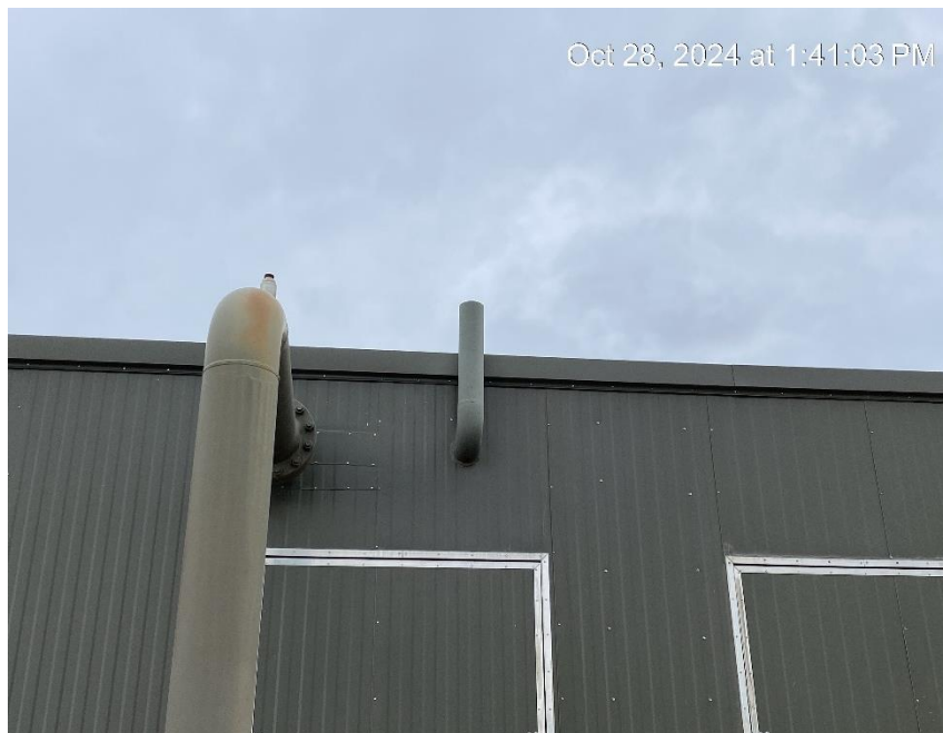
Vent cap missing