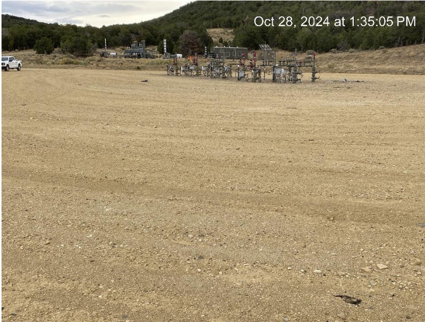
Well pad from Northwest corner