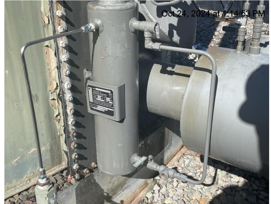
Photo # 7166 PRV vent line does not comply with CECMC pressure safety device rules