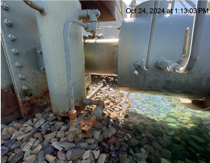
Photo # 7163 PRV vent line does not comply with CECMC pressure safety device rules