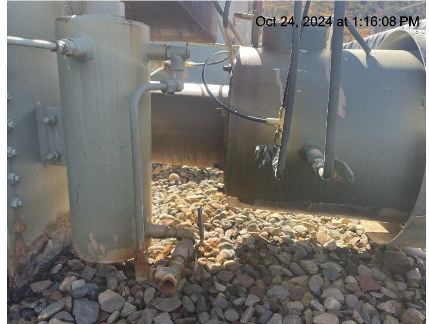
Photo # 7164 PRV vent line does not comply with CECMC pressure safety device rules