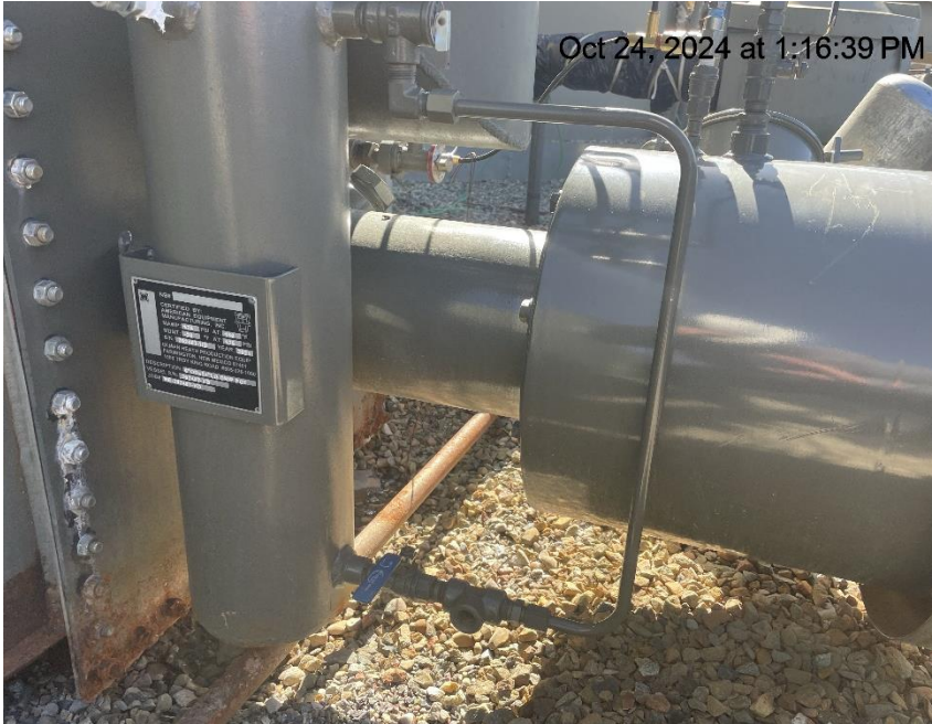
Photo # 7165 PRV vent line does not comply with CECMC pressure safety device rules