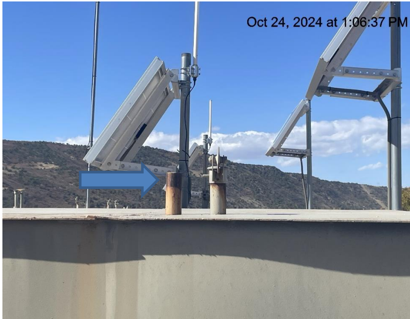
Photo # 7161 Rupture disc vent line on separator does not comply with CECMC pressure safety device rules