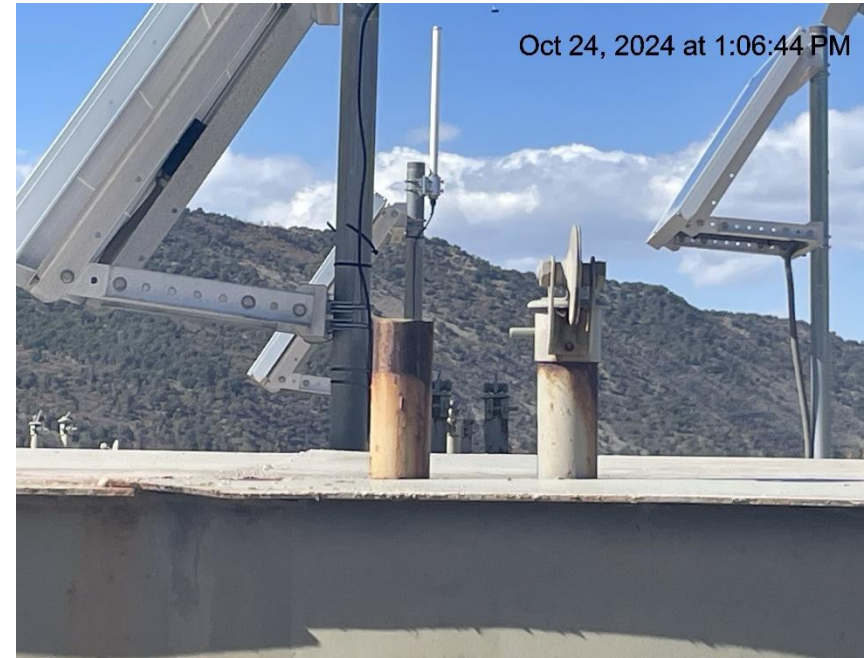
Photo # 7162 Rupture disc vent line on separator does not comply with CECMC pressure safety device rules