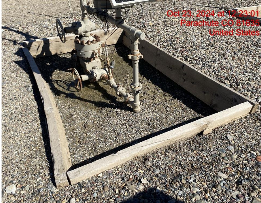
Open Wellhead Cellar/No Wildlife Egress – Photo #04450