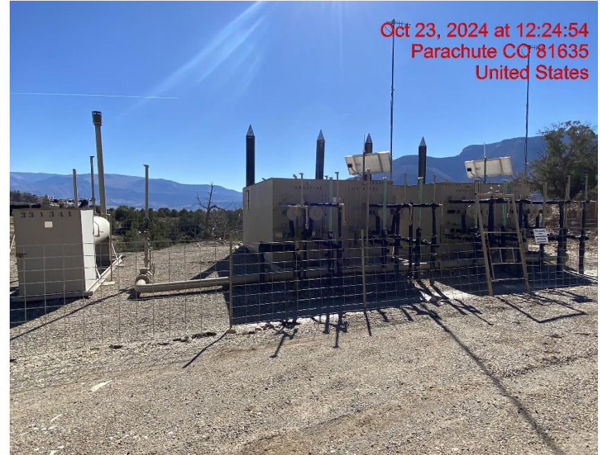
Location – Photo #04452