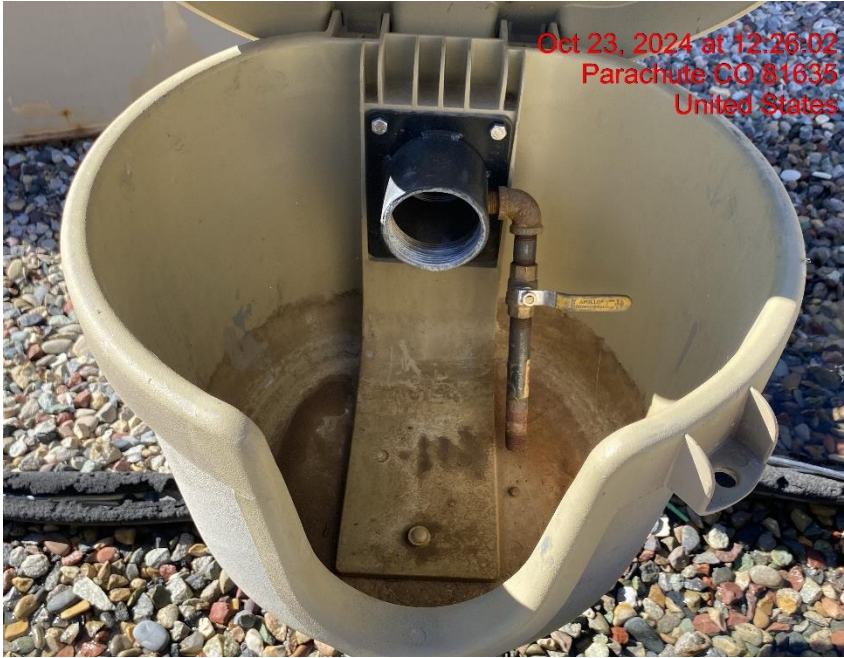
Open-Ended Load Line – Photo #04457