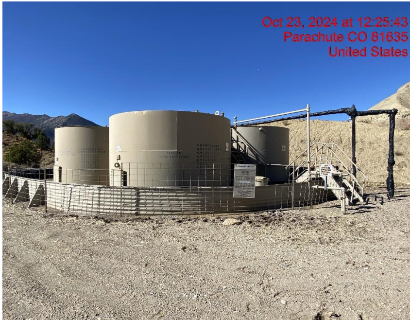
Location – Photo #04455