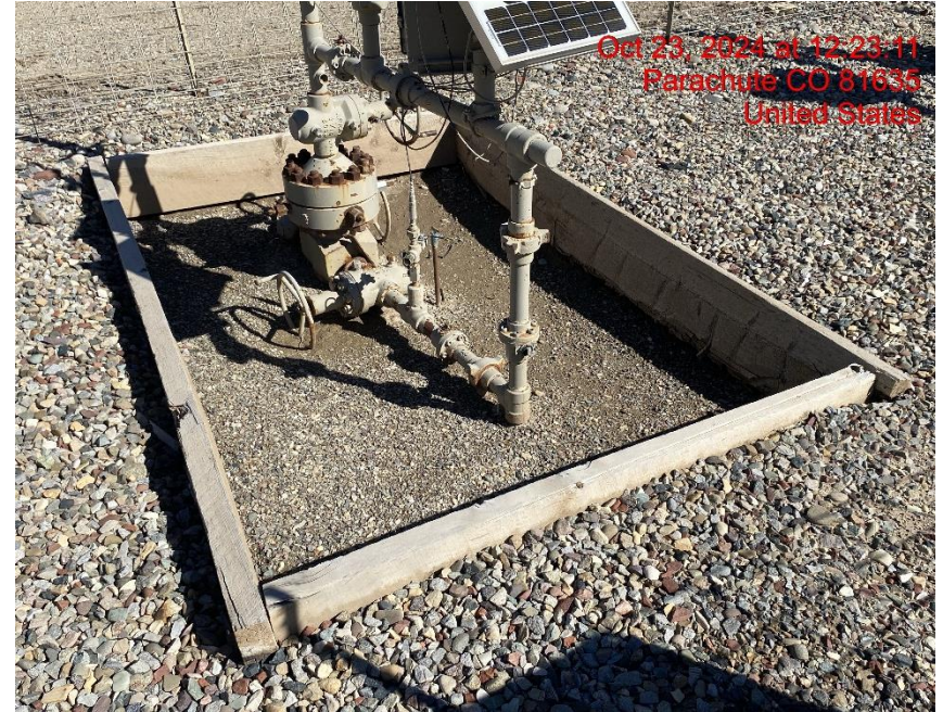
Open Wellhead Cellar/No Wildlife Egress – Photo #04451