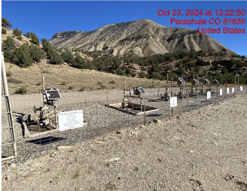
Location – Photo #04448