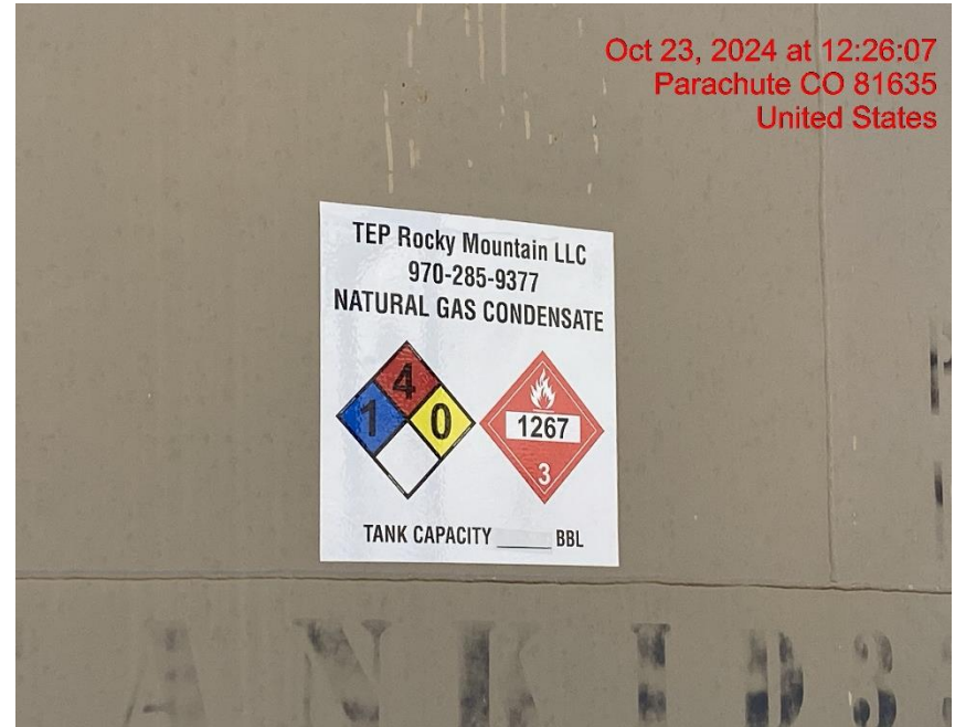
Condensate Tank Labels Do Not State Tank Capacity – Photo #04458