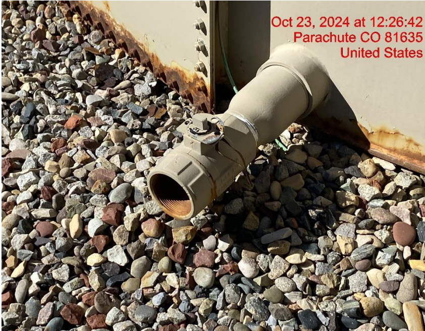
Open-Ended Line on Storage Tank – Photo #04460