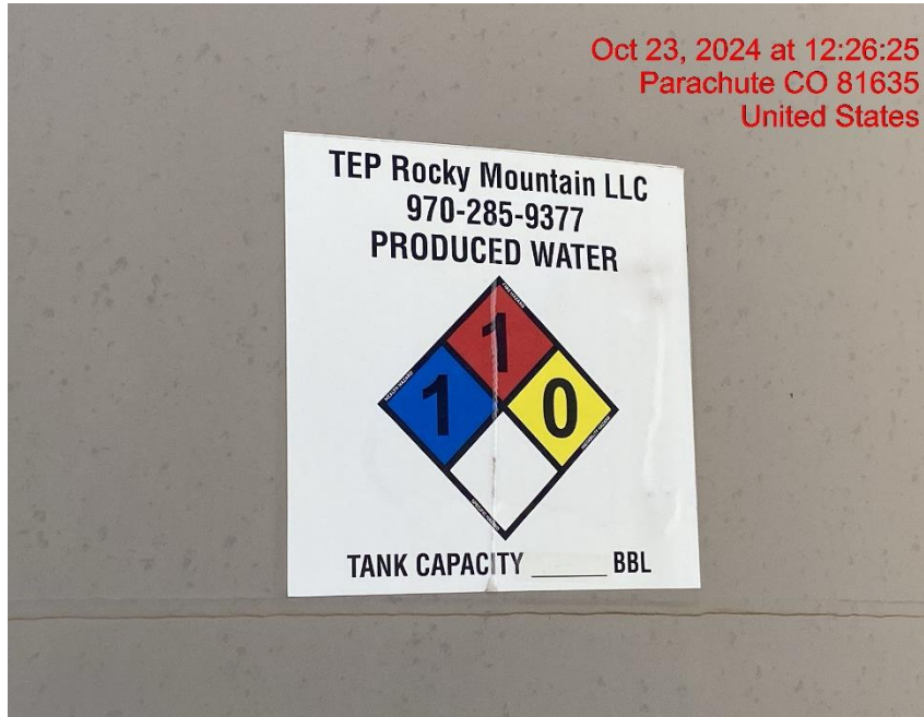
Produced Water Tank Labels Do Not State Tank Capacity – Photo #04459