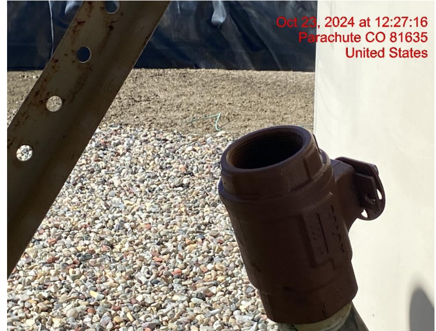
Open-Ended Line on Storage Tank – Photo #04465