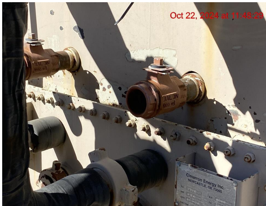
Open-Ended Line on Separator – Photo #04388