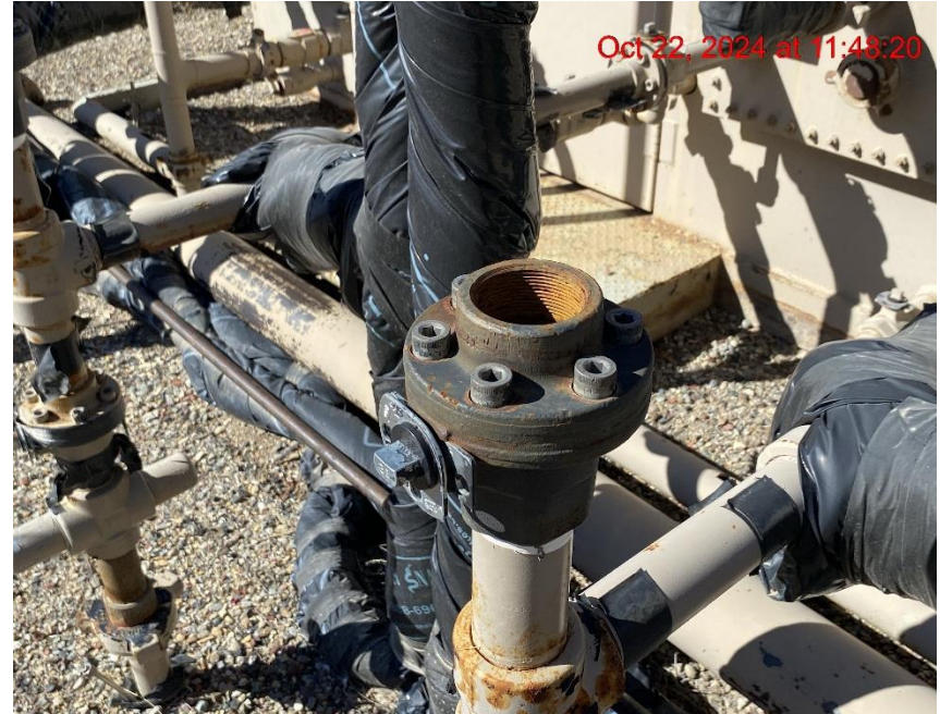
Open-Ended Line on Separator – Photo #04387