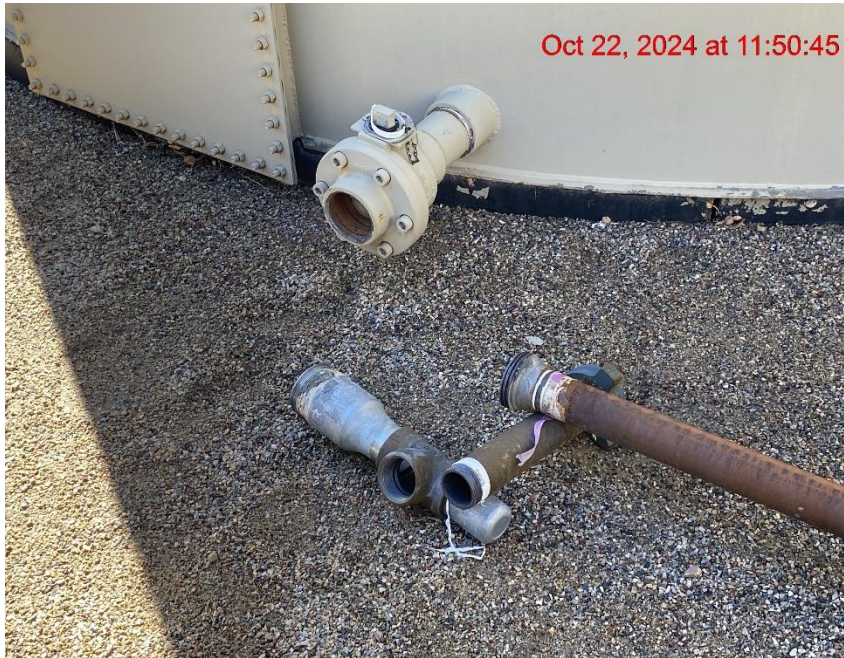
Open-Ended Manifold Line/Stored Supplies – Photo #04396