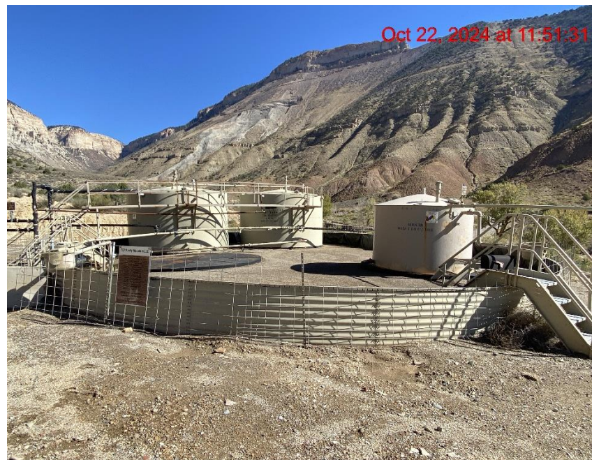
Tank Battery – Photo #04398