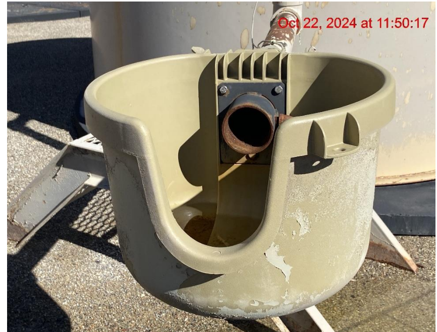
Open-Ended Load Line – Photo #04394