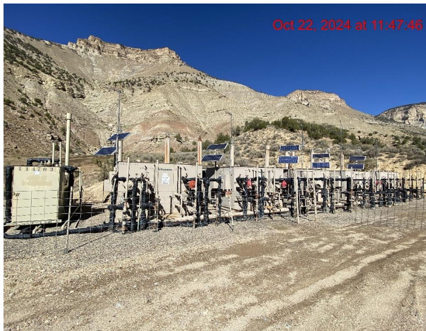
Separators – Photo #04385