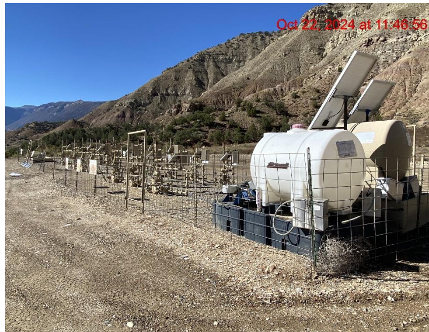
Wellheads – Photo #04383