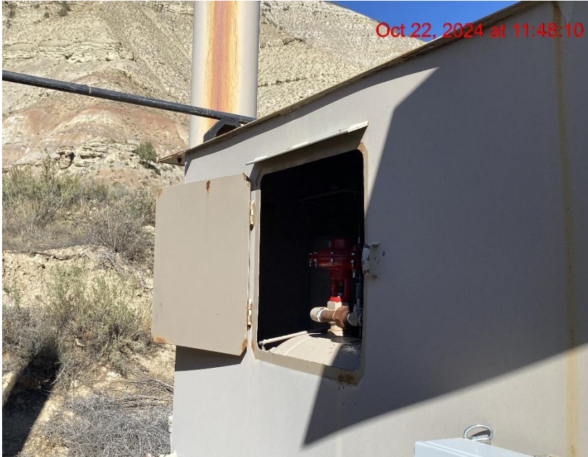
Unsecured Separator/Wildlife Entry Hazard – Photo #04386