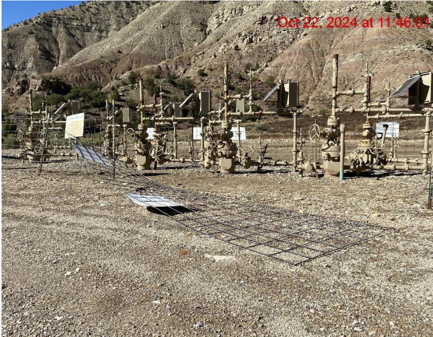
Damaged Wellhead Fencing – Photo #04382