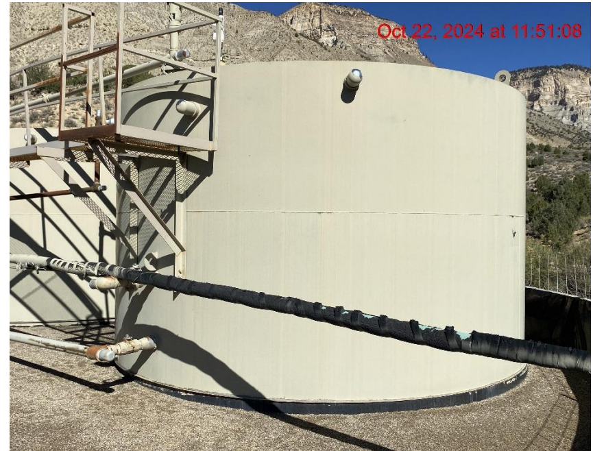
No Labeling on Storage Tank – Photo #04397