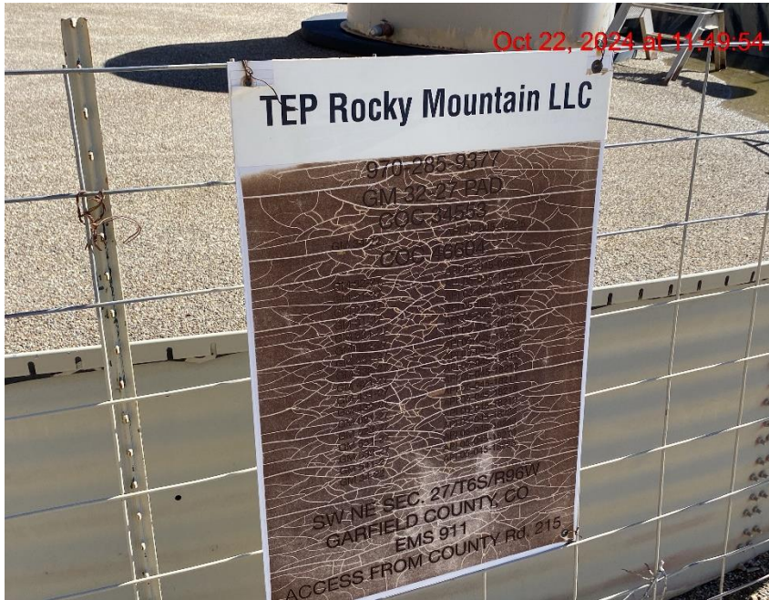
Weathered and Illegible Battery Sign – Photo #04392