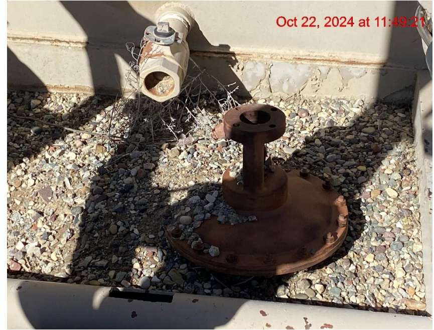
Stored Supplies – Photo #04390