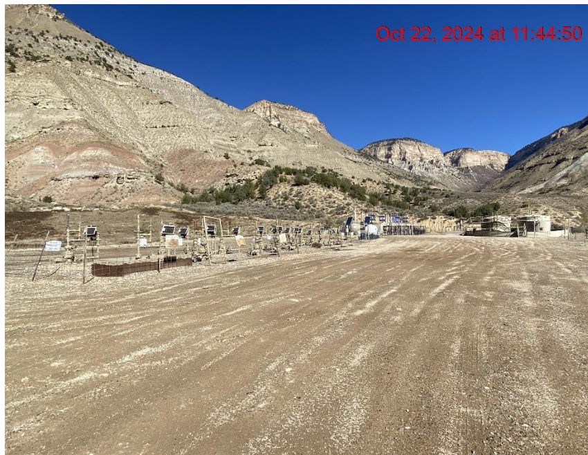
Location Entrance – Photo #04380