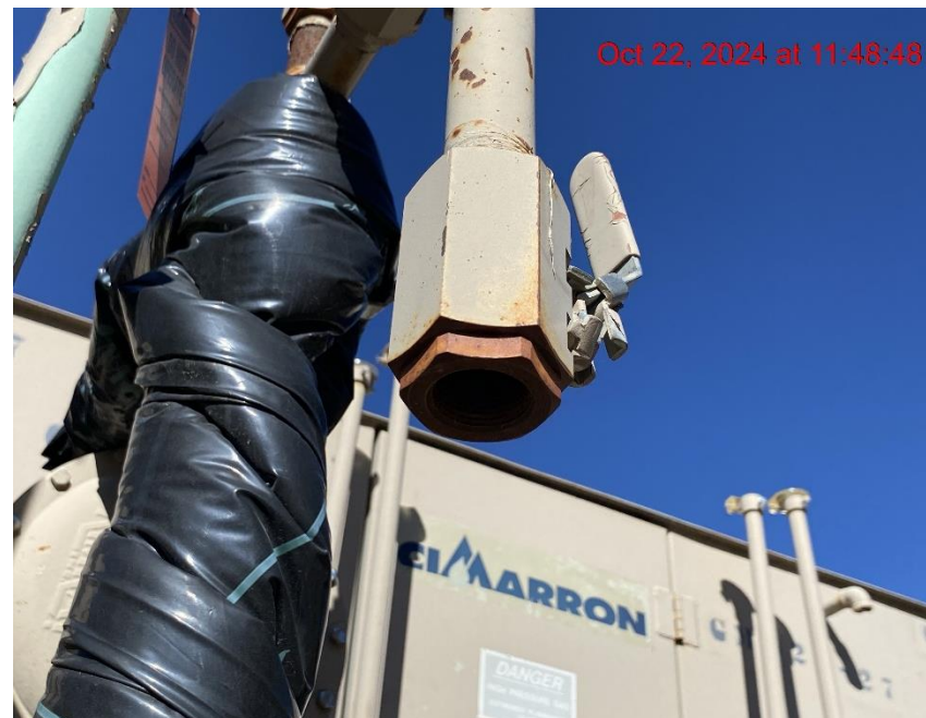
Open-Ended Line on Separator – Photo #04389