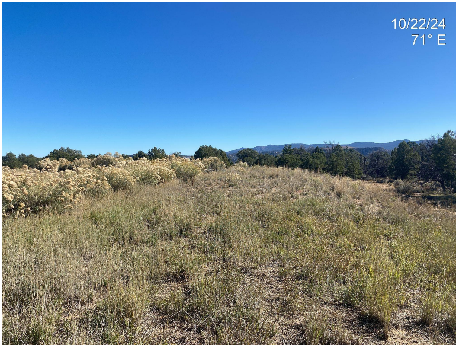
Photo 2. View of the southern interim reclamation area facing west. Vegetation consists of Intermediate Wheatgrass, Smooth Brome and Sand Dropseed.