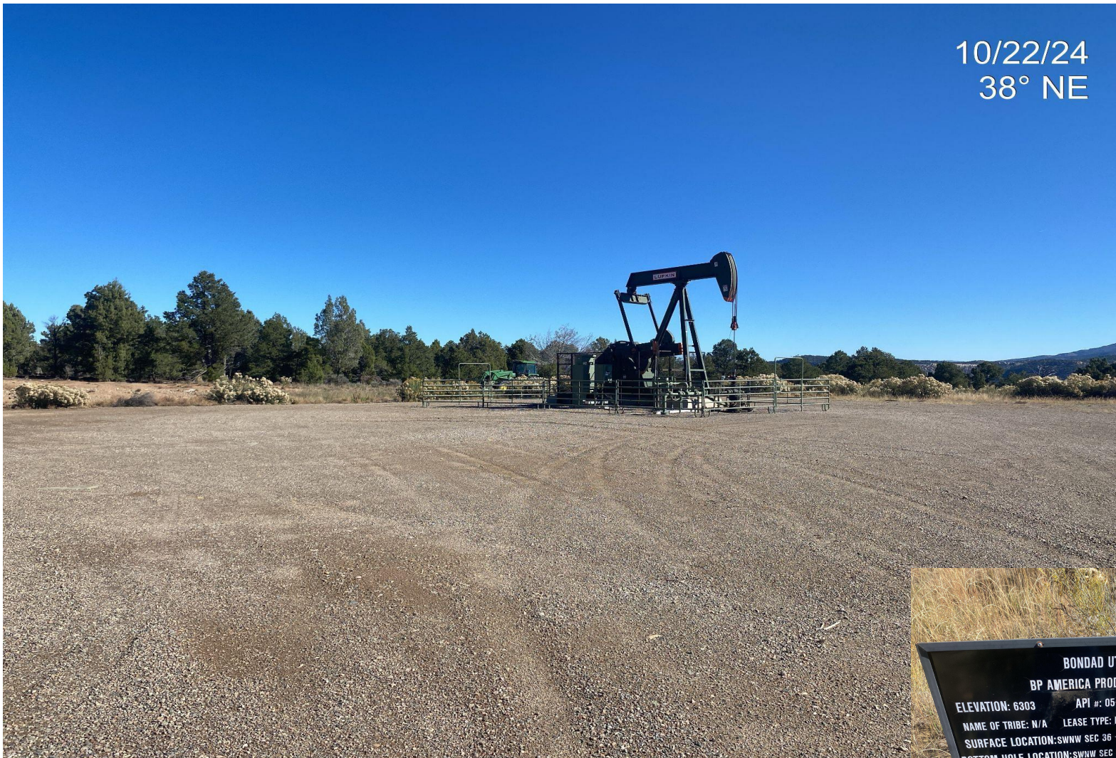
Photo 1. View of the well pad taken from the access point facing center. Note: well sign is not reflecting current operator.