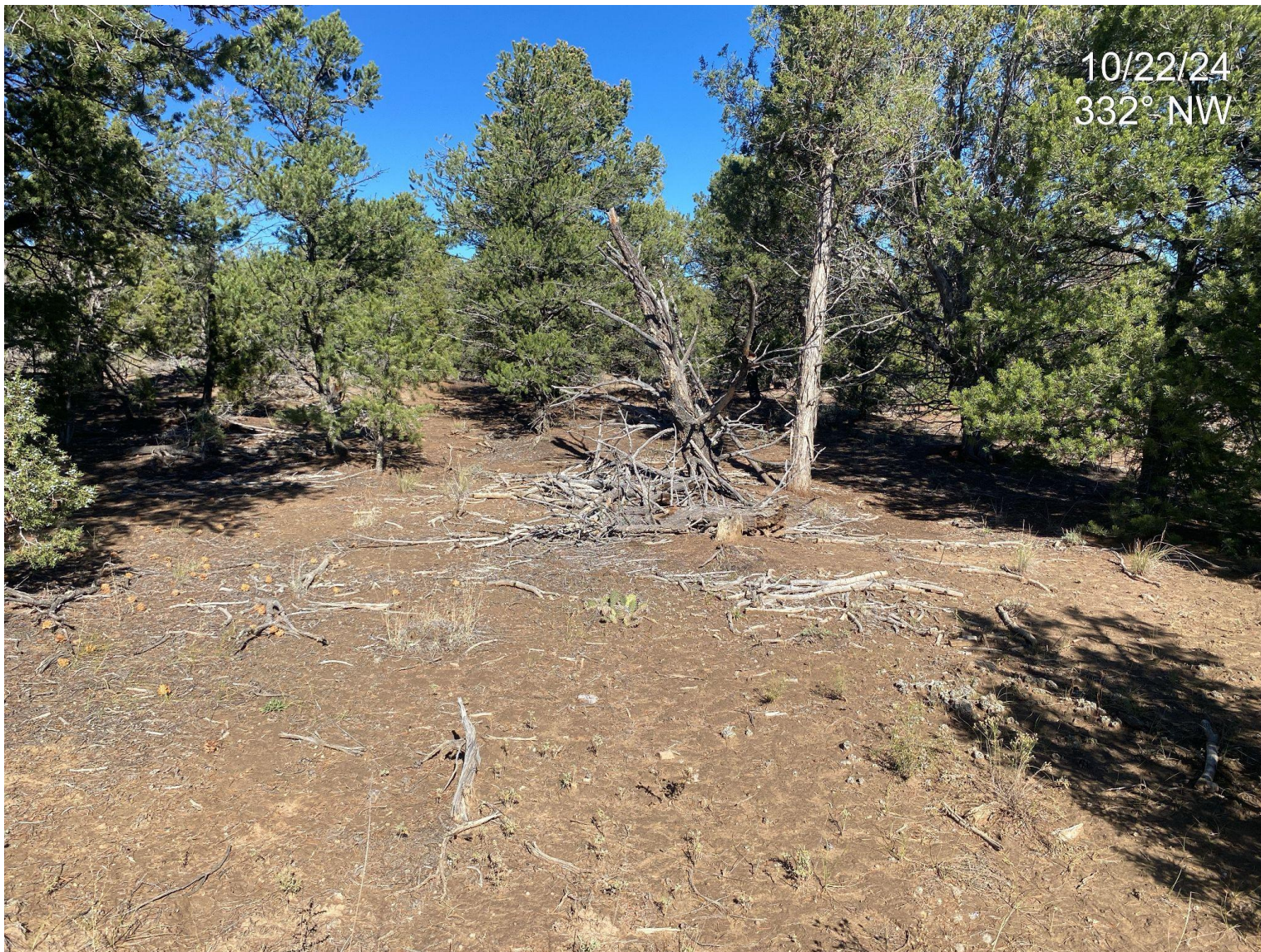
Photo 6. Reference area composed of Prickly Pear, Blue Grama and Juniper.