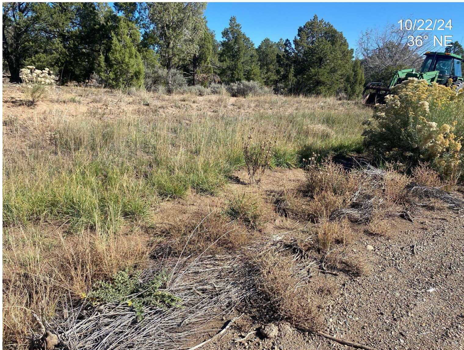
Photo 4. Small patch of flowering Musk Thistle observed along the northern edge of the active pad.