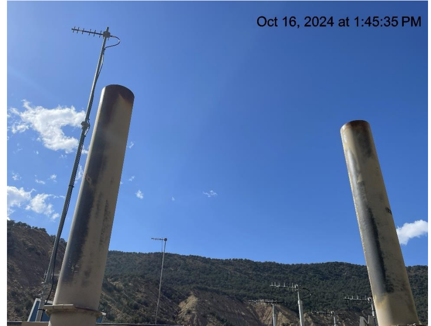
Photo # 6136 Burner exhaust stacks on separator units lack bird protection/wildlife hazard