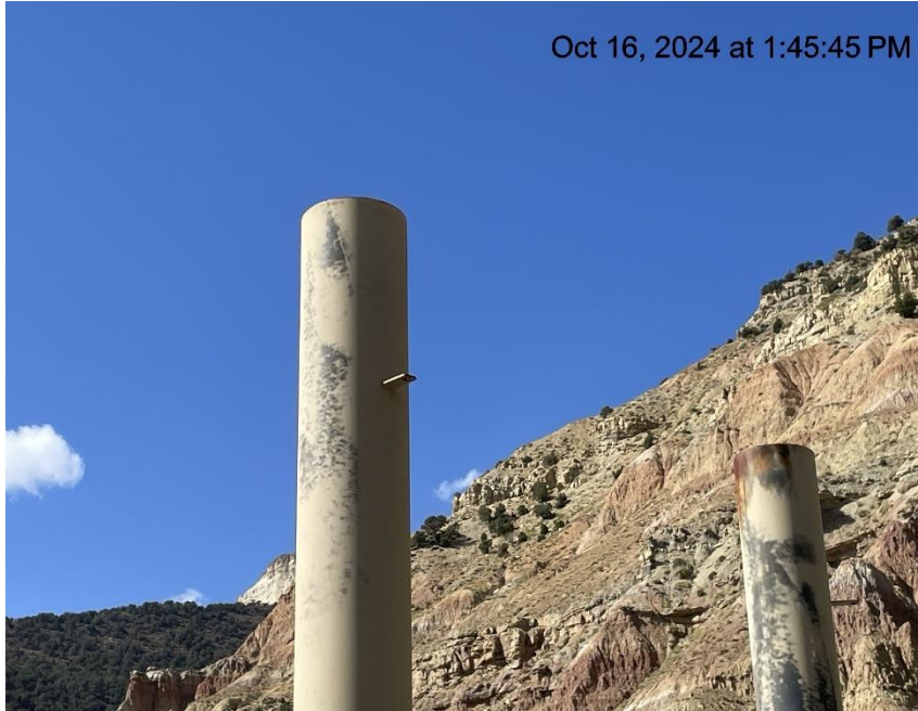
Photo # 6135 Burner exhaust stacks on separator units lack bird protection/wildlife hazard