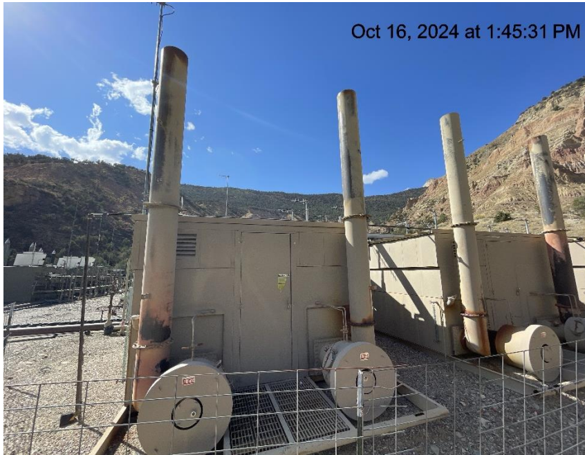
Photo # 6133 Burner exhaust stacks on separator units lack bird protection/wildlife hazard