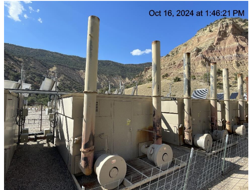
Photo # 6134 Burner exhaust stacks on separator units lack bird protection/wildlife hazard