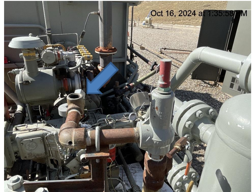
Photo # 6126 PRV vent line on VALERUS compressor does not comply with CECMC pressure safety device rules (additionally hole drilled in the 90 on vent line is pointing straight out & not down which constitutes a safety issue as well)