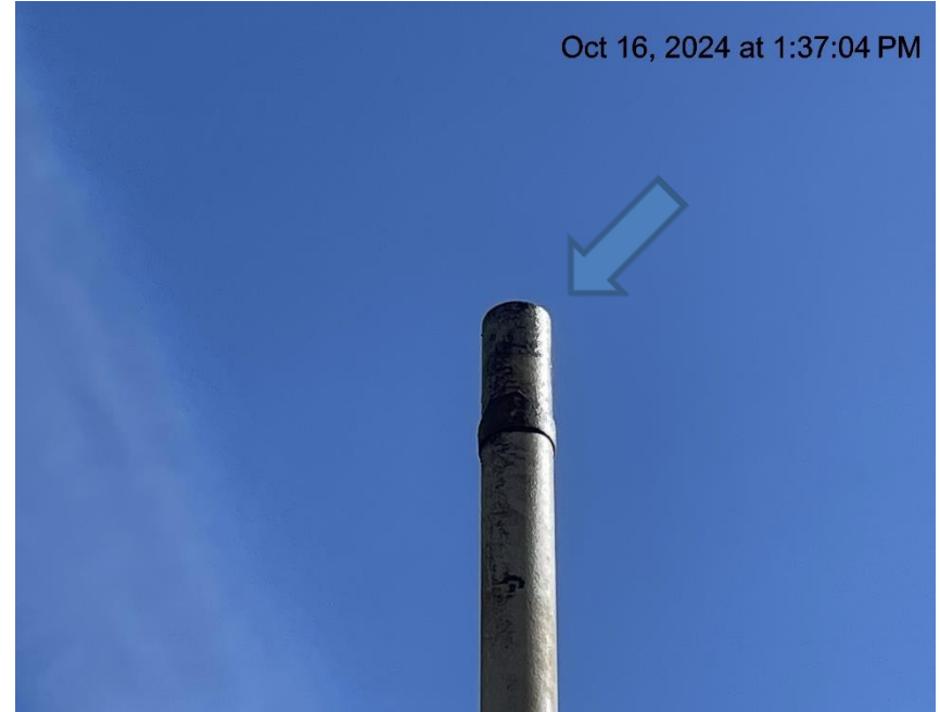
Photo # 6128 PRV vent line on VALERUS compressor does not comply with CECMC pressure safety device rules