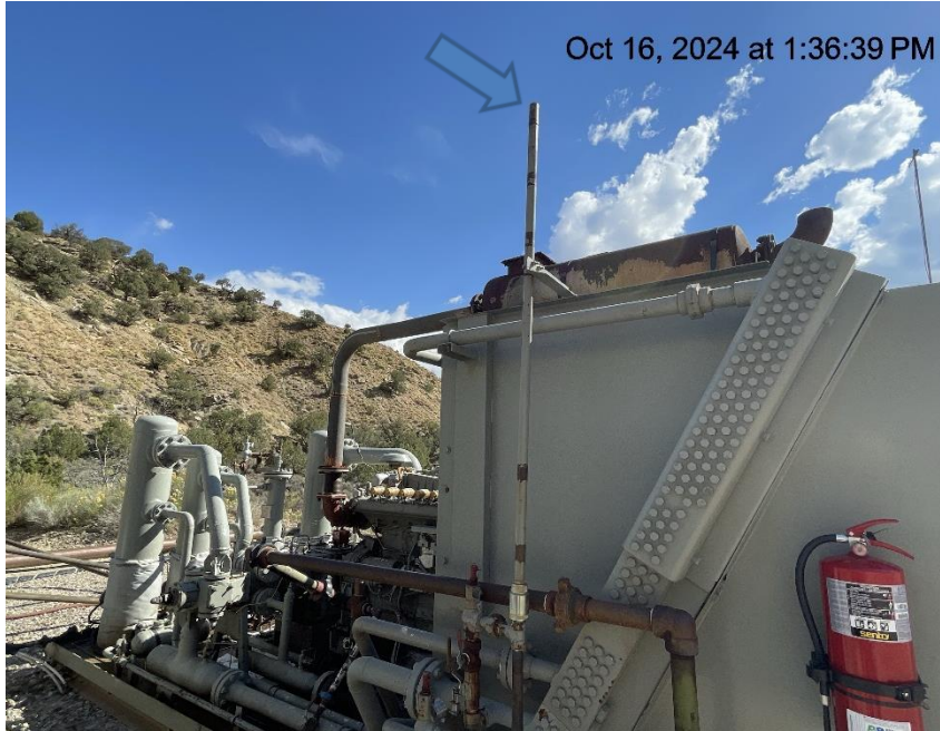
Photo # 6127 PRV vent line on VALERUS compressor does not comply with CECMC pressure safety device rules