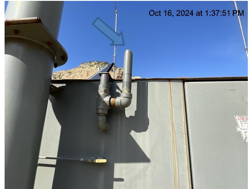
Photo # 6130 PRV vent line on separator does not comply with CECMC pressure safety device rules