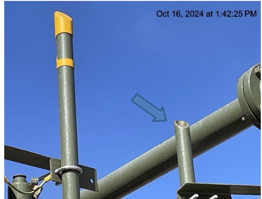
Photo # 6132 PRV vent line on FLOGISTIX compressor does not comply with CECMC pressure safety device rules