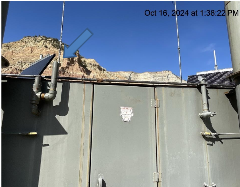
Photo # 6129 PRV vent line on separator does not comply with CECMC pressure safety device rules