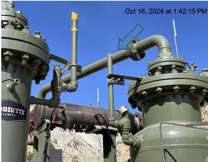
Photo # 6131 PRV vent line on FLOGISTIX compressor does not comply with CECMC pressure safety device rules