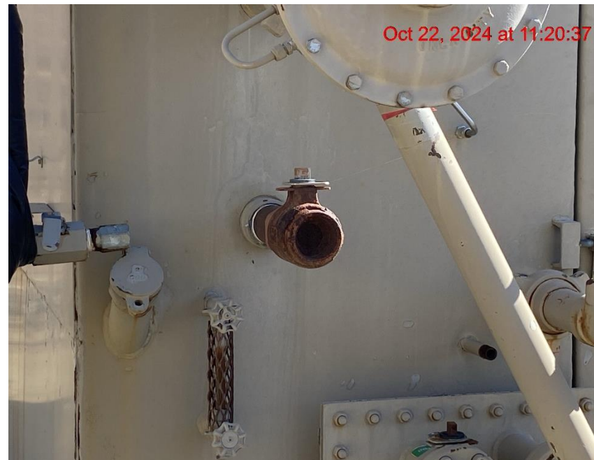
Open-Ended Line on Separators – Photo #04354