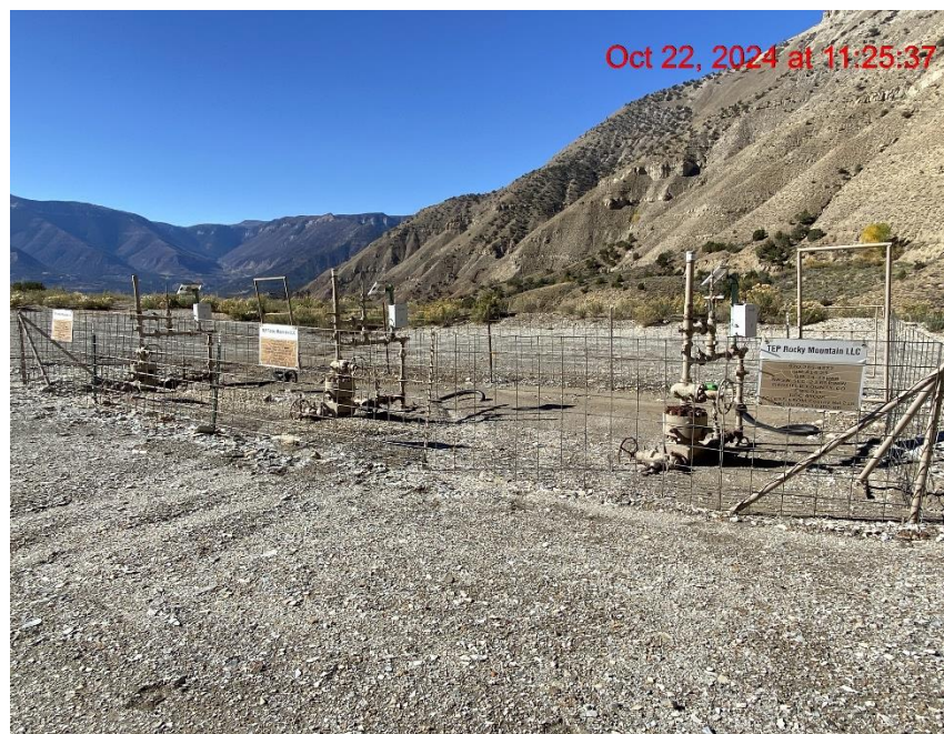
Wellheads – Photo #04360