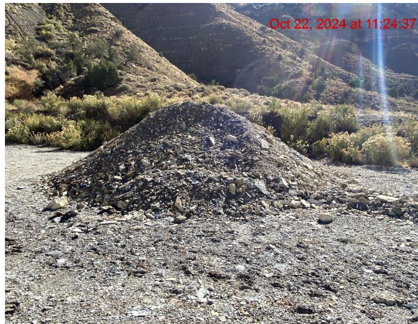
Unprotected Soil Stockpile – Photo #04359