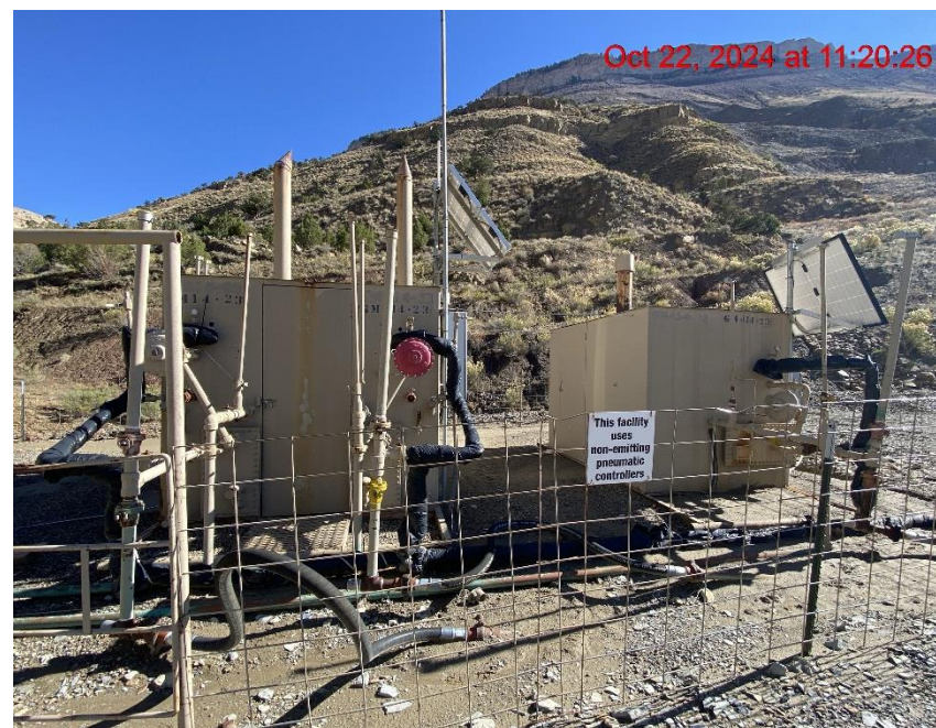
Separators – Photo #04353