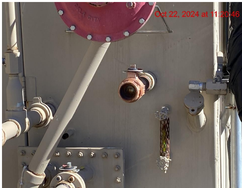
Open-Ended Line on Separators – Photo #04355