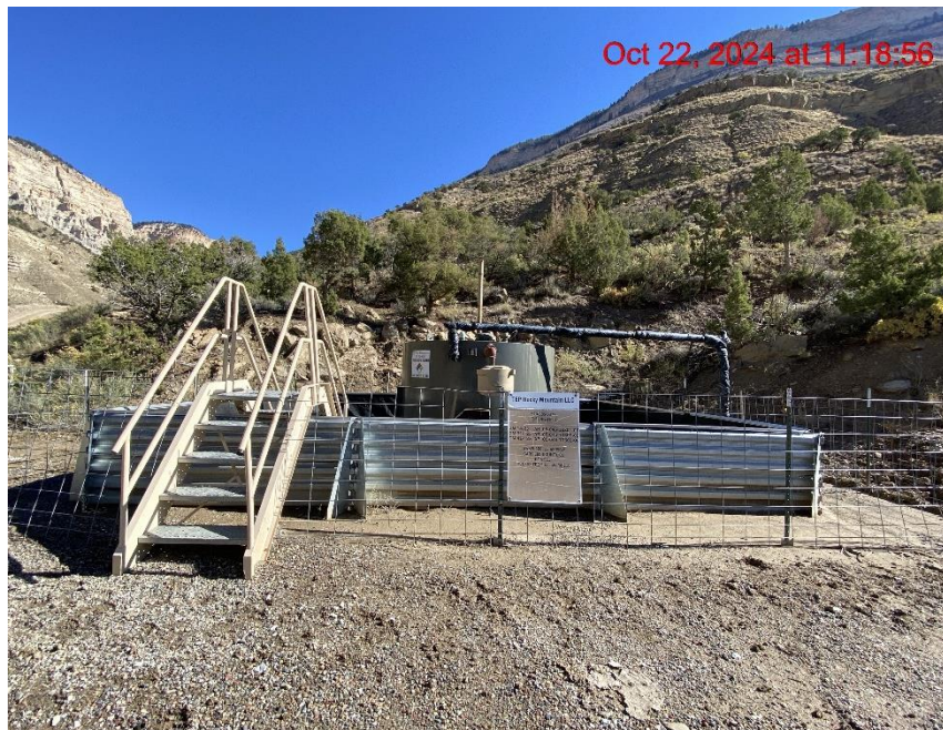
Tank Battery – Photo #04352