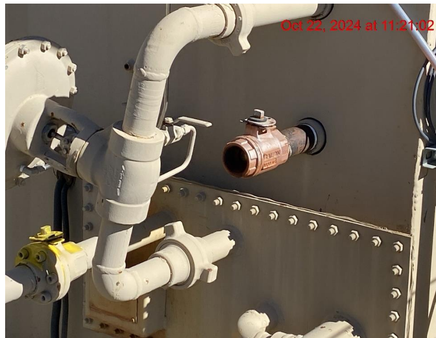
Open-Ended Line on Separators – Photo #04356