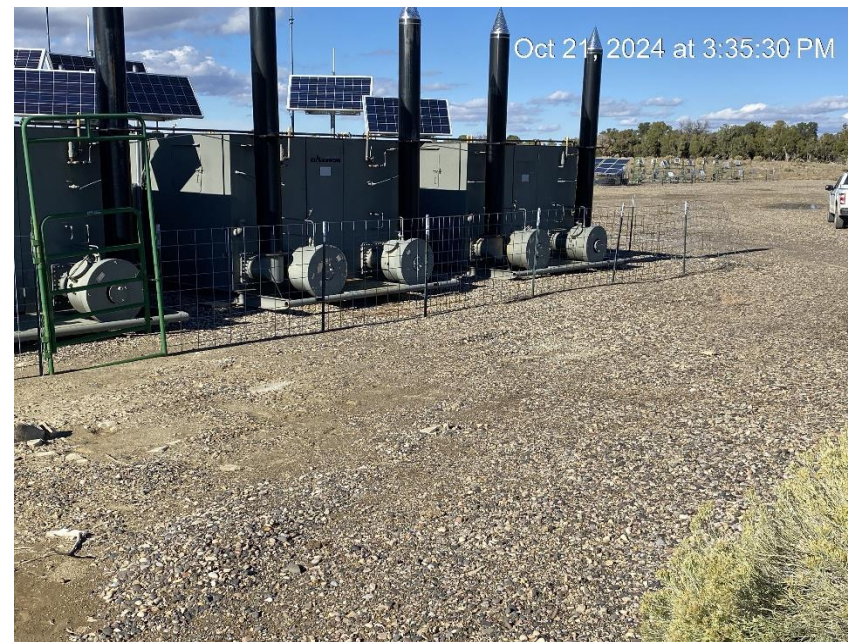
Location from Southwest corner