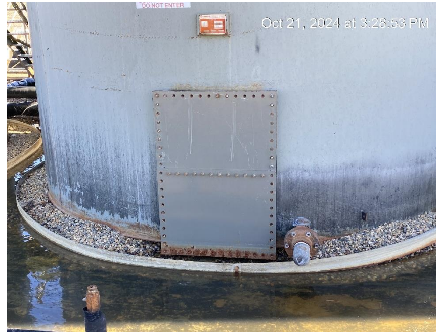
Tank out of service