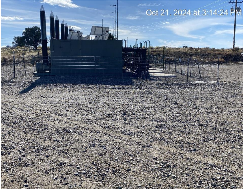
Separators from South entrance