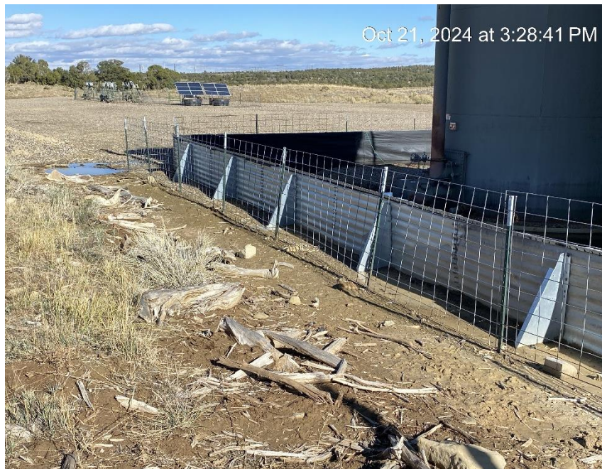
Location from Northwest corner