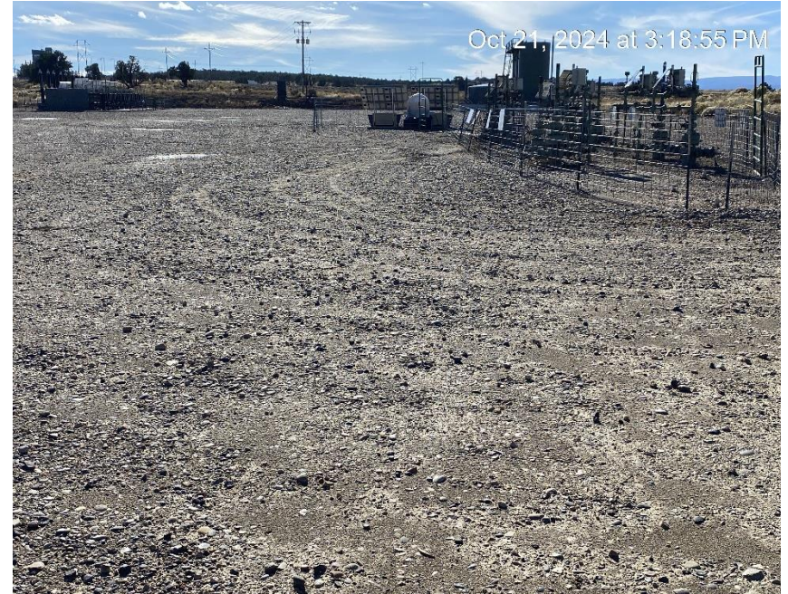
Location from Southeast corner