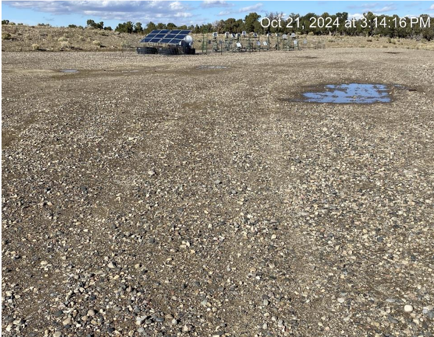
Wellheads from South entrance