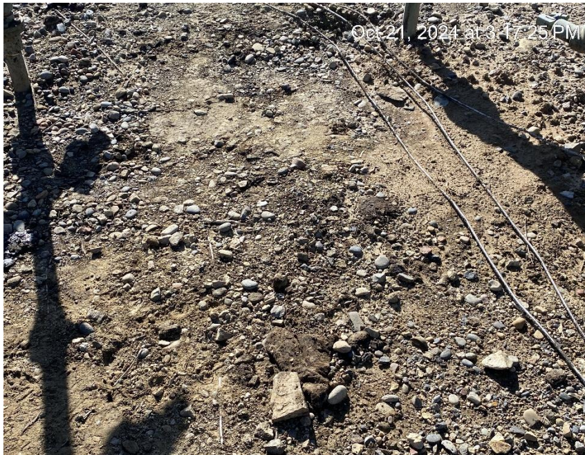
Oily waste and staining