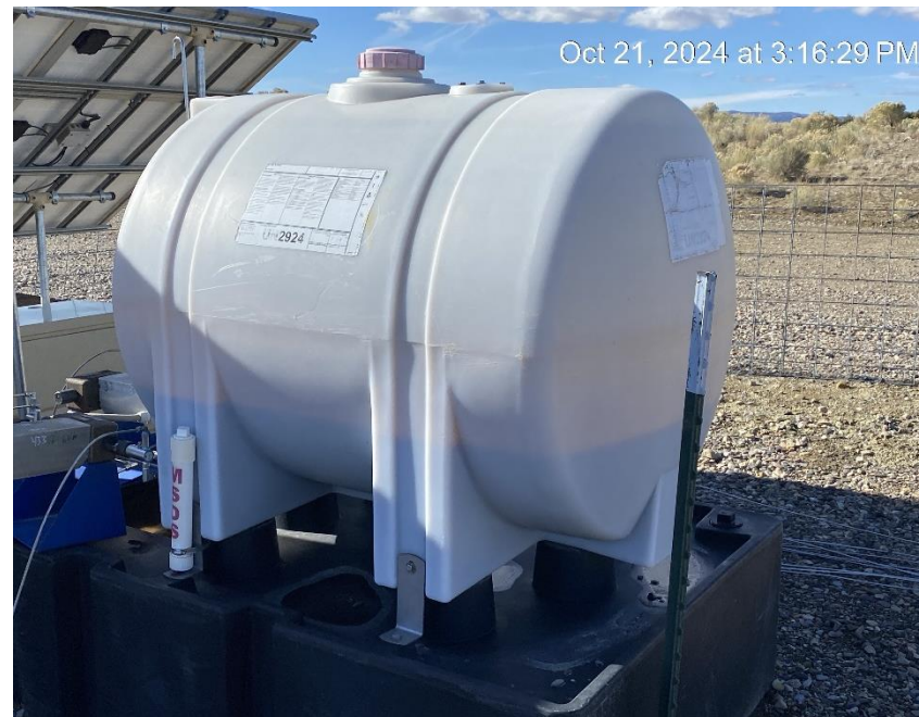
Faded and illegible labels