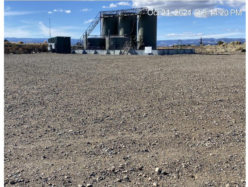
Tank battery from South entrance