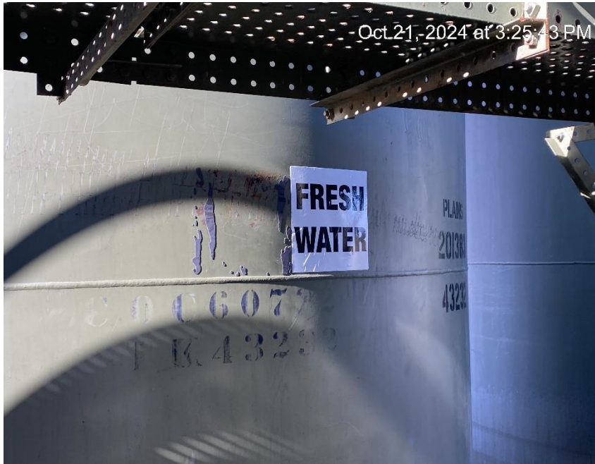
Tank out of service