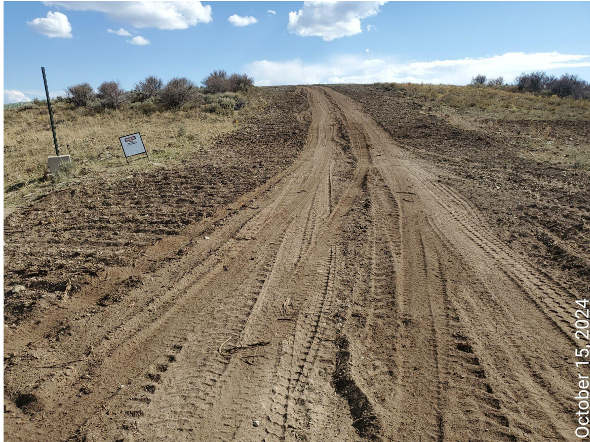
Photo 3: Photo shows access road leading to the support pad. Road remains evident.