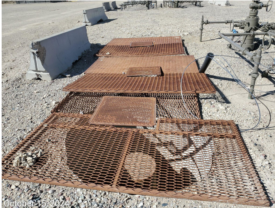
Photo 6: Photo shows conductors on Location have not been closed pursuant to Rule 406.e.(4).