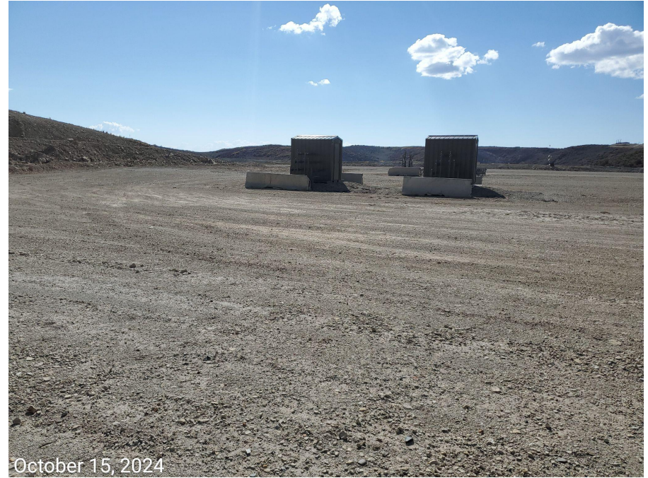
Photo 4: Photos 4-5 taken from the east end of the well location. Photos provide an overview from southeast, southwest, west to northwest. Photos show interim reclamation has not been performed.