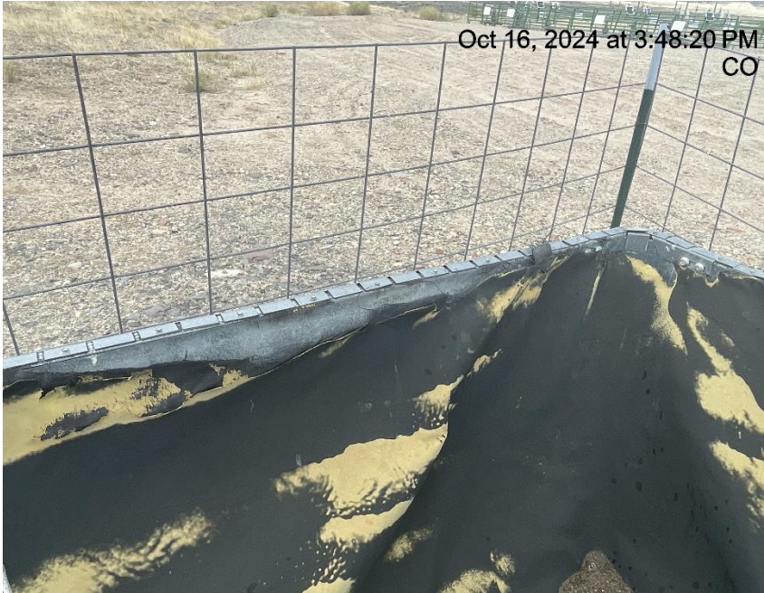
Photo # 6408 Secondary containment liner showing some signs of disrepair