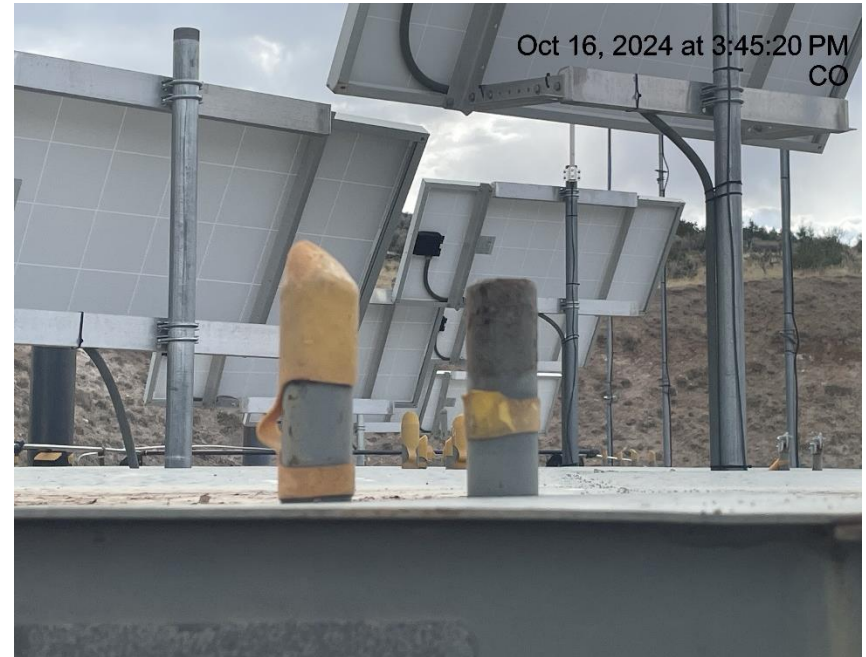
Photo # 6407 Rupture disc vent line does not comply with CECMC pressure safety device rules