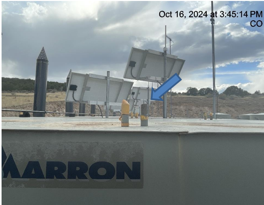
Photo # 6406 Rupture disc vent line does not comply with CECMC pressure safety device rules