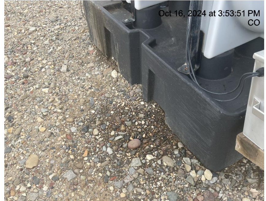
Photo # 6409 Small amount of staining near chemical tank containment