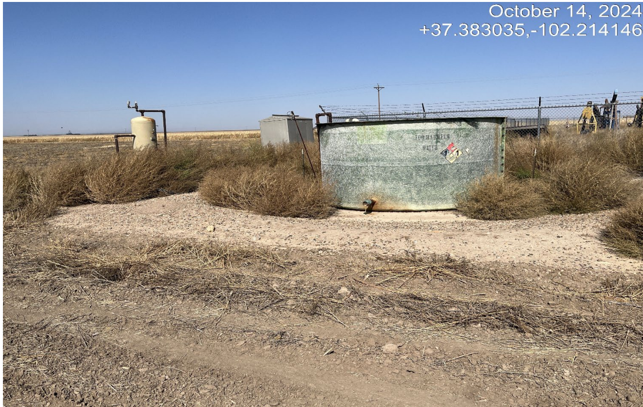
Photo 1. Facing northwest at the facility. The tank does not have secondary containment and the labeling is faded. There are weeds all around the equipment which is a fire hazard.