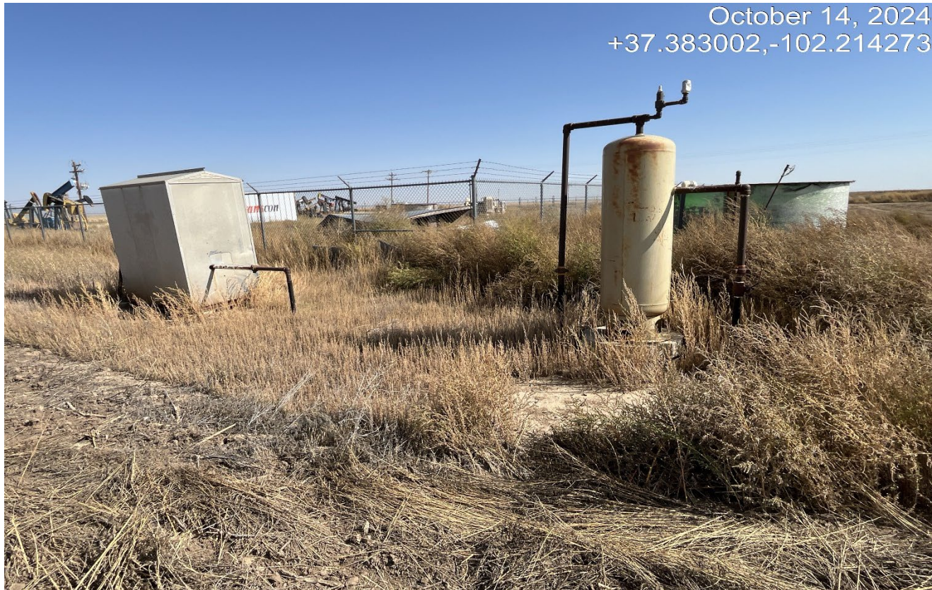
Photo 3. Northeast at the facility. There is a fenced in storage yard adjacent to this facility. Oil and gas equipment is being stored inside the fenced area.