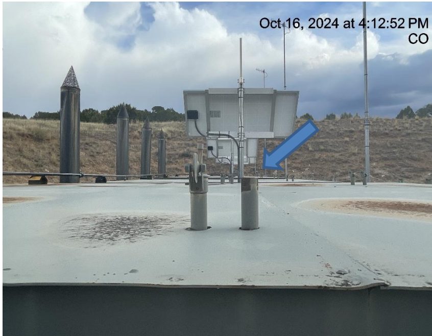
Photo # 6500 Rupture disc vent line does not comply with CECMC pressure safety device rules