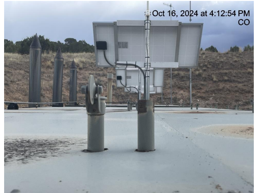
Photo # 6501 Rupture disc vent line does not comply with CECMC pressure safety device rules