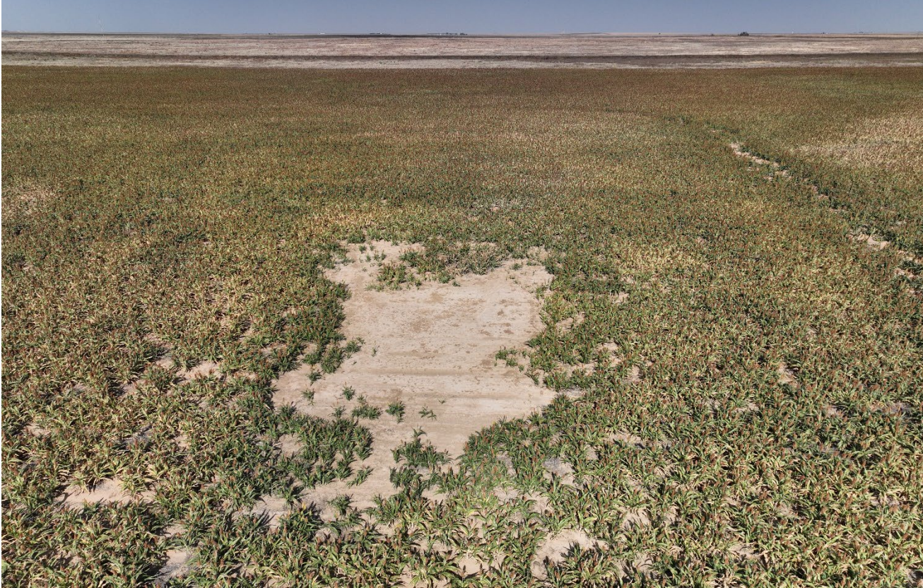
Photo 2. Drone aerial photo facing north. The crop has not established at the former wellsite. There appears to be impacted soils that will need to be remediated.