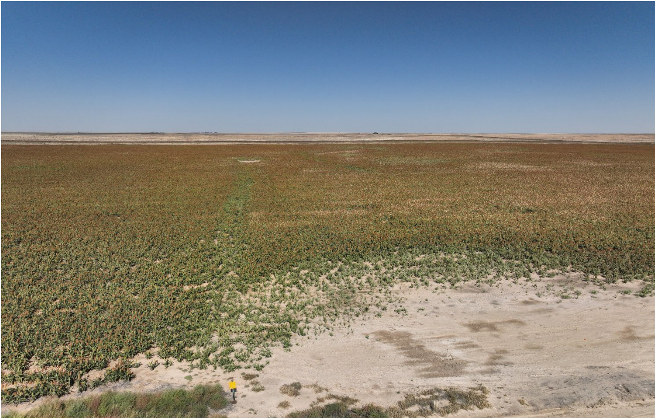
Photo 1. Drone aerial photo facing northeast at the associated tank battery location adjacent to the County Road. The crop has not established at the former tank battery. There appears to be impacted soils that will need to be remediated.