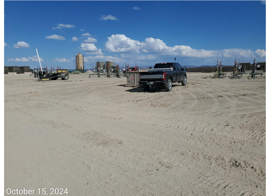
Photo 1: Photos 1-2 taken from the west end of the working pad surface. Photos provide an overview of the pad from north, northeast, southeast to south. Interim reclamation operators “in process” at time of inspection.