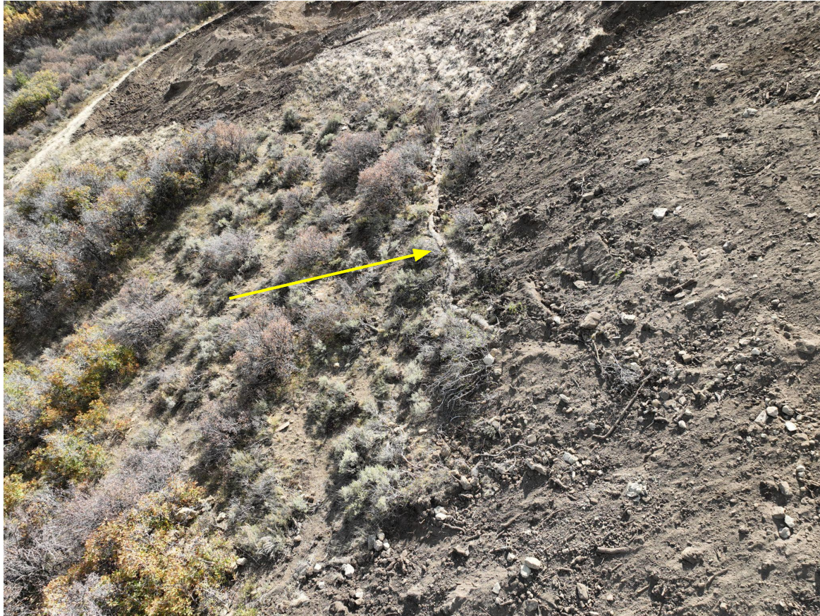
Photo 13: Photo taken with use of a sUAS during inspection. Photos taken from the east end of the of the location, facing south. Photos show perimeter stormwater and erosion control BMPs are missing or insufficient. BMPs previously implemented, including erosion logs (arrow), appear to have have either been removed, not maintained, or covered during current construction/interim reclamation operations.