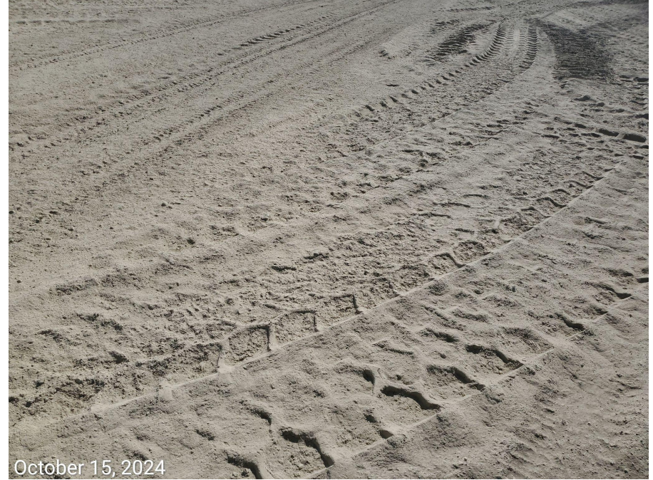
Photo 6: Photo example showing soils on the working pad surface are loose/powdery and at risk of becoming fugitive dust.