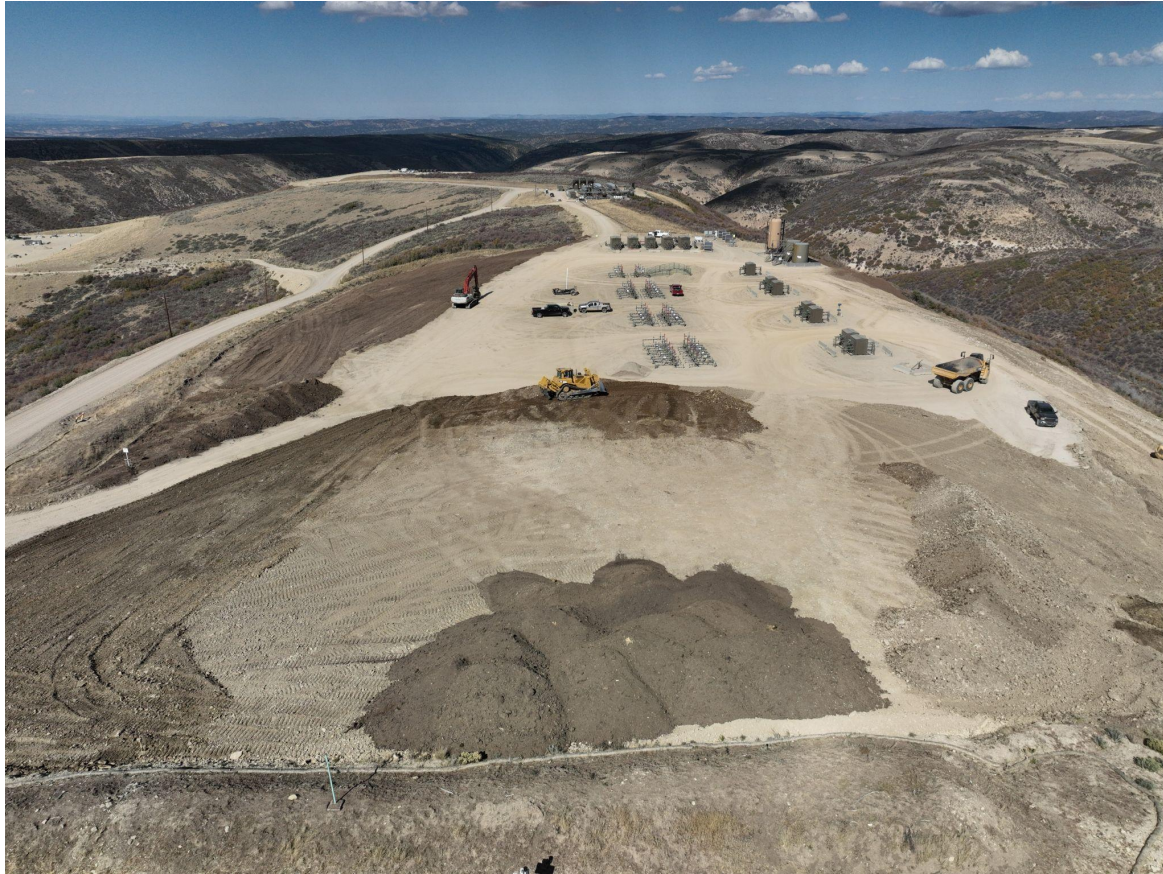
Photo 7: Photo taken with use of a sUAS during inspection. Photo taken south of the Location, facing north. Photo provides an overview of the Location, and shows interim reclamation activities “in process”.