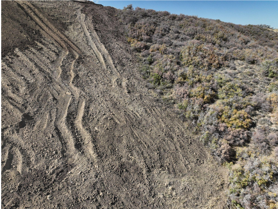
Photo 11: Photo taken with use of a sUAS during inspection. Photos taken from the northeast end of the of the location, facing northwest. Photos show perimeter stormwater and erosion control BMPs are missing or insufficient. BMPs previously implemented, including erosion logs, appear to have have either been removed, not maintained, or covered during current construction/interim reclamation operations.