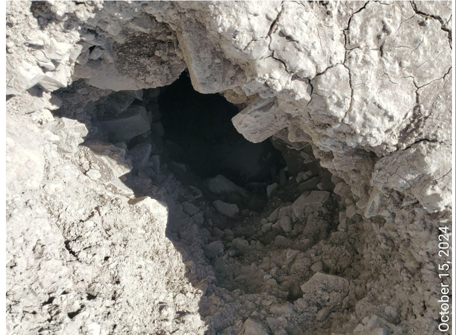
Photo 5: Photos taken from the northeast corner of the working pad surface. Photo shows a hole on the location; hole is approximately 2-3' x 1', depth is unknown. Hole requires safety fence/BMPs to prevent access by people of wildlife.