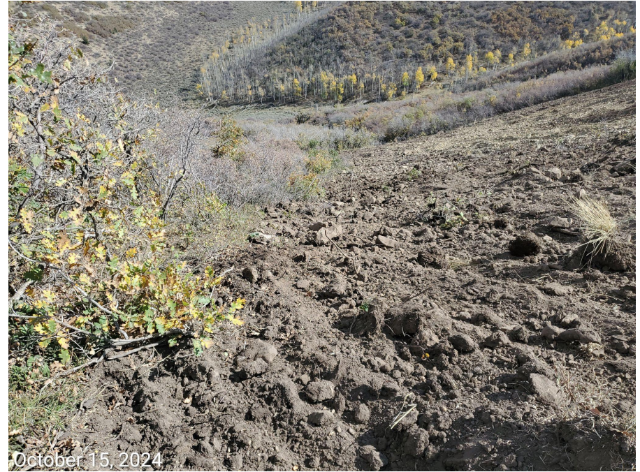
Photo 10: Photos taken from the interim areas on the northeast end of the Location. Photos show perimeter stormwater and erosion control BMPs are missing or insufficient. BMPs previously implemented, including erosion logs, appear to have have either been removed, not maintained, or covered during current construction/interim reclamation operations.