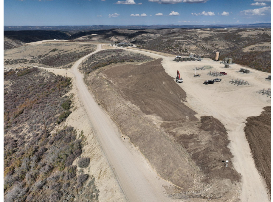
Photo 8: Photos taken with use of a sUAS during inspection. Photos provides an overview of the Location, and shows interim reclamation activities “in process”.