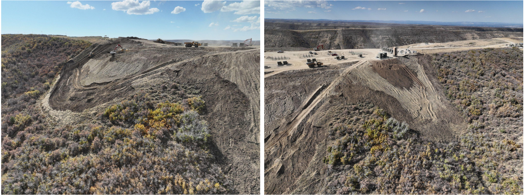
Photo 9: Photos taken with use of a sUAS during inspection. Photos taken from the east of the of the location, facing southwest/northwest. Photos provides an overview of the Location, and shows interim reclamation activities “in process”.