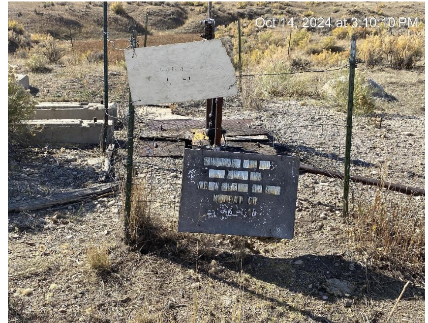
Wellhead sign illegible and incomplete