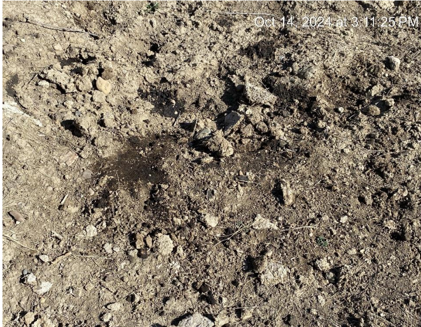
Oil seep covered with soil