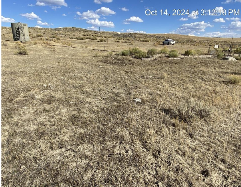
Location from Northwest corner