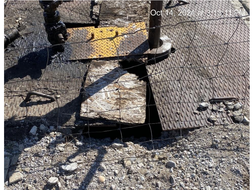
Cellar open to wildlife