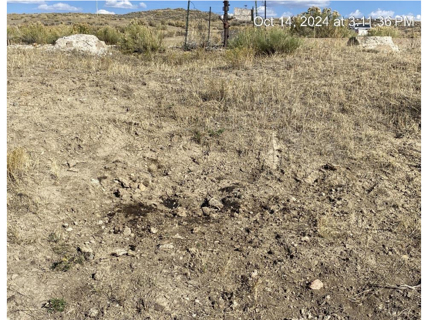
Location of oil seep on downhill slope to creek drainage