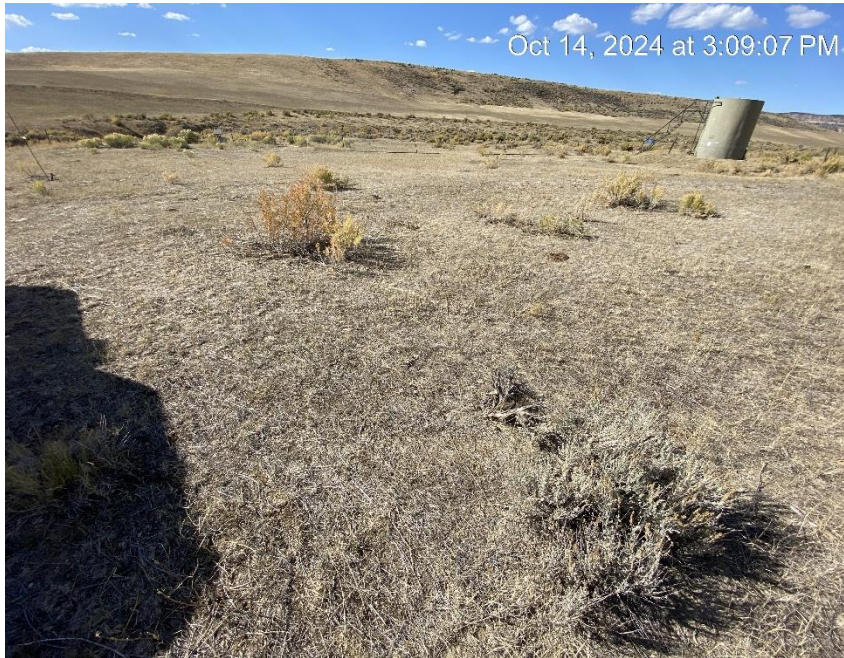
Location from Southeast corner