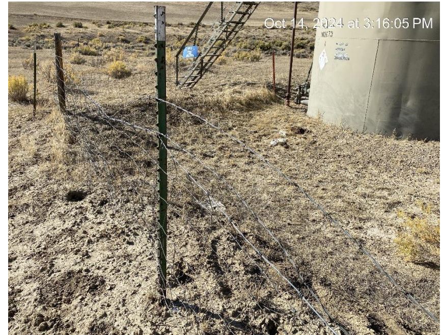
Inadequate tank berm