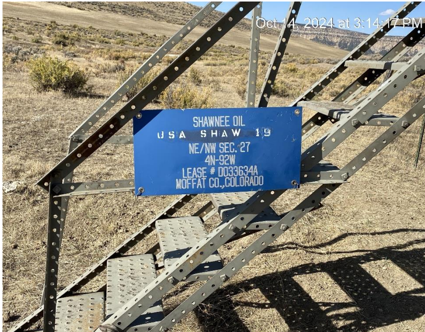
Incomplete sign at tank battery