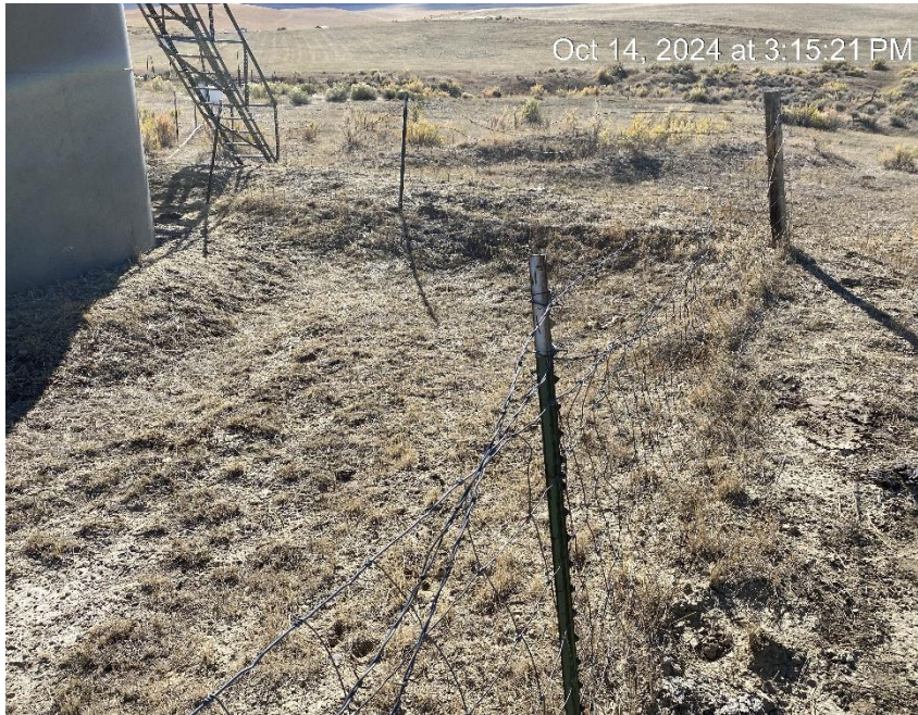
Inadequate tank berm