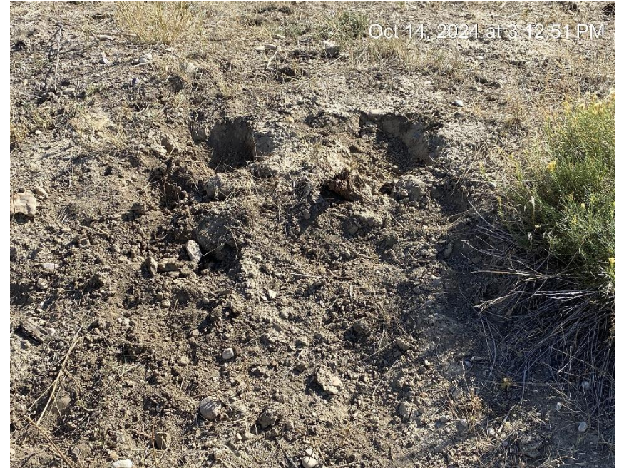
Soil removal to cover oil seep