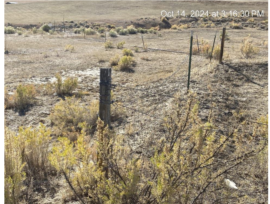
Location from Northeast corner