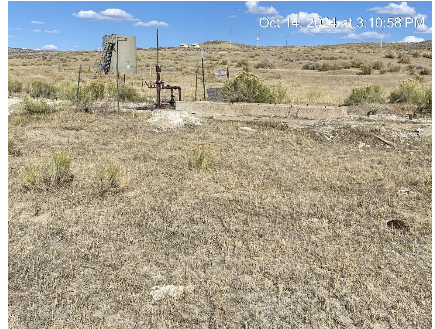
Location from Southwest corner