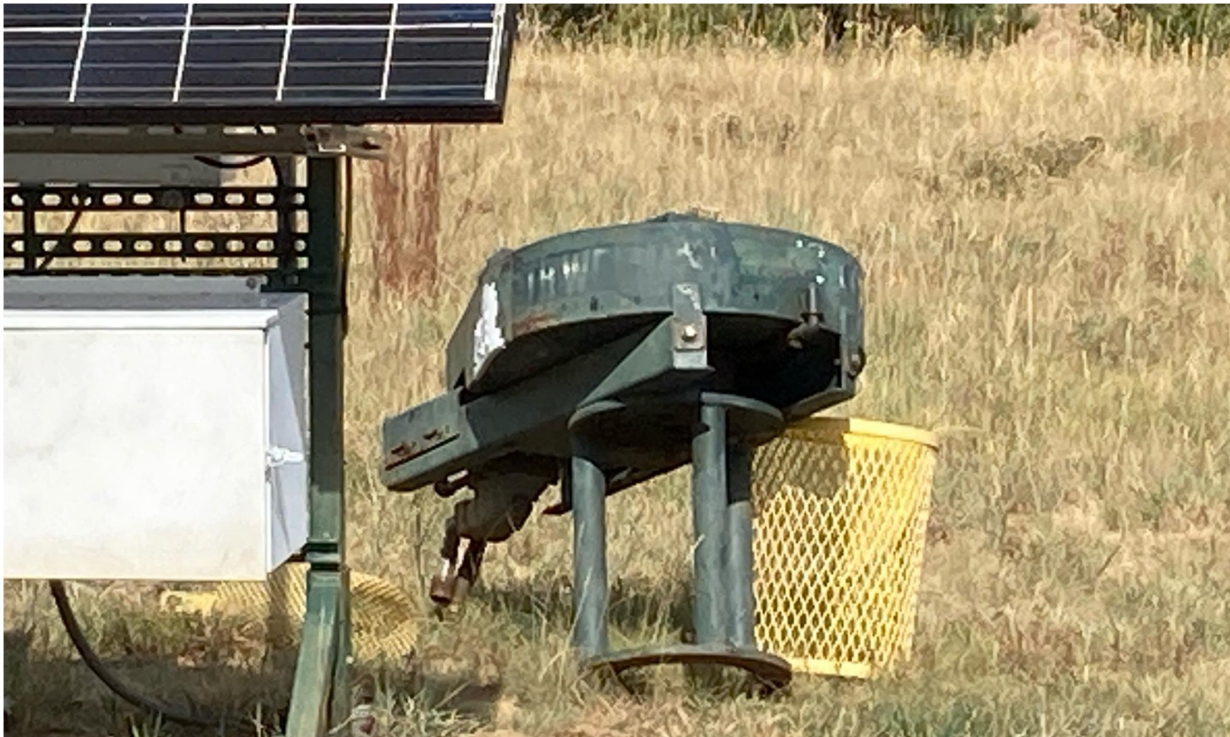
PHOTO 4: UNUSED EQUIPMENT STORED ON LOCATION (DRIVEHEAD). REMOVE UNUSED EQUIPMENT PER RULE 606.