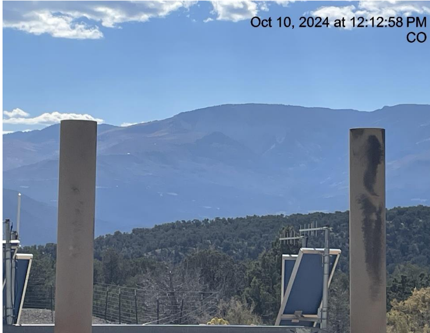
Photo # 4782 Burner exhaust stacks on separator units lack bird protection/wildlife hazard