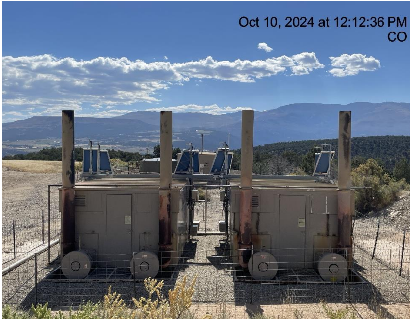
Photo # 4780 Burner exhaust stacks on separator units lack bird protection/wildlife hazard