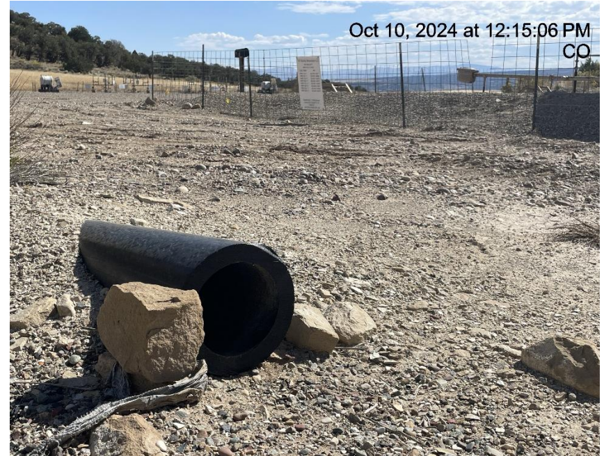
Photo # 4783 Open ended piping/available for entry by wildlife/wildlife hazard