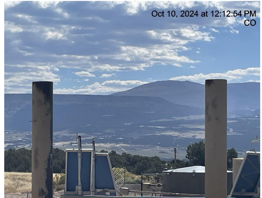
Photo # 4781 Burner exhaust stacks on separator units lack bird protection/wildlife hazard