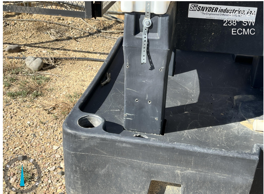
Photo 12. Photo taken at the wellhead, facing southwest. Photo illustrates wildlife protection devices were missing from equipment. Comply with Rule 902.b.