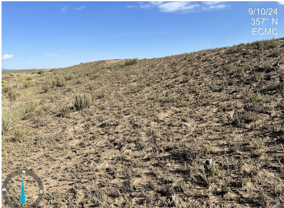
Photo 3. Photo taken from the eastern interim reclamation area, facing north. Photo illustrates topsoil stockpile, with weed growth (e.g., Russian Thistle) present and little to no perennial vegetation established. Silt fence was removed. Comply with 1002 Rules.