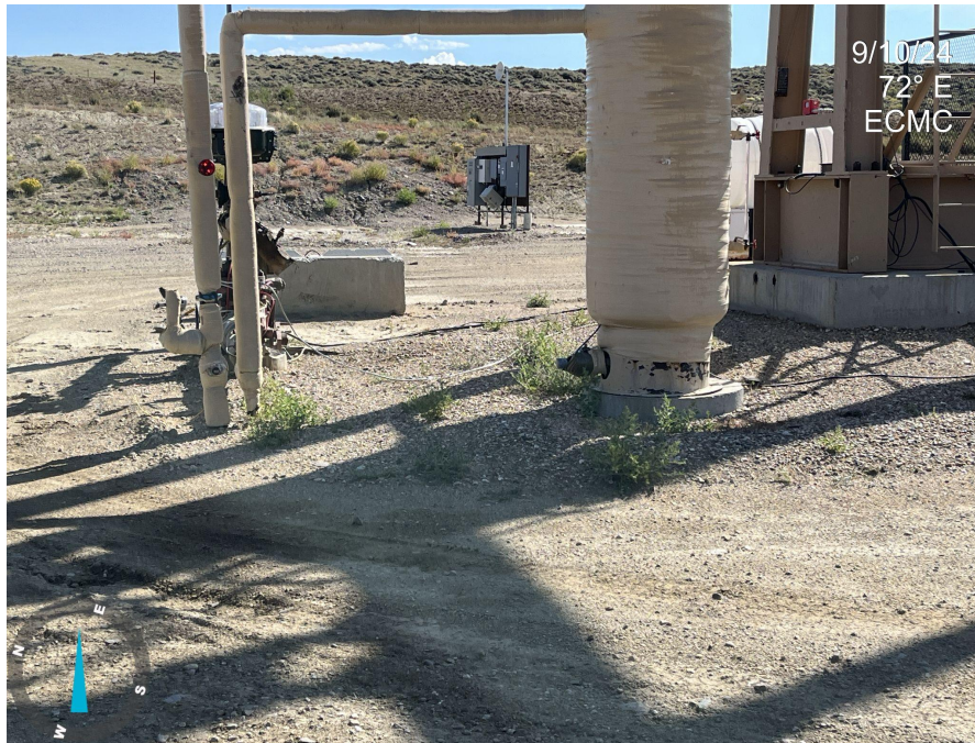
Photo 11. Photo taken from the western working pad surface, facing east. Photo illustrates weeds at the wellhead.