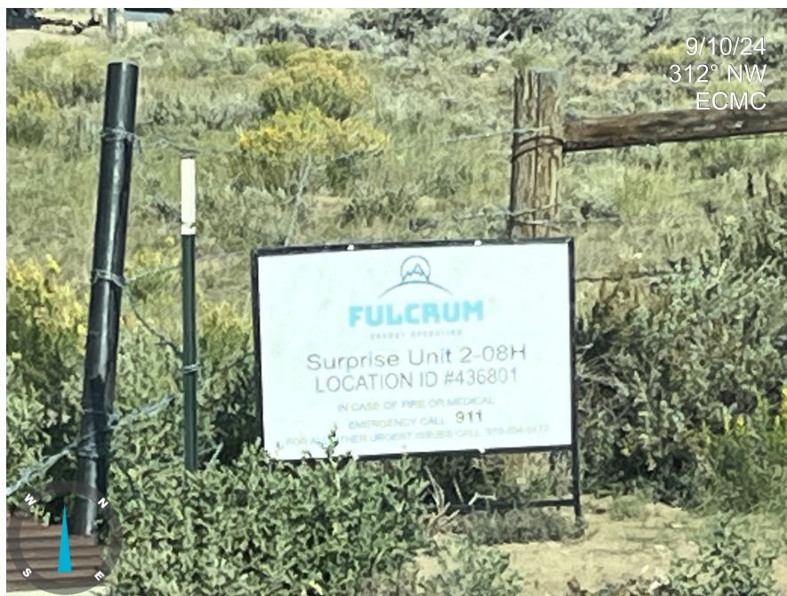
Photo 1. Photo taken from the entrance of Location. Photo illustrates the Location Operator sign.