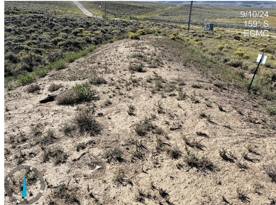
Photo 4. Photo taken from the eastern topsoil stockpile, facing south. Photo illustrates topsoil stockpile, with weed growth (e.g., Russian Thistle) present and little to no perennial vegetation established. Silt fence was removed.