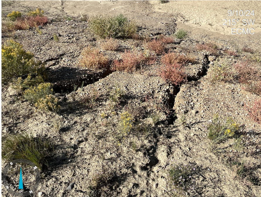
Photo 7. Photo taken from the top of the topsoil stockpile, facing SW. Photo illustrates topsoil stockpile is not properly stabilized, with evidence of erosion. Comply with 1002.c.