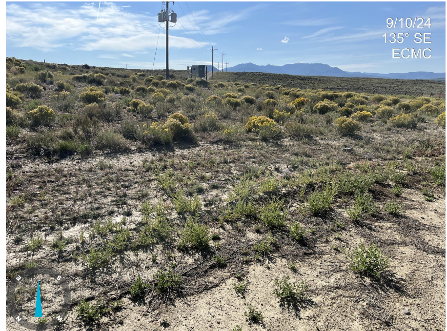
Photo 6. Photo taken from the eastern interim reclamation area, facing southeast. Photo illustrates that interim reclamation has not occurred along this portion of the pad. Comply with Rule 1003.