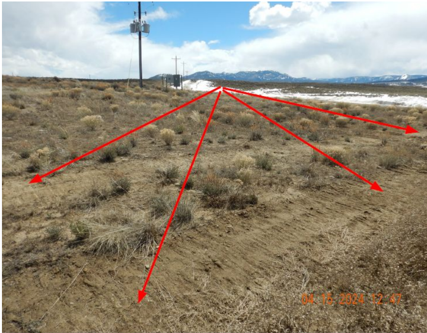
Photo 5. Photo taken 4/15/24 from the eastern interim reclamation area, facing southeast. Photo illustrates disturbances related to remediation project.