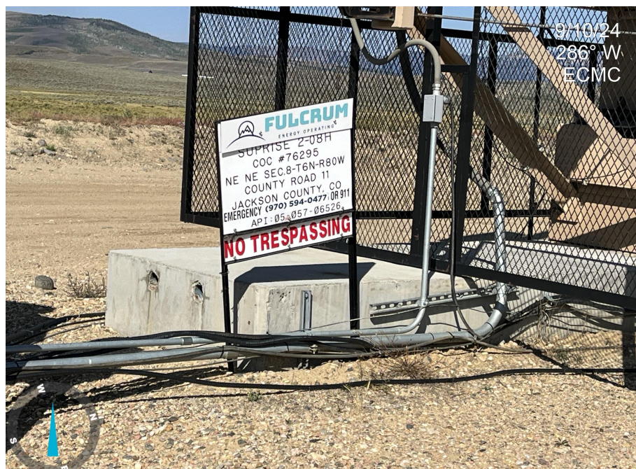
Photo 2. Photo taken from the wellhead. Photo illustrates that API was added to well signage.