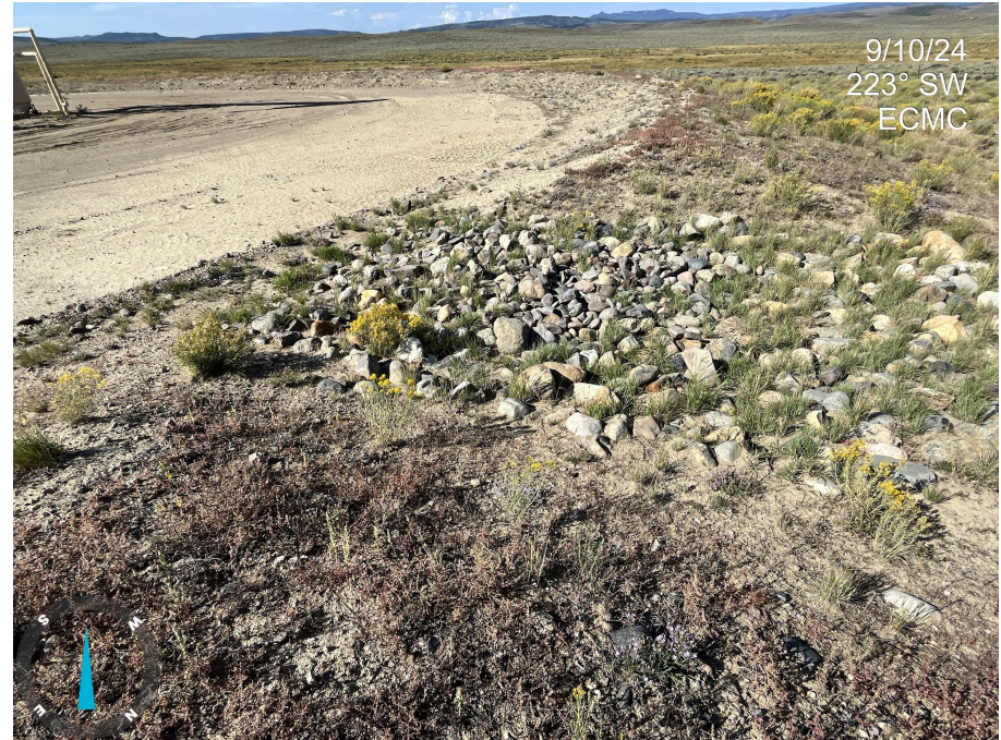
Photo 8. Photo taken from the eastern portion of working pad surface area, facing SW. Photo illustrates that the sediment trap is not functioning properly. Comply with Rule 1002.f.