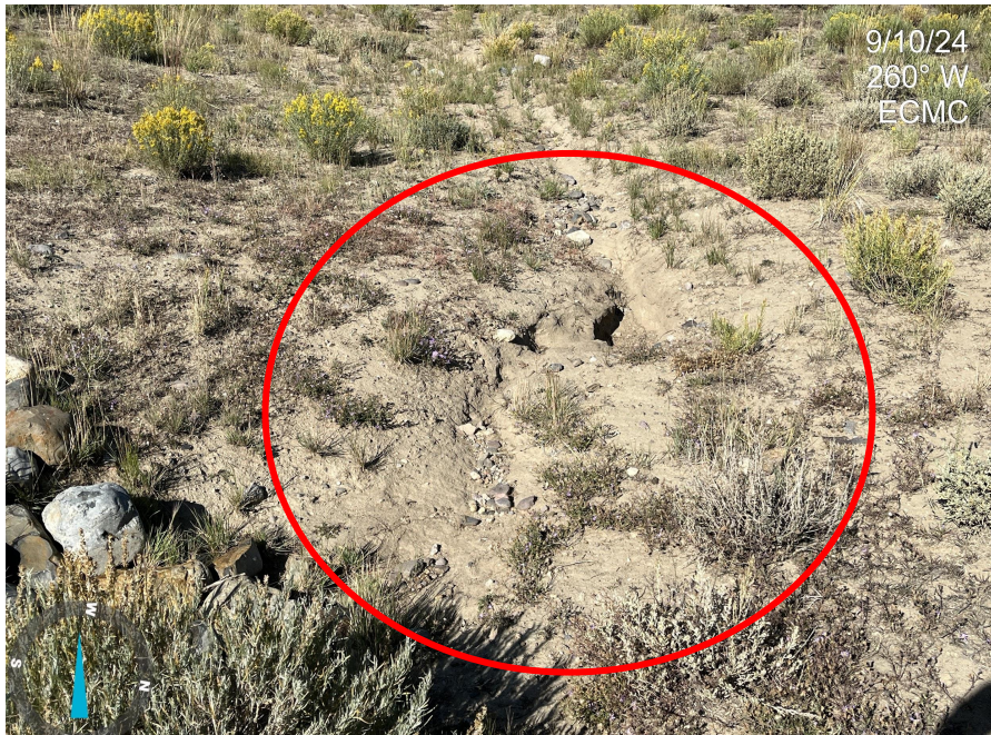
Photo 9. Photo taken from the eastern working pad surface, facing west. Photo illustrates erosion downhill from sediment trap revegetation of the fill slopes are in process. Operator shall continue to monitor and manage until Location reaches 1003 standards.